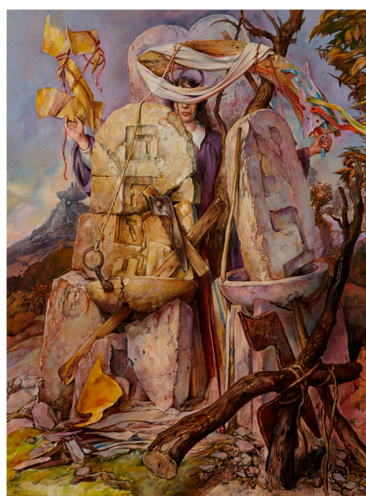
Figure 7. By Law , 2015, BK 1930, Oil on canvas, 48 × 36". By permission of Pucker Gallery.