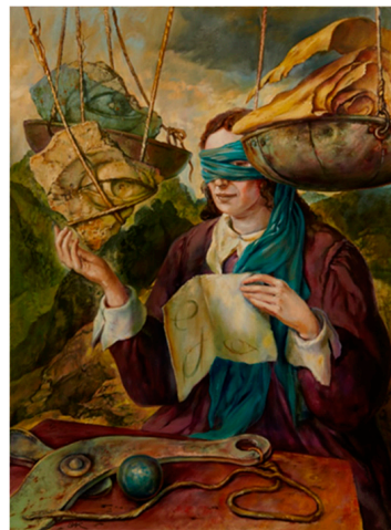
Figure 8. Scripture , 2015, BK 1938, Oil on canvas, 40 × 30". By permission of Pucker Gallery.

lofty promises of Enlightenment and biblical justice have not been realized, where delay and denial are the reality, and restitution unachievable. We should resist the temptation to reduce these icons of Just Is to Bak's psychological neediness but instead see them as fortifying acts of memory and moral courage. They encourage us to stand up to an atrocity universe with heightened moral realism and honesty, no longer suffering under a romanticized illusion of iconic Lady Justice and talionic restitution. Art that remembers suffering is art that "stand[s] upright before justice" (Adorno 1985, p. 314). Bak's artwork holds out hope for this possibility.