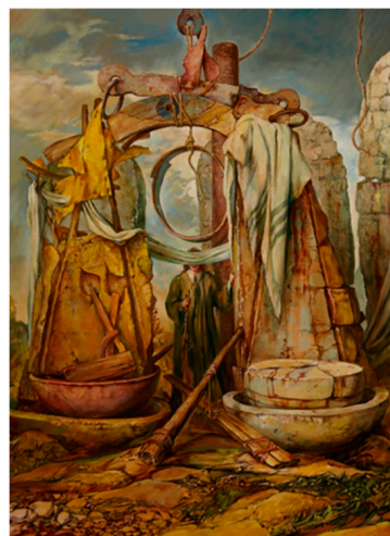
Figure 9. Ever Ready , 2015, BK 1942, Oil on canvas, 40 × 30". By permission of Pucker Gallery.

Bak explores this possibility in Long Lasting (Figure 10) where we catch a commanding view of the atrocity universe surrounding iconic Lady Just Is . Retrieving another favored image, Bak fashions the Holocaust world as a pear peeled apart to expose its sphere cored out, its central contents exploded before our very eyes. The traditional hoped-for restoration of God's universal justice ( mishpat ) and righteousness ( tzedekah ), appears now an empty dream, a permanent disjuncture from the present reality of damaged life. In this arid setting Amos's vision of rolling waters and ever-flowing stream of divine justice seems little more than a pipe dream, some opiate-induced hallucination needed to escape from reality.