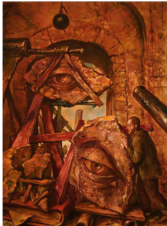
Figure 1. N Eye for N Eye , 2015, Bk1971, Oil on canvas. 16 × 12". By Permission of Pucker Gallery.

For example, in his H.O.P.E. series he imbeds the word “HOPE” and in his Still Life series the words “Still Life” amid scenes of devastation and daily life to intensify the tensions between word and image, past and present, life and death. 17 In his Just Is series we see a comparable word play in “N Eye for N Eye” where letter and number literally serve as supporting timbers that structure the painted eyes on canvas and challenge the viewers’ eyes in reading the painting. See Figure 1.