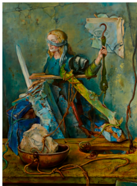
Figure 3. By Hook , 2015, BK1939, Oil on canvas, 40 × 30". By permission of Pucker Gallery.

In By Hook (Figure 3) we encounter Lady Justice in pieces, her body a diminished version of her former iconic self. She no longer stands in her revered place atop the public courthouse dome; instead, we find her fragmented upper torso precariously balanced on a wooden slat atop a stone heap. With arm severed at the elbow, she still manages by hook or by crook to maintain herself and the balance handle upright, quite an impressive balancing act. The configuration gives an ironic twist to a variant of King's maxim—"The moral arc of the universe bends at the elbow of justice." Our eye is drawn to the many eyes that dot the canvas inviting us to connect the dots not only between the lex talionis and Lady Justice but both to the scene of wreckage. The slipped blindfold exposes her eye gazing out beyond the canvas frame suggesting Lady Justice is aware of her predicament, which may serve as an analogy to the predicament Bak as artist faces after atrocity: Is she able any longer to stand upright and perform her juridical duties impartially in the midst of such ruin? Is she up to the balancing task? Is Bak's art up to the task of representing injustice in ways that refuse to be impartial to the suffering it expresses in such radiant colors, textured details, and paradoxical configurations? What is the balance art must achieve between the beautiful and the barbaric?