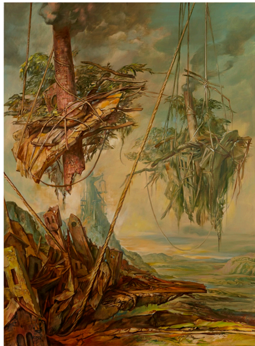
Figure 4. Inadmissible , 2015, BK 1931, Oil on canvas, 48 × 36".

on this scale. 29 The weight of suffering pictured here defies every measure of meaning and morality, the math too severe to account for the empirical reality.