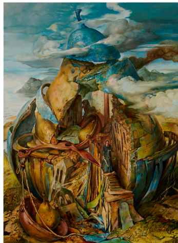
Figure 10. Long Lasting , 2015, BK 1941, Oil on canvas, 40 × 36". By permission of Pucker Gallery.