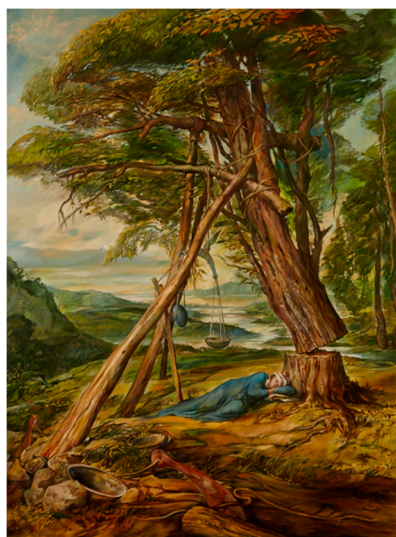
Figure 6. Nap , 2015, BK 1929, Oil on canvas, 48 × 36". By permission of Pucker Gallery.