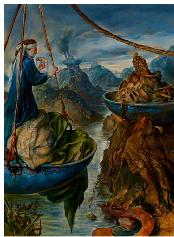
Figure 5. Taking Off , 2015, BK 1936, Oil on canvas, 40 × 30".

above the devastation spread beneath and around them. Is this elevated spot her new improvised courthouse perch? If, as we saw in Inadmissible (Figure 4), Lady Justice was able to avoid seeing, now she has little choice, and so too her talionic partner. With mask in hand, Lady Justice peers out over the flooded chasm below suggesting that after the cataclysm the masquerade of innocent justice and the pretense of impartiality is over. The detached, matching balance pan holds the remnants of a once vital community that iconic Lady Justice and the lex talionis were in principle charged with, but proved ultimately ineffective in, protecting. Bak paints a graphic reminder that purported icons and principles are only effective when they actually protect; social structures can readily turn a blind eye to, and even become actively complicit in, the worst as the vaunted German legal system and the volkisch German Christian movement amply demonstrated in their advocacy of Nazi genocidal goals. Theological traditions, enlightenment narratives, and legal systems have cultural and historical roots. How do we gain sufficient critical perspective on ours to see the material reality of injustice in front of us?