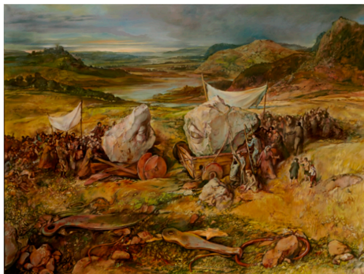
Figure 11. Eye for an Eye , BK 1932, Oil on canvas, 36 × 48". By permission of Pucker Gallery.

From a different perspective we might see instead two opposing parties raising the iconic white flag of peace with the implications that the violence toward the other has given way to being for not against the other—an eye for an eye. If so, we can imagine that the crowds might see, perhaps for the first time, the consequences of taking justice, the narratives of freedom and salvation, and their supporting icons into their own hands and have pulled back from the brink. Is it possible we are witnesses to a scene of collaboration, not confrontation, in which the crowds have linked their individual eyes together in a promising act of community and a parallax moment of shared vision? A single eye on its own is incapable of discerning distance or depth; depth perception requires two eyes working together, one with and for the other. It is a promising thought. However, even with two eyes perception is not always assured. It Just Is possible that despite best intentions the vision may not be clear enough, that thinking in contradictions may not be critical enough, and the art may not witness effectively enough to remember the suffering. That possibility also exists. As Bak's two eyes turn toward us he asks if we see the uncertainty but also the possibility of life in a damaged world.