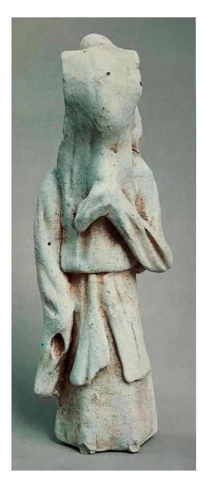
Figure 5. Portrays an image of a woman from the Song Dynasty wearing a "daigaitou" head covering. It is derived from the wooden figurines unearthed from the Song tomb at Sensen Village, Taizhou, Jiangsu Province, providing evidence of the custom of wearing "gaitou" during the Southern Song Dynasty. It is displayed at the Jiangxi Provincial Museum.

the "xiniang" (bride's attendant) responsible for caring for the bride and the "binxiang" (groom's companion) accompanying the couple (Suo 2002).