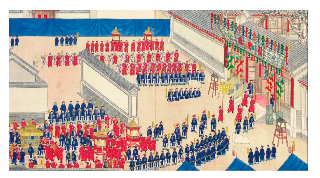
Figure 3. An excerpt from the painting "Ceremony of Enthronement and Welcoming". It is displayed at the Palace Museum.