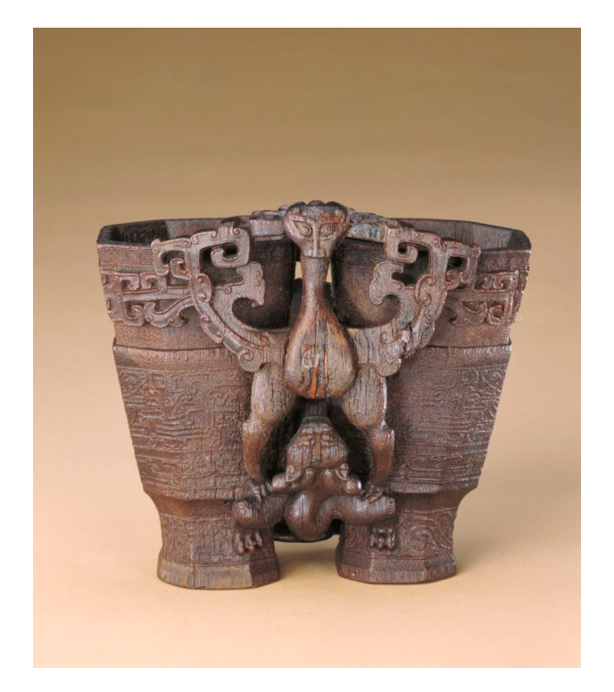
Figure 6. Depicts a rhinoceros horn carving of a combined cup with the motif of an eagle and a bear. It measures 13.2 cm in height, with a diameter ranging from 15 to 6.7 cm at the mouth and a foot diameter ranging from 10.4 to 3.4 cm. The cup is designed in a double-linked style, with an octagonal shape, slanted straight walls, and a high foot. Photo source: the official website of the Palace Museum<sup>16</sup>.

tent is flexible, depending on the weather. "Xinlang Shejian" refers to the groom shooting arrows towards the gate of the sedan chair after the bride arrives at the groom's house. The bride can only descend from the sedan chair after three arrows have been shot. This custom also originates from Manchu traditions. "Huimen Huijiu" signifies the bride's return to her family's home after the wedding. "Huimen" refers to the three days after the wedding, while "Huijiu" refers to the nine days after the return.