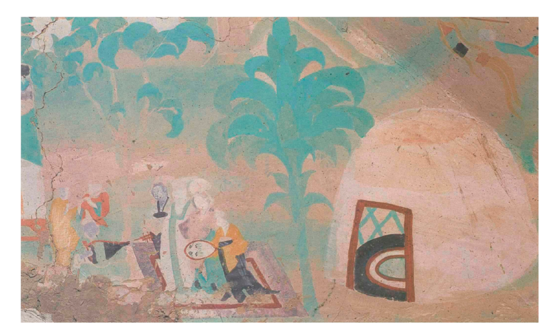
Figure 4. Depicts the "Qinglu" painting on the northern slope of Cave 186 in the Mogao Grottoes during the middle Tang Dynasty.

With ethnic integration during the Tang Dynasty (618–907), a large number of northern ethnic minorities migrated to the Central Plains region, cohabiting with the Han Chinese and gradually assimilating into the local culture. Interethnic marriages became common, and as a result, the wedding customs of the northern ethnic minorities directly influenced the wedding customs of the Central Plains ethnic groups (Shen 2012). In the Tang Dynasty, a trend emerged of blending folk wedding customs with those of the northern ethnic minorities. Scenes depicting wedding ceremonies among the common people during the Tang Dynasty can be found in Dunhuang literature, mural depictions, and other sources. The Hun Shi Cheng Shi 婚事程式 documented the inclusion of customs such as Cui zhuang (applying the bride's makeup), Zhang che (blocking the carriage), and Cui hua Que shan (presenting flowers and fan-waving) in the wedding rituals of ordinary people during the Tang Dynasty. Additionally, the "Youyang Zazu 酉陽雜俎" also recorded changes in the wedding procession, shifting from dusk to early morning, and the wedding chamber venue transformed into a "Qing lu," also known as the "Hundred Sons Canopy (百子帳)," a tent-like structure made of green cloth (see Figure 4), resembling the domed dwellings of northern ethnic minorities, and incorporating customs such as Nong xu, Hejin (合卺), and Heji (合髻) (Duan 1987).