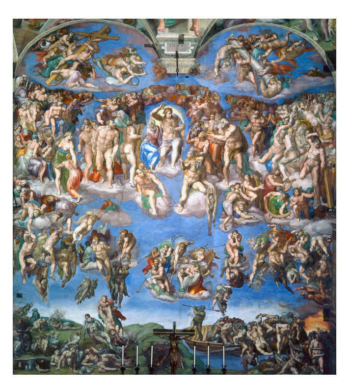
Figure 1. Michelangelo, Last Judgment . Sistine Chapel, Vatican. Public Domain: https://en.wikipedia.org/wiki/The_Last_Judgment_(Michelangelo)#/media/File:Last_Judgment_(Michelangelo).jpg (accessed on 31 October 2023).