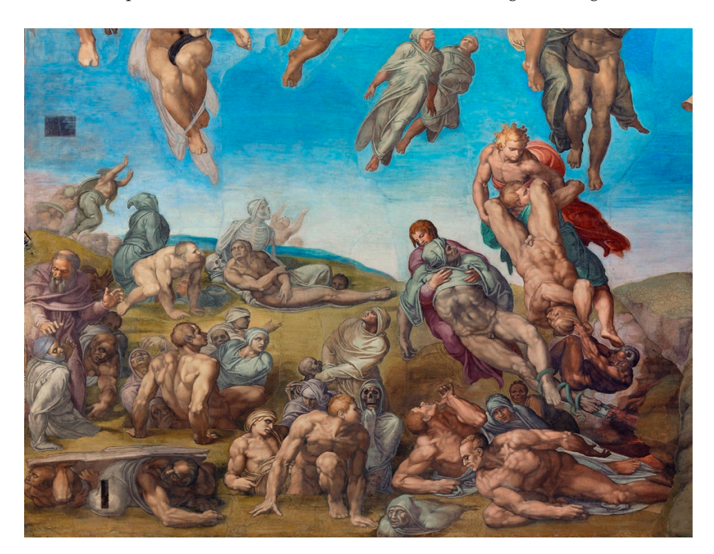
Figure 6. Detail form the Last Judgment : Resurrection of the Dead. Public Domain: https://en.wikipedia.org/wiki/The_Last_Judgment_(Michelangelo)#/media/File:Michelangelo,_giudizio_universale,_dettagli_35.jpg (accessed on 31 October 2023).

Contradictions and inconsistencies like these frequently undermine Ruggiero's attempts to identify Michelangelo's "errors", since he is often unable to convincingly refute his interlocutor's objections. One of Ruggiero's first criticisms, as mentioned above, regards the varied expressions and states of embodiment of the rising dead (Figure 6):