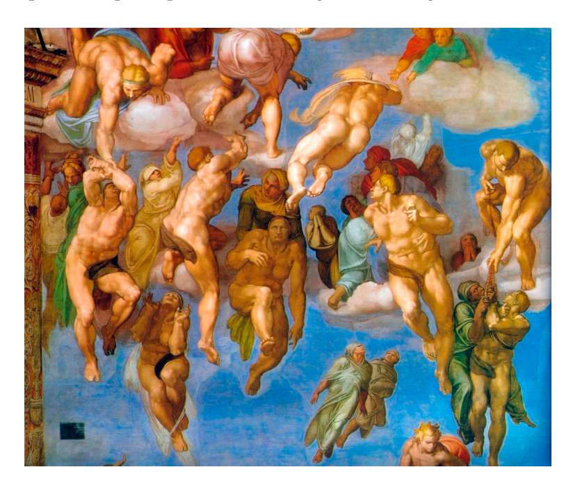
Figure 7. Detail from the Last Judgment : The Elect. Public Domain: https://en.wikipedia.org/wiki/The_Last_Judgment_(Michelangelo)#/media/File:Michelangelo,_giudizio_universale,_dettagli_33.jpg (accessed on 31 October 2023).

uncertainty about the state of their own soul. He reads that uncertainty as entailing a kind of existential suspension within the ongoing process of the "strange things" with which life presents us. Michelangelo's decision to create a fiction whereby the rising dead are not yet certain of their judgment, therefore, invests this moment with greater and more immediate religious significance than if the scene had been literally rendered, since it opens viewers to their own "movement" through life. Similarly, when Ruggiero describes as "ridiculous" Michelangelo's decision to show angels fighting with devils and devils wrestling with sinners, since physical force would have no place on the day of judgment, Vincenso argues that, "I think it was done to show how evil spirits are always tempting us and battling with us, and how we are defended by angels" (Gilio 2018, p. 175). Vincenso's point is that in this case, too, Michelangelo's "fiction" serves to present salvation history as a very real process the viewer is immediately and constantly involved in. Here, too, scenes that have been criticized as self-referential performances of artistry are defended as essential to the spectator's participation in their religious meaning.