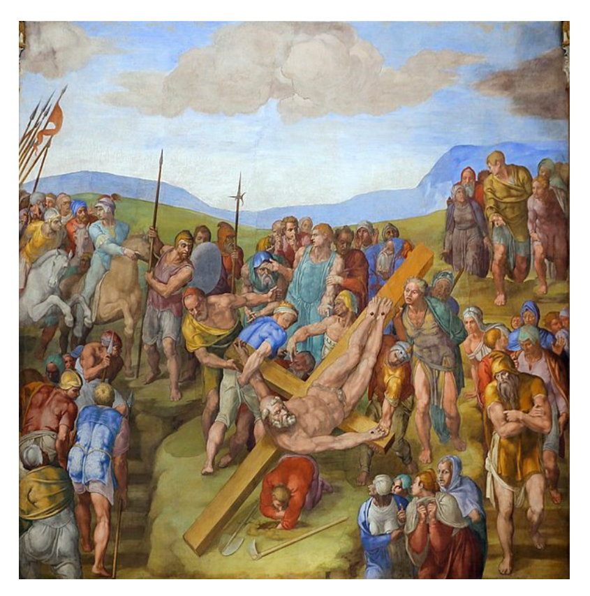
Figure 8. Detail from Michelangelo, the Crucifixion of St. Peter . Pauline Chapel, Vatican. Attribution: https://commons.wikimedia.org/wiki/File:Michelangelo,_crocifissione_di_san_pietro,_154 6-50,_02_(cropped).jpg (accessed on 31 October 2023).

that, whether the result of imitation or personal invention [capriccio], they appear to have originated from one individual, at a single moment in time" (Gilio 2018, p. 199). The elements of the painting must be related in such a way that "any viewer will regard the fabulous and the fictional parts as true and real" (Gilio 2018, p. 199). The mixed painter, thus, seeks a "truth-effect" that may require his inventive, subjective capricci to produce a persuasive sense of the unified reality of the work. The extent to which the category of the mixed painting has now implicitly absorbed the category of "pure" sacred history becomes clear when the group discusses Michelangelo's Crucifixion of St. Peter's in the Vatican's Pauline Chapel (Figure 8). Pulidoro, who is in charge of defining mixed paintings, objects to Michelangelo's inclusion in this sacred history of fictional elements such as horses ridden without bridles and, more importantly, the fact that Peter is shown being crucified without showing the nails or ropes used in his martyrdom. In this case, Vincenso offers a spirited defense of the artist's choice that reminds us of previous objections to Ruggiero's arguments. There is no need to show these details, he argues, because anyone would assume that a crucifixion requires them. He goes on to suggest that,