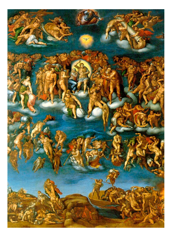
Figure 2. Marcello Venusti's copy of the uncensored version of the Last Judgment (1549).