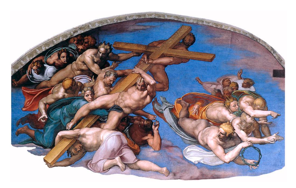
Figure 3. Detail from the Last Judgment : Angels with the instruments of Christ's passion.

It is Silvio himself, for example, who complicates matters when he responds to Pulidoro Saraceni's criticism of the strained, "exaggerated" poses of the angels holding up the instruments of Christ's passion in the Last Judgment , because they call attention to the artist's own skill rather than to the religious significance of the scene (Figure 3). Silvio objects, however, suggesting that "that was done to show the dignity and power of the art, and beyond that, out of reverence for those sacred instruments; for although certainly a single angel could carry them effortlessly... this would not have given them the appropriate majesty. So I think he represented that crowd of angels to make the instruments more revered, solemn, and devout" (Gilio 2018, p. 147). Given that Gilio's dedicatory letter to Farnese begins by objecting to the artifice of strained and contorted bodies in contemporary art, it is interesting that here we encounter a spirited defense of the same. One must assume, given Silvio's previous claim, that in this case Michelangelo's angels do in fact "accommodate art to the truth of the subject matter," since the figures are described as exemplifying the power of art to intensify devout meditation on Christ's passion.