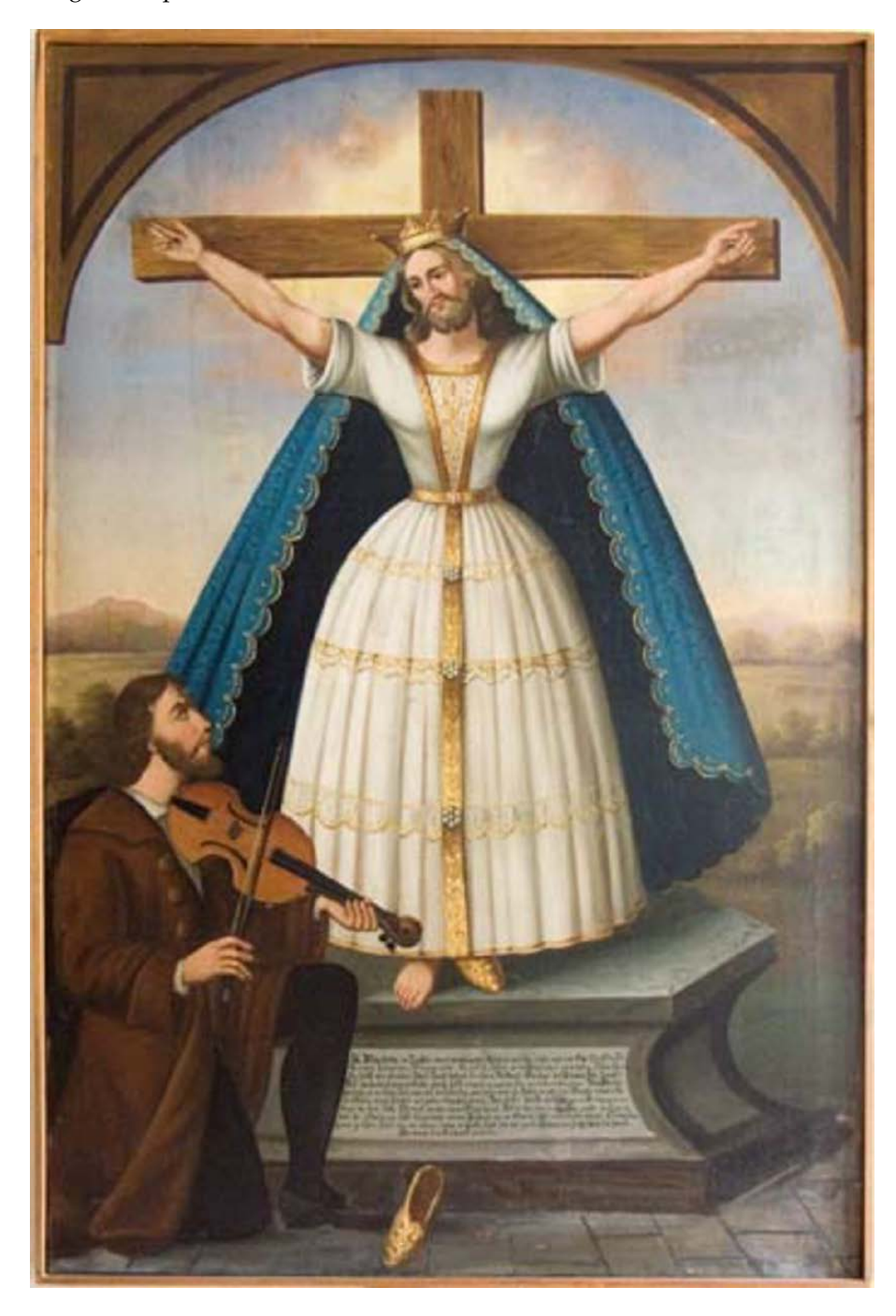
Figure 7. Wallfahrtsbild Kümmernis aus Schwarzau am Steinfeld, Öl, Relig. Brauchtum, Widmung des H. Pfarrers Berger, Schwarzau a. St. Anonymous. Städtisches Museum Neunkirchen.

as language for God that is not gendered (e.g., Friend or Parent instead of Mother or Father).<sup>21</sup> Additionally, most images found in worship spaces—including those of God, Jesus Christ, and saints—are depictions of people who are seen either as a woman or a man.<sup>22</sup> By introducing images of Wilgefortis into worship spaces, the liturgy could include art such as Figure 7 that can be seen as depicting not only a woman or a man but also as both woman and man and neither woman nor man, disrupting the normative sex/gender binary of either/or with both/neither by representing all those along the entire sex/gender spectrum.