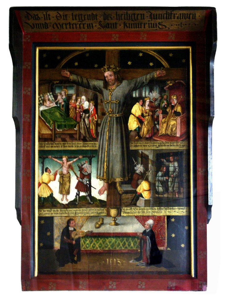
Figure 5. Kümmernis (1513), Egidienkirche, Erlangen-Eltersdorf.

Because an empty slipper was "a common symbol for the female sex organ," one reading by David Williams sees this "'one-shoe-off, one shoe-on' imagery as a playful iconographical allusion to male and female genitalia and an indication of the saint's—and