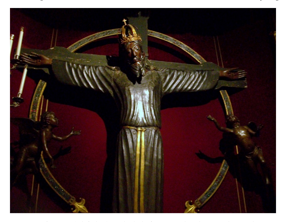
Figure 2. Volto Santo (8th/9th c.), Cathedral of Lucca, Italy.

The legend of Saint Wilgefortis has its origins in the image of Volto Santo or holy face , a famous eight-foot-tall carved wooden cross in the Cathedral of Lucca in Italy (Figure 2).