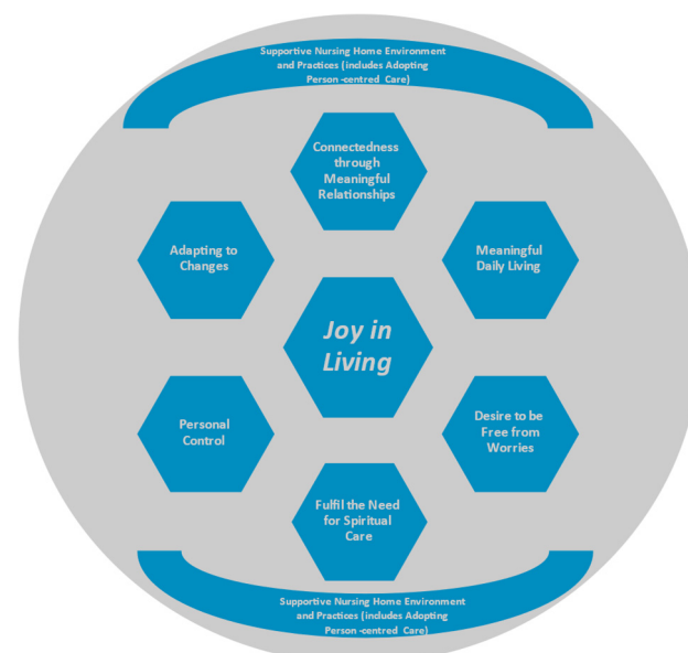
Figure 2. Themes for Joy in Living experiences in nursing homes.

The subthemes within each theme are as illustrated in the concept map in Figure 3.