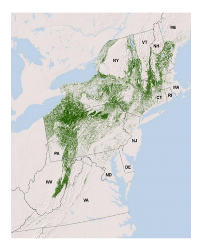
Figure 1. Map of the hemlock–northern hardwood forest. The Nature Conservancy, 2018.

Before considering these cultural changes it is important to first provide some environmental context by conveying a general sense of the physical appearance of the hemlock– northern hardwood forest in which these changes took place. American values related