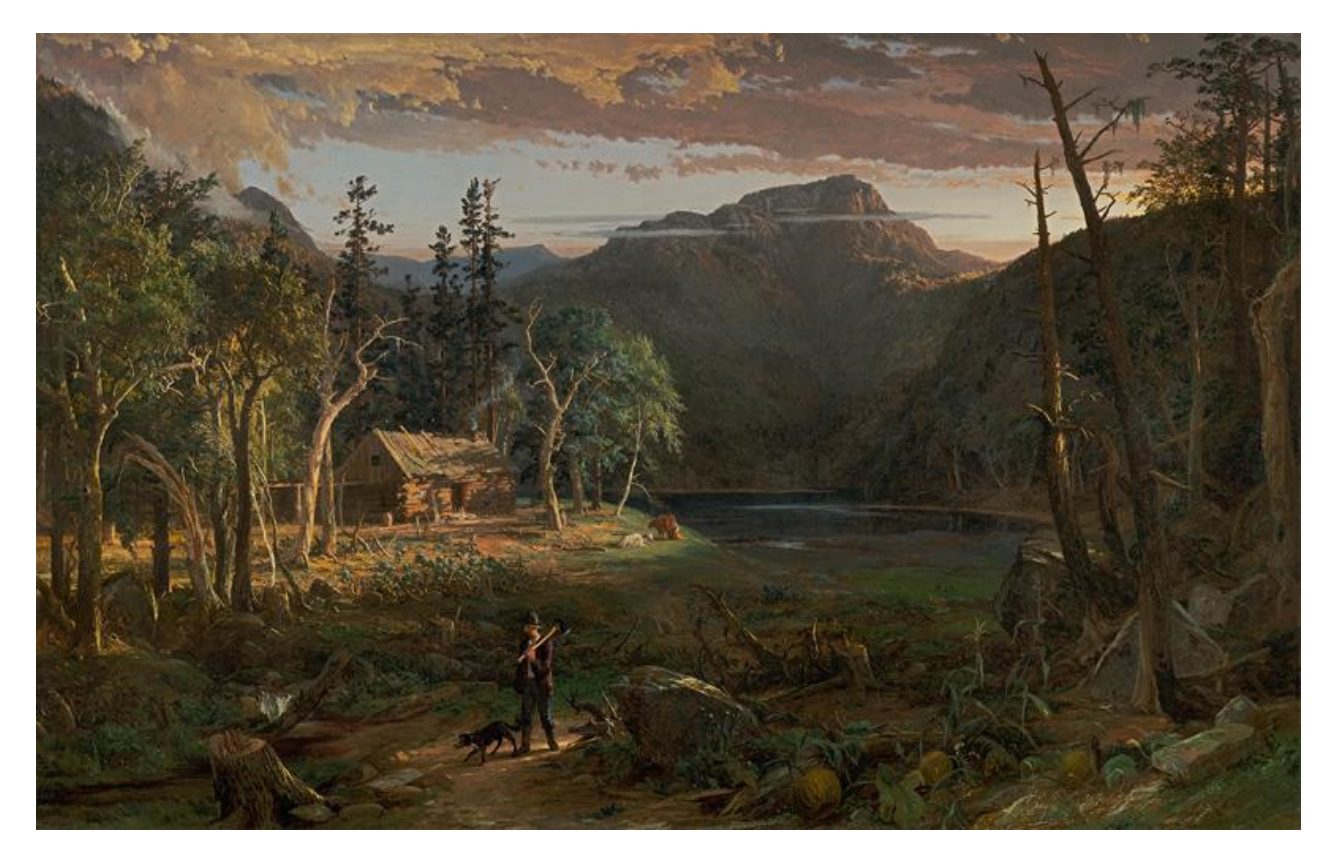
Figure 3. The Backwoods of America by Cropsey 1858. Oil on canvas. Crystal Bridges Museum of American Art.