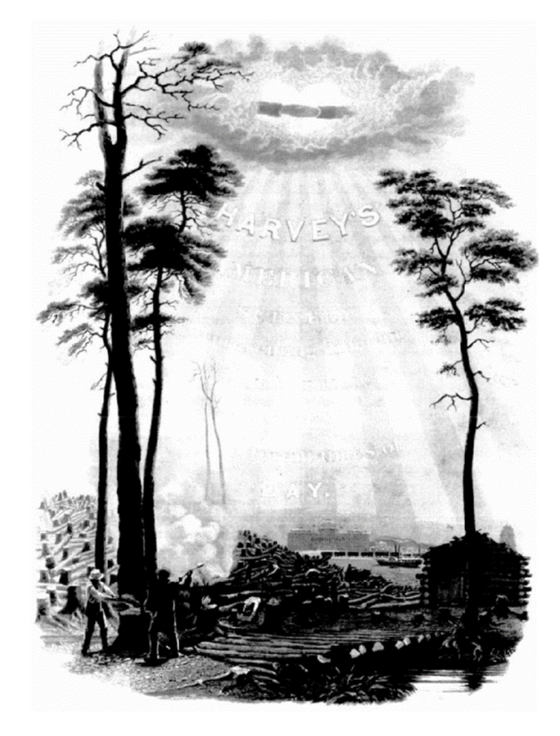
Figure 4. Epitome of the Historic Progression of the United States by William Harvey 1841. Engraving, title page of George Harvey, Washington Irving, W. J. Bennett, and Charles Vinten's Connected Series of Forty Views of American Scenery . 1841. New York: Charles Vinten.

York had been several decades earlier. Thus, the secondary succession of white pines in abandoned farms of New York and New England provided timber for settlements where timber was scarcer. The economic cycles of America were of course much more complicated than this example suggests, but it does demonstrate the intense, sustained demand for timber as well as the narrow human view of timber as an inexhaustible resource. During the nineteenth century the forests of New York were first and foremost sources of life and livelihood in a very economic sense, but they gradually became viewed with greater reverence and admiration in this century of westward expansion and religious revivals.