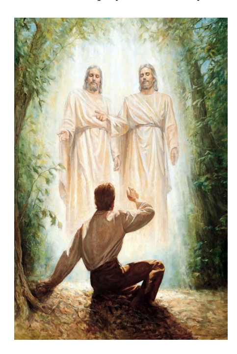
Figure 9. The First Vision by Delwin Oliver Parson 1988. Courtesy of The Church of Jesus Christ of Latter-day Saints (© By Intellectual Reserve, Inc.).

In summary, Joseph Smith's "First Vision" played a much more important role in the founding story of the Latter-day Saint Church beginning in the early twentieth century than it did in the nineteenth century (See also Flake 2004). The angelic visitations connected with The Book of Mormon, which also occurred in the New York Forest near Palmyra, however, have played a relatively continual, central role in the Church's founding story.