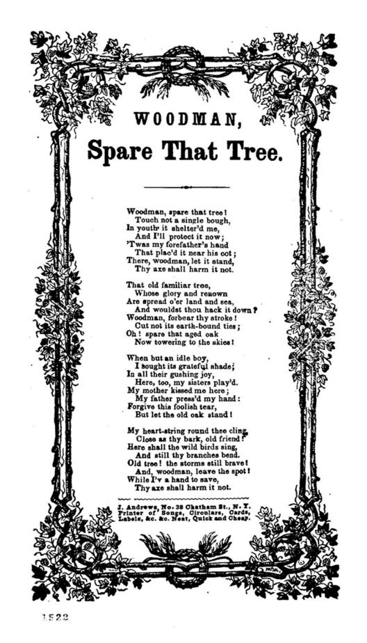
Figure 5. "Woodman, Spare That Tree" by George P. Morris and Henry Russell, 1837. J. Andrews, No. 38 Chatham St., New York.