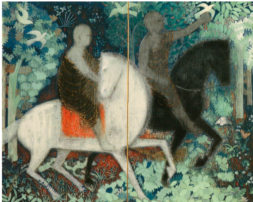
Figure 2. The Transmission of Buddhism (Bukkyō Denrai, 1959) . By Hirayama Ikuo. Saku Municipal Museum of Modern Art, Japan. Permission of use obtained thanks to the collaboration of the Hirayama Ikuo Silk Road Museum. No reproduction allowed without authorization.

Hirayama's approach to Buddhism can be understood within post-WWII Japanese cultural politics, which used art and international aid to promote a new role for affluent