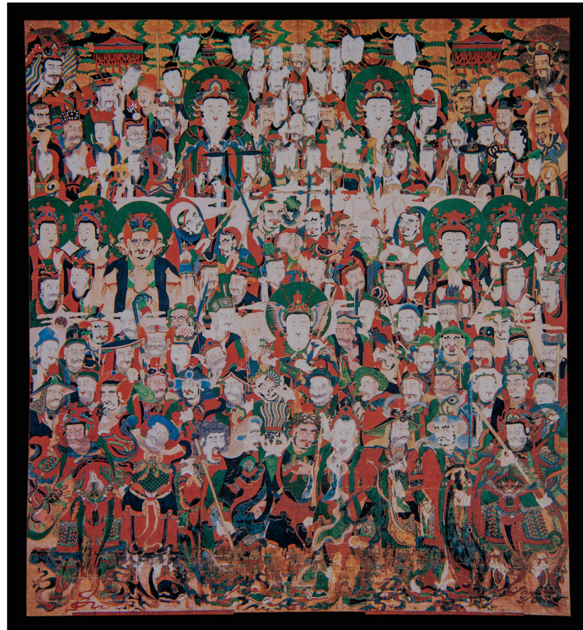
Figure 1. Tŏgun et al. 124 Guardian Deities, 1862, Chosŏn dynasty (1392–1910). Colors on silk, 348 × 315.5 cm. Haein Monastery, Kyŏngsang Province. Reproduced with permission from the Research Institute of Sungbo Cultural Heritage, Seoul.

Kwanje worship by arguing for the need to commemorate heroes of the (Chinese) Three Kingdoms period. 10