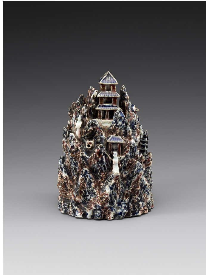
Figure 9. Paksan -shaped Water Dropper, 19th century, Chosŏn dynasty (1392–1910). Porcelain with cobalt-blue and copper-red painting in underglaze. H 19.0 cm. National Museum of Korea (pon 8143).