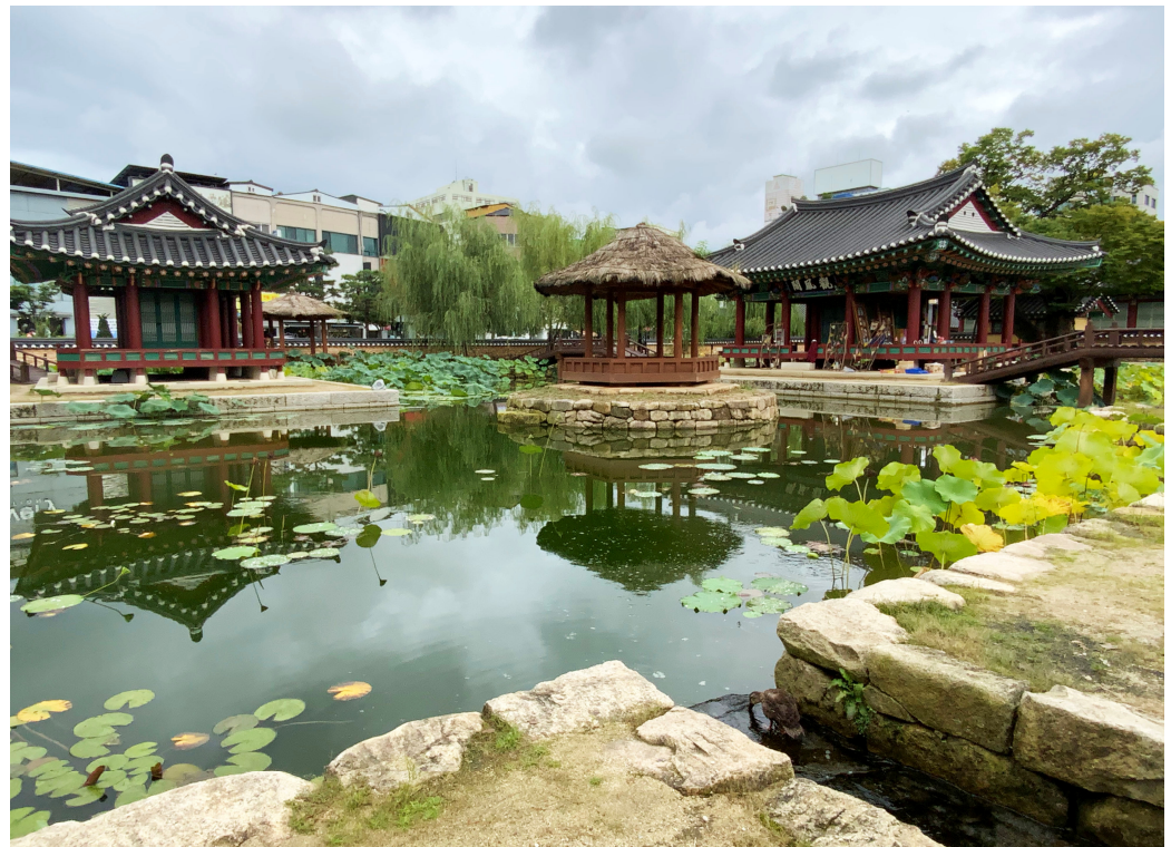
Figure 13. Back Garden of Kangwŏn Provincial Office. Late Chosŏn Dynasty, modern reconstruction based on archaeological excavations. Buildings from left to right: Pongnae/Penglai Pavilion, Pavilion for Terrapin Catch (thatched; behind Pongnae Pavilion), Gathering Medicinal Herbs Dock (thatched round structure), and Yŏngju/Yingzhou Pavilion. Inlet on lower right of picture. Wŏnju, Kangwŏn Province.

On the other hand, governor Kim Sang-sŏng 金尙星 (1703–1755) strongly emphasized the Wŏnju garden’s connection to Korea’s Mt. Penglai, i.e., Mt. Kŭmgang. Upon his arrival in Wŏnju, he began making several enhancements to the garden, starting with the restoration of Pongnae Pavilion. To reinforce the idea of entering an earthly paradise while sitting in the newly restored pavilion and enjoying the view of the pond, Kim ordered a rubbing of Yang Sa-ŏn’s calligraphy (carved at Mt. Kŭmgang’s Ten Thousand Falls Ravine) and had it hung on Pongnae Pavilion’s wall, and he also commissioned a painting of Mt. Kŭmgang scenery. Together with his guests, Kim strolled through the garden while singing the Kwandong Melody (Kwandonggok 關東曲) and fantasizing about roaming in the world of immortals. 34 Kim essentially incorporated historical traces and visual imagery of Mt. Kŭmgang into the garden’s space to validate the garden as the epitome of an otherworldly land on Korean soil.