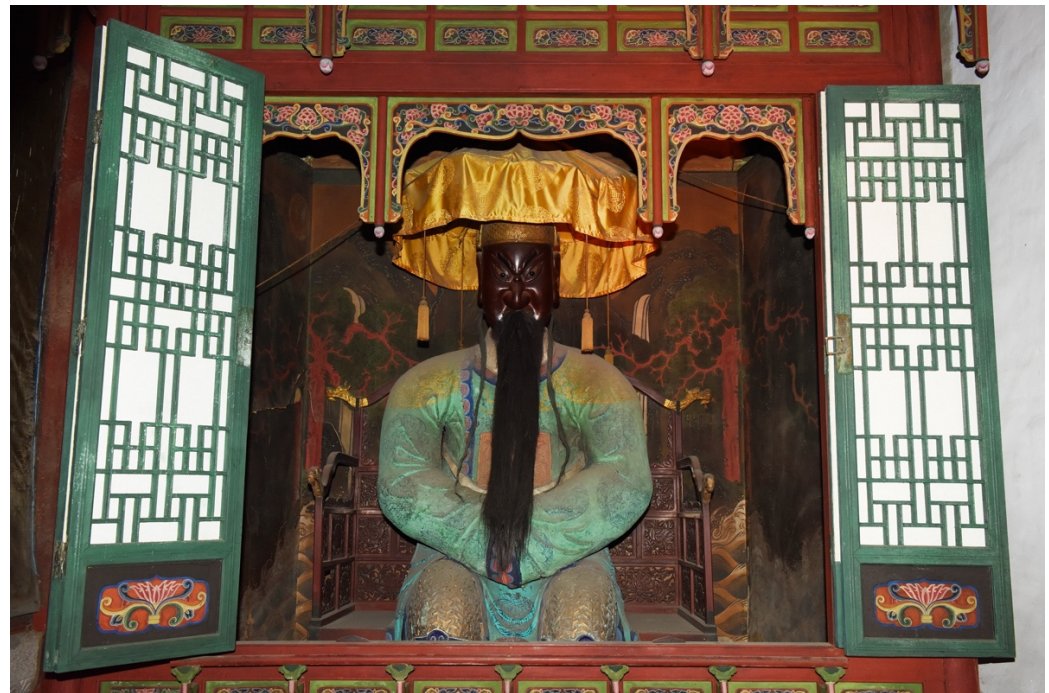
Figure 3. Kwanje in dragon robe , formerly main icon of the Northern Shrine, 1883. Red lacquer on wood (head) and molded clay (body). H 216 cm. Main Hall of Eastern Shrine, Seoul.

a green robe over armor with a dark hood (Figures 4 and 5). (Lee 2020, p. 204; Chang 2008, pp. 98–99).