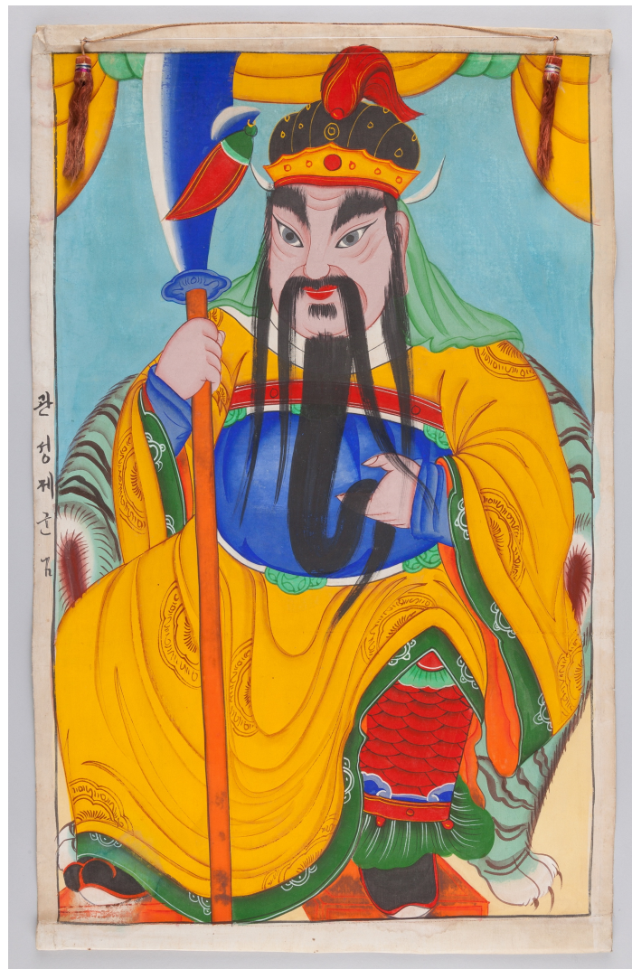
Figure 6. Hwang Ch'un-sŏng. Emperor Guan (Kwansŏng chegundo 關聖帝君圖). Post-1945, S. Korea. Colors on silk. 83.5 cm × 53 cm. National Folk Museum of Korea, Seoul (minsok 072639). Image licensed under Creative Commons, reproduced with permission from the National Folk Museum of Korea, Seoul.

Like the other surviving versions, the final illustration of the 1570 Ansim Monastery version (Figure 7), depicts the most powerful visualization of the Supreme God of Thunder's martial form, riding a qilin galloping through clouds and seas. A Daoist high god identifiable as the Highest Prince of Jade Purity (C. Wushang yuqing wang 無上玉清王) is depicted in the upper right corner of the pictorial composition, sending a beam of energy to the Supreme God of Thunder from his raised hand. Numerous thunder gods and officials are joining the scene in the upper left. Four figures in charge of punishing the wrongdoers are depicted in the lower left corner, while a figure carrying the records of good and bad actions is shown below the Supreme God of Thunder, directing his way. Given how well this image was rendered in great detail, in comparison to the preceding illustrations, it must have held exceptional significance as an effective visual and ritual instrument for accessing the Supreme God of Thunder's power. When creating talismans that were believed to cure ailments and keep people safe from harm, Buddhist monks, blind diviners, and shamans probably visualized the Supreme God of Thunder while chanting this text. Laypeople supposedly also chanted this scripture for a variety of reasons, including the treatment of illnesses. 16