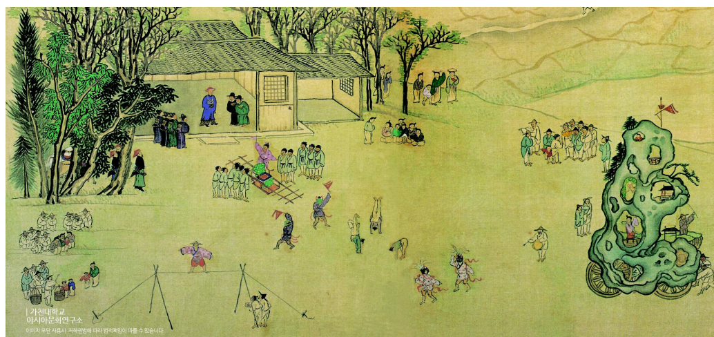
Figure 10. Akedun (1685–1756), Leaf no. 7 from the album Illustrations of an Imperial Commissioner , 1725, Qing dynasty. Ink and colors on silk, 40 cm × 51 cm. National Library of China, Beijing.

Korea in 1725, depicts a sandae stage (Figure 10) (Chǒng 2005, p. 218). Based on sketches he commissioned from a Korean artist, Akedun's detailed depiction of the scene captures the moment when two men (possibly members of the sandae togam troupe) wheeled a several-dozen-feet tall, bizarrely shaped artificial rock mountain to the outdoor stage. Niches inside the rock feature painted clay figurines of a female wearing a fancy, bright red skirt, as well as a monkey and an angler. Green-leaved twigs and branches adorn the rock, evoking the natural characteristics of mountain scenery that suggests an imaginary otherworldly land. While the Special Record about Odd Amusements refers to sandae as a representation of Mt. Kūmgang that was used as a stage to perform the tale of Kim Man-jung's 金萬重 (1637–1692) Cloud Dream of the Nine (Kuunmong 九雲夢), Akedun's album leaf demonstrates the use of sandae as a backdrop which enhanced the visual impact of various performances that took place in front of it, including mask dance, plate spinning, and tightrope walking. Framed by small groups of onlookers of varying age, gender and social status, the scene contributes to our understanding of the extent to which Daoist-(and Buddhist-)infused performance arts attracted a wide range of people in the late Chosŏn (cf. Sa 2002, pp. 358–61, 374).