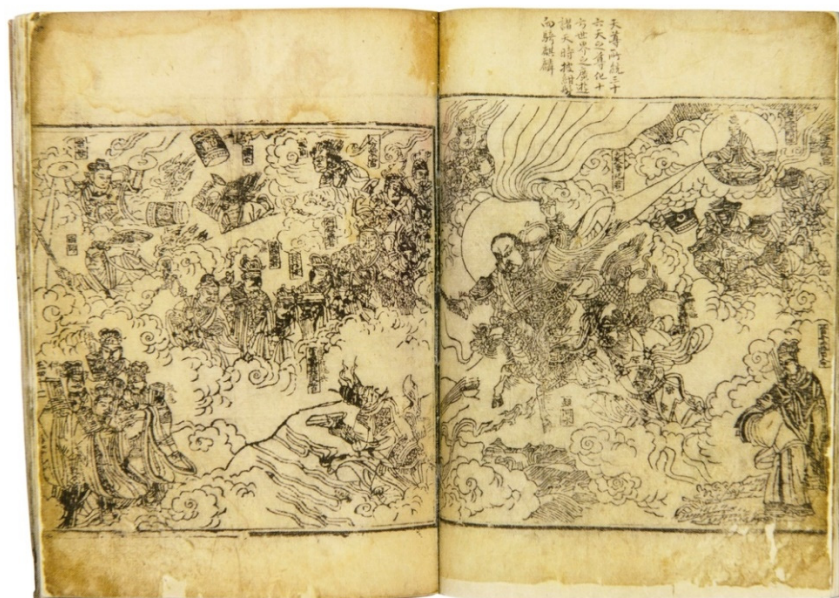
Figure 7. Illustration from the Ansim Monastery print of the annotated Yushu baojing , 1570, Chosŏn dynasty. Booklet, illustrated woodblock print. 33.8 cm × 26.1 cm. Collection of Woodblock Print Museum, Wŏnju, Kangwŏn Province, South Korea.

There is a large corpus of hand-written and printed texts on inner alchemy ( naedan 內丹) that have yet to be properly investigated by contemporary scholars. 17 In his Commentary to the Cantong qi ( Ch'amdonggye chuhae 參同契 註解), Kwŏn Kŭk-chung 權克中 (1585–1659), established a systematic inner alchemy philosophy that encompasses a complete ontology, theory of human nature, system of alchemical practice, and doctrine of immortality. Sin Ton-bok's 辛敦復 (1692–1779) Mirror of Instructions and Reflection on Daoism ( Toga chikchi tokcho kyŏng 道家直指獨照經) is an excellent example for late Chosŏn literati's engagement with Daoist doctrine. It includes a collection of the principles of moral enlightenment required before practicing inner alchemy, and main themes of spiritual and physical discipline, from practical plans for physical training to self-cultivation through taking herbs and regulating the interior fire. Kang Hŏn-gyu 姜獻奎 (1797–1860) authored a book titled Interpretation of the Cantong qi ( Chuyŏk ch'amdonggye yŏnsŏl 周易 參同契演說, abbreviated Interpretation ), which was first published in 1857. 18 The title is deceptive because it is not a commentary on the Cantong qi , but rather a compilation of significant Daoist writings that systematically consolidates selections from Korean and Chinese texts dealing with inner alchemy, cultivation, breathing exercises, gymnastics, and morality (Figure 8) (Jung 2000, pp. 805–9).