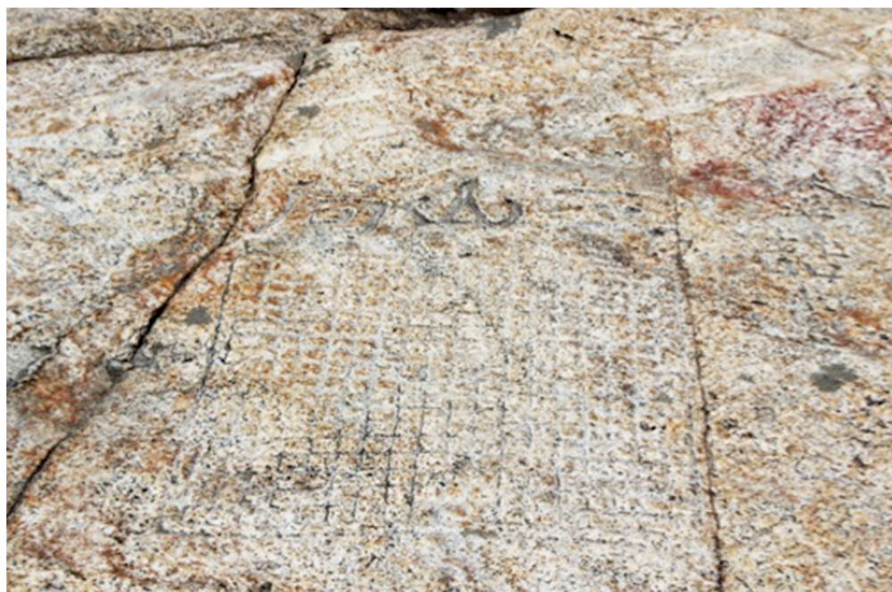
Figure 11. Rock carving of a chessboard titled Samsan'guk , Chosŏn period. Ten Thousand Falls Ravine, Inner Kŭmgang, Mt. Kŭmgang, DPRK.

ernors created, renovated, and expanded this garden over the span of more than 200 years, transforming it into a perceived land of immortals.