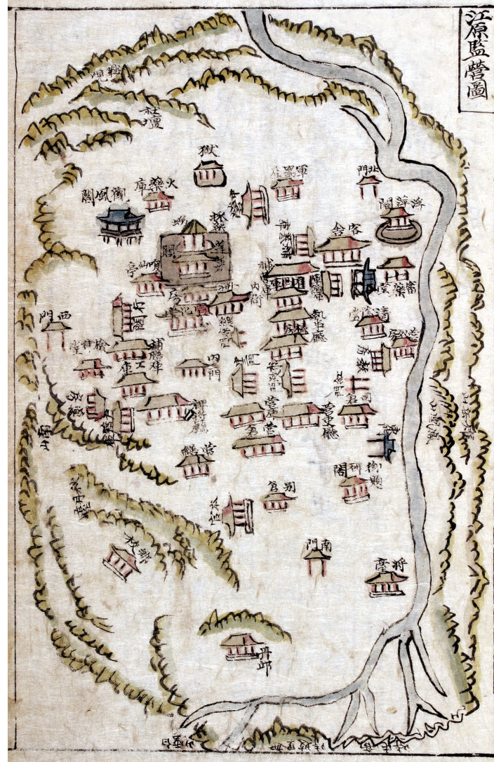
Figure 12. Map of Kangwŏn Provincial Office, Kwandong Gazetteer, Chosŏn period, 1820, Wŏnju City History Museum. Reproduced with permission from the Wŏnju City History Museum.

Yingzhou Pavilion (Yŏngjusa 瀛洲榭) and Penglai Pavilion (Pongnaegak 蓬萊閣). In the late nineteenth century, the garden also included Fangzhang Terrace (Pangjangdae 方丈臺), which refers to the third of the three islands, and the Pavilion for Terrapin Catch (Choojŏng 釣鰲亭), a term originating from the legend of the three mountains where Daoist immortals spent blissful hours catching terrapins at a pavilion.