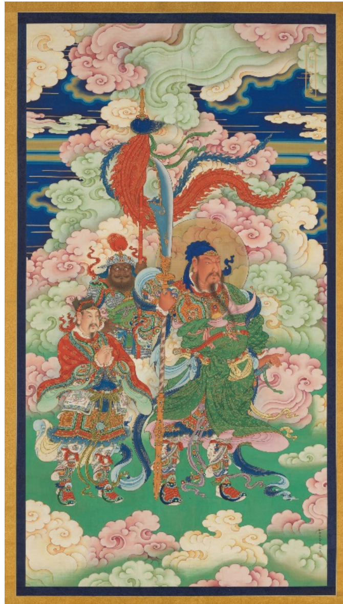
Figure 5. Unidentified artist. Guandi , ca. 1700. Qing dynasty (1644–1911). Hanging scroll (from a set of images for shuilu 水陸 rituals); ink, color, and gold on silk. 173 cm × 92.6 cm. Metropolitan Museum of Art (2001.442), purchased with the B. Y. Lam Fund and Friends of Asian Art Gifts, in honor of Douglas Dillon, 2001. Image licensed under Creative Commons, reproduced with permission from the Metropolitan Museum of Art, New York.

ter's visualization journey to heaven, followed by eight pages depicting talismanic seals that might have been written or used in the visualization. The postscripts list the names of several dozen donors (mostly laypeople), fundraisers, carvers, as well as the print's production date and location.