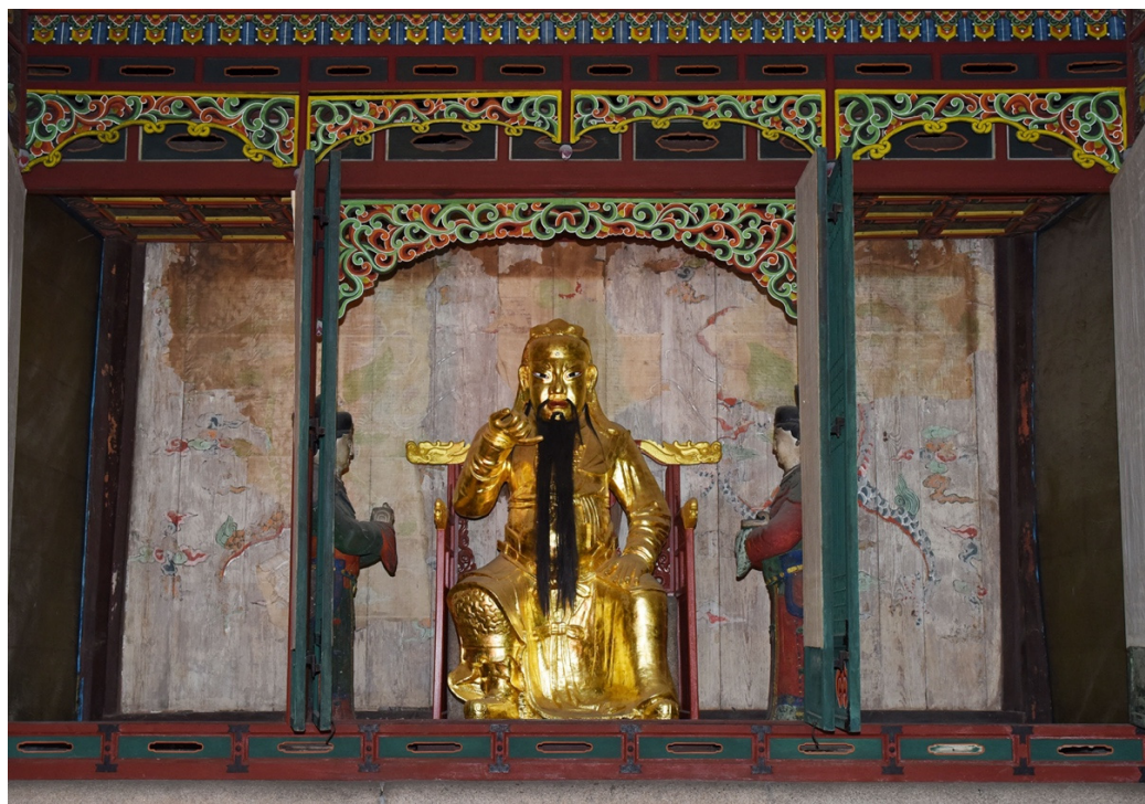
Figure 2. Kwanje (C. Guandi) with two female attendants, 1601. Main icon: gilt bronze, H 250 cm. Attendant figures: mineral colors on clay, H 187 cm. Main Hall of Eastern Shrine, Seoul.