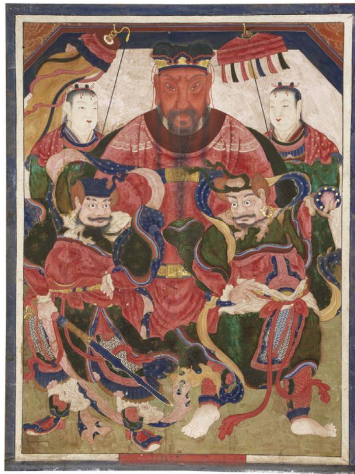
Figure 4. Taehö Chehun 大虛體勳 and Hakhö 鶴虛. Kwanje/Temple God (Toryangsin 道場神), 1885. Chosŏn dynasty (1392–1910). Mounted painting, colors on silk. 150.5 cm × 112.4 cm. Ultimate Bliss Hall, Hŭngch'ŏn Monastery, Seoul.

The use of Daoist texts for ritual practices is another factor that provides a richer and more nuanced understanding of late Chosŏn Daoism. The Yushu baojing 玉樞寶經 (Precious Scripture of the Jade Pivot, K. Okchu pogyŏng ), also known by its full name, Jiutian yingyuan leisheng puhua tianzun yushu baojing 九天應元雷聲普化天尊玉樞寶經 (Precious Scripture of the Jade Pivot, Spoken by the Celestial Worthy of Universal Transformation of the Sound of the Thunder of Responding Origin in the Nine Heavens), is a beautifully illustrated text that exemplifies these practices. This text, which in Imperial China served as the foundation for the Thunder Rites of the Shenxiao 神霄 tradition, was attributed to the Supreme God of Thunder (Puhua tianzun 普化天尊), the Daoist form of the Bodhisattva Samantabhadra (K. Pohyŏn posal 普賢菩薩). 14