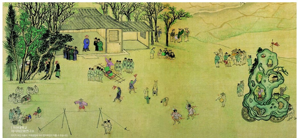
Figure 10. Akedun (1685–1756), Leaf no. 7 from the album Illustrations of an Imperial Commissioner , 1725, Qing dynasty. Ink and colors on silk, 40 cm × 51 cm. National Library of China, Beijing.

Korea in 1725, depicts a sandae stage (Figure 10) (Chǒng 2005, p. 218). Based on sketches he commissioned from a Korean artist, Akedun's detailed depiction of the scene captures the moment when two men (possibly members of the sandae togam troupe) wheeled a several-dozen-feet tall, bizarrely shaped artificial rock mountain to the outdoor stage. Niches inside the rock feature painted clay figurines of a female wearing a fancy, bright red skirt, as well as a monkey and an angler. Green-leaved twigs and branches adorn the rock, evoking the natural characteristics of mountain scenery that suggests an imaginary otherworldly land. While the Special Record about Odd Amusements refers to sandae as a representation of Mt. Kūmgang that was used as a stage to perform the tale of Kim Man-jung's 金萬重 (1637–1692) Cloud Dream of the Nine (Kuunmong 九雲夢), Akedun's album leaf demonstrates the use of sandae as a backdrop which enhanced the visual impact of various performances that took place in front of it, including mask dance, plate spinning, and tightrope walking. Framed by small groups of onlookers of varying age, gender and social status, the scene contributes to our understanding of the extent to which Daoist-(and Buddhist-)infused performance arts attracted a wide range of people in the late Chosŏn (cf. Sa 2002, pp. 358–61, 374).