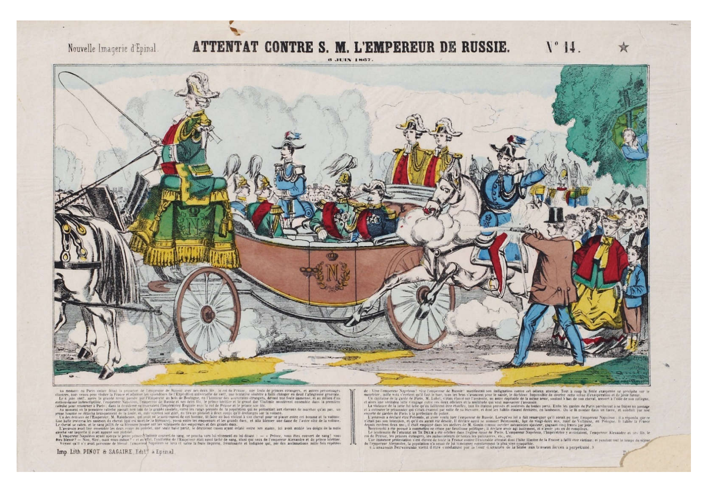
Figure 1. The 25 May 1867 assassination attempt on the life of Emperor Alexander II ( Nouvelle Imaqerie d'Epinal , issue 14, 6 June 1867).

This august example from the very site of the shocking, unprecedented event set the frame for countless improvisations all across the provinces. Chapels were constructed or turned into churches; unheated churches were converted into heated ones, and so on, in commemoration of Alexander II's deliverance ( spasenie ) by the hand of the Providence. Let us review the following two colorful, though by no means unique, cases of local ceremonial response to the two traumatic events and use them as points of entry into the subject of ruler sacrality in its latest, attempt-on-life-themed iterations.