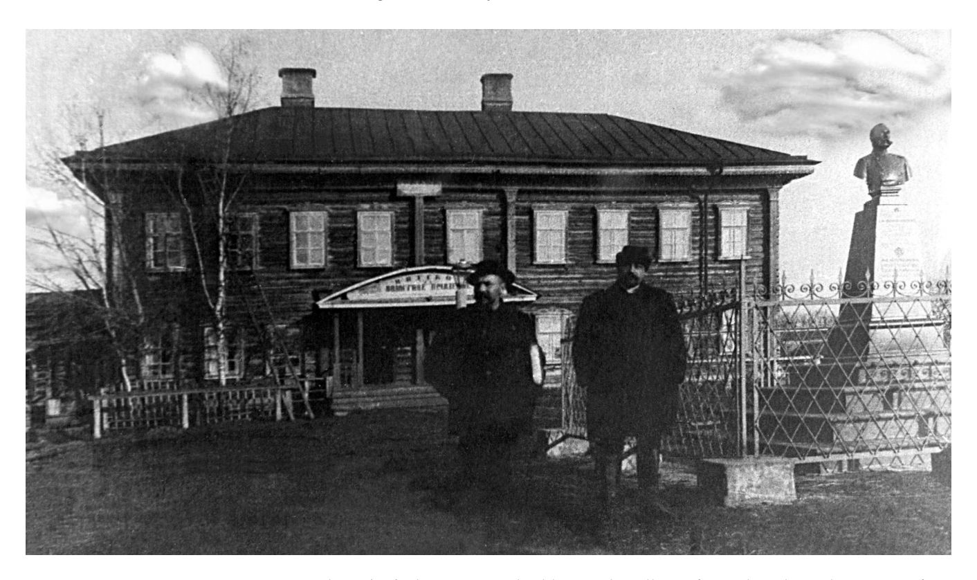
Figure 3. The Volost' administration building in the village of Vyatsk in the early 1900s. In front, a monument to Emperor Alexander II is clearly visible. Today, it has been reconstructed.

on with curiosity whereas some Catholics, even though none lived in the village, entered the new temple, and kissed the icon ( lobyizat' , prikladyivat'sya ) one by one, in the reverend manner of a multitude of Orthodox pilgrims from far and wide. Following an all-night vigil ( vsenoshtnoe bdenie ), a procession of the cross with the icon being carried and lowered in the sign of the cross as a benediction to the people, circled three times ( troekratnoe obhozhdenie ) the old church amidst readings of the four Gospels, then repeated the motion around the new one before entering it. After the completion of the sacred rites there, the icon was laid to rest on the holy throne in the center of the altar until a suitable kiot could be arranged for it. A local choir sang the imperial hymn "God Save the Tsar", and in the evening, the new church was decorated and illuminated. With the exception of the holy rites themselves, the church bells rang continuously.<sup>64</sup>