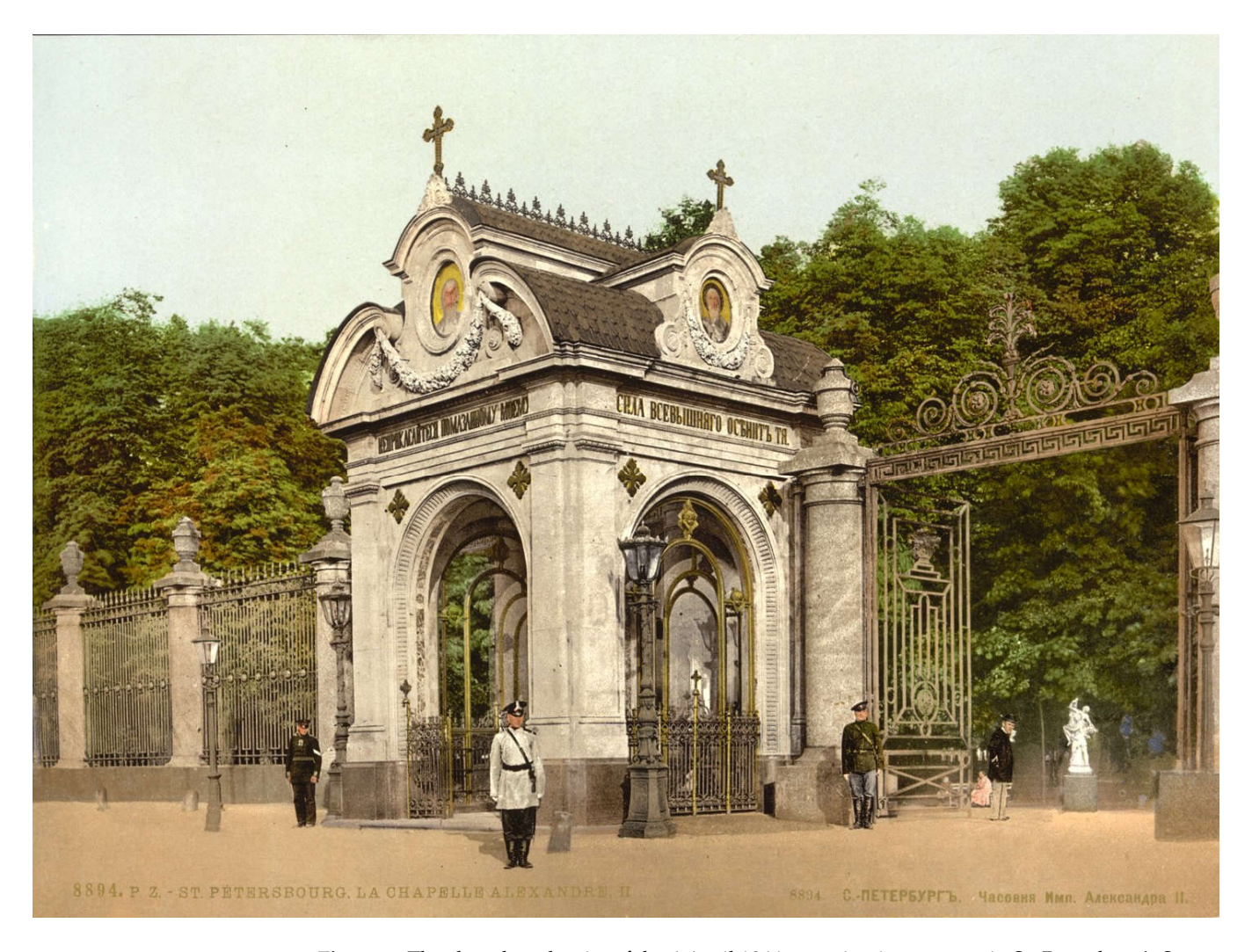
Figure 2. The chapel on the site of the 4 April 1866 assassination attempt in St. Petersburg's Summer Garden (destroyed in 1930).

service of gratitude with communal genuflection ( kolenopreklonenie ) was to be performed. Finally, a special address describing these acts was forwarded to the Emperor.<sup>41</sup>