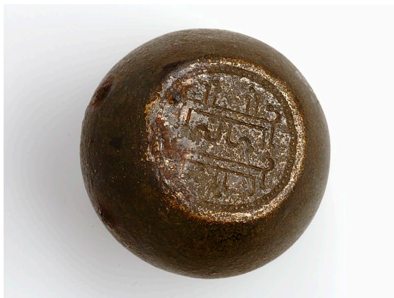
Figure 5. Iron weight with bronze casing and Arabic-like inscription ©Christer Åhlin, Swedish History Museum (CC BY 2.5 SE license).