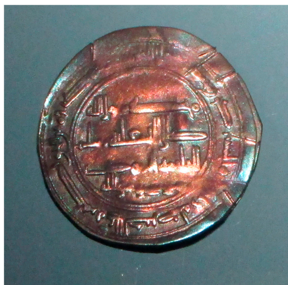
Figure 3. The Khazar 'Moses' Coin, from the Spillings Hoard, Gotland Museum © W. Carter (CC BY-SA 4.0 license).

Arabic-inscribed materials demonstrate that Arabic and its Islamic associations were not always viewed negatively but rather embraced, even when such materials were not intended to signal Islamic religious affiliation. That said, the Islamicate coinage's inscriptions sometimes contained religious meaning in Northern Europe. Dirhams could be considered 'minor missionary objects' to those who could read the Arabic. While most Northern Europeans probably could not do so proficiently, they still conceivably understood the inscriptions' general significance, as evidenced by the presence of religious (pagan and Christian) graffiti on some dirhams, likely intended to neutralize the coins' original religious messages (Jarman 2021, p. 121; cf. Mikkelsen 2002). In some Islamic traditions, Muslims used amulets and talismans, like the khamisa (the 'Hand of Fatima') to repel misfortune and to direct positive energies like love and devotion (Gruber 2016; Santa-Cruz 2013, p. 133). Archaeologists have found such materials in the Islamic World, including beneath home entrances (Ennahid 2002). Scholars have argued that Islamicate coins in burial contexts might have similarly functioned as talismans (von Erdmann and Stickel