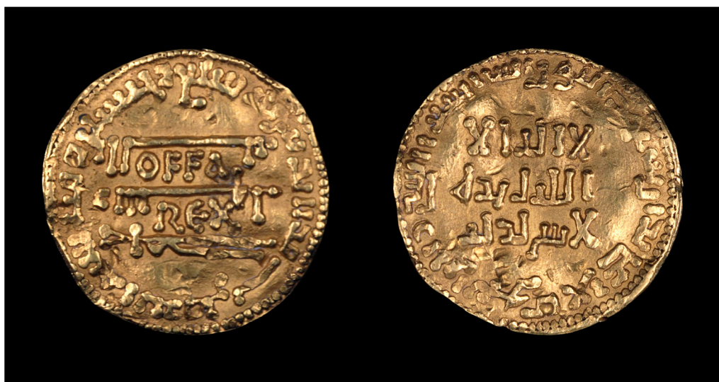
Figure 2. Offa imitation Dinar of Offa © Trustees of the British Museum (CC BY-NC-SA 4.0 license).