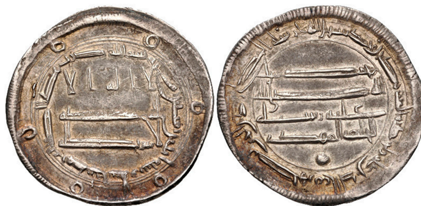
Figure 1. Abbāsid dirham. Mint: al-Maḥdī, AH 162 (778/9 CE). Madīnat al-Salām (Baghdad).

artifacts, trade alone cannot indicate religious ‘conversion’. This evidence does, however, reveal the breadth of economic exchanges with the Islamic World that indirectly connected Northern and Eastern Europeans to Muslims who crafted such materials for trade. These indirect networks of religious connectivity suggest some awareness in Northern and Eastern Europe of the Islamic World and its faith, even if the religious and cultural meanings behind the materials change across geographic space.