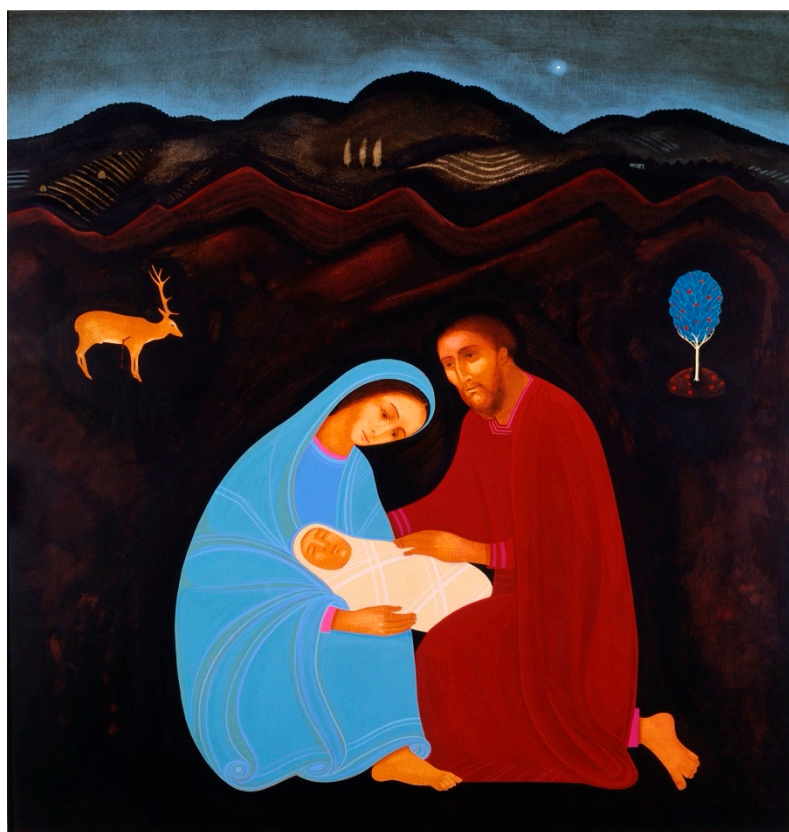
Figure 1. The Nativity.

These paintings blend a series of art traditions in a distinctive manner, thereby expressing the dynamic paradox of Christian Catholicity: namely that the Christian message is simultaneously universal (catholic) and particular (personal), relevant to all times and places, operating within but also beyond cultural contexts and values. For instance, The Nativity (Figure 1) is a striking example of O'Brien's unique adoption of centuries of devotional, iconographic art for our times, an adoption profoundly inspired by decades of personal prayer and contemplation. Given its subject matter and blend of varied styles, the painting is at once timely and timeless, drawing together biblical symbolism, the spare style of iconography, and a reserved expressionism in which the dramatic yet sombre landscape of the painting suggests the existential plight of the fallen human condition, while also as firmly hinting at the redemptive work of God incarnate. As with the rosary itself, the painting integrates a network of scriptural passages and images, all with a view to encouraging prayerful meditation on the central Christian mystery: Christ's incarnation, his entrance into human history.