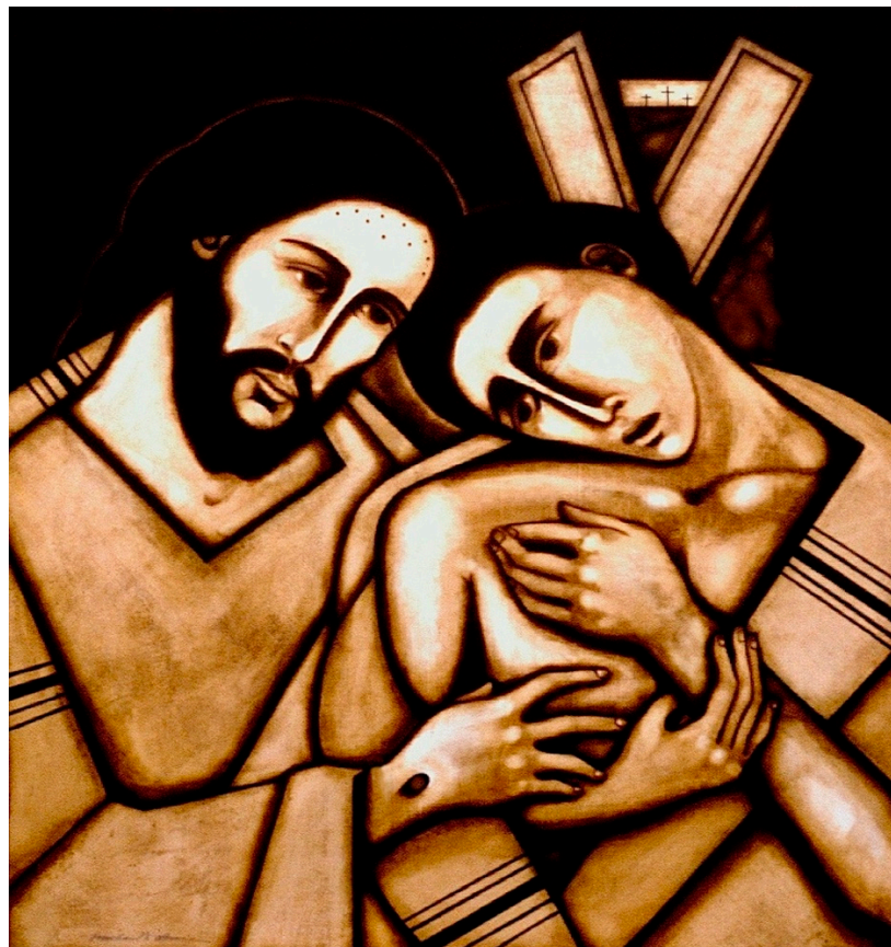
Figure 4. Christ and Adam.