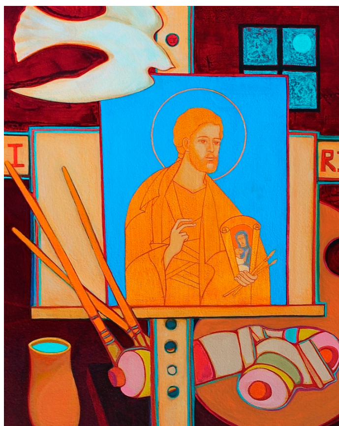
Figure 2. The Studio.