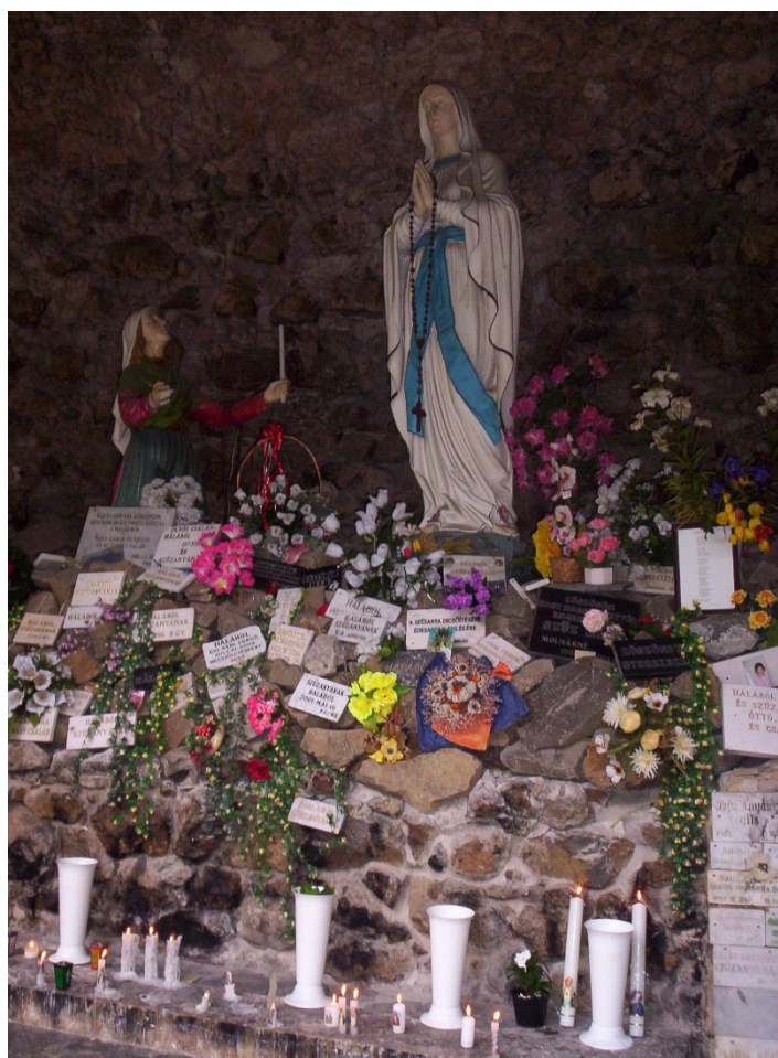
Figure 10. Gratitude tablets in Mátraverebély-Szentkút, Photo taken by Krisztina Frauhammer, 2008.