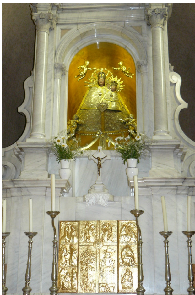
Figure 4. The Virgin Mary of Máriagyűd

The number of books and prayer slips increased from year to year in all these places over the period examined, and this trend continued. The names used vary: Emlékkönyv (Remembrance Book), Látogatási könyv (Visitors' Book), Vendégeknyv (Guestbook). Whatever the name given to the books, they serve not only to record a visit to the shrine and the date of the visit, but have also become fora for contact with the Virgin Mother, Jesus or other saints.