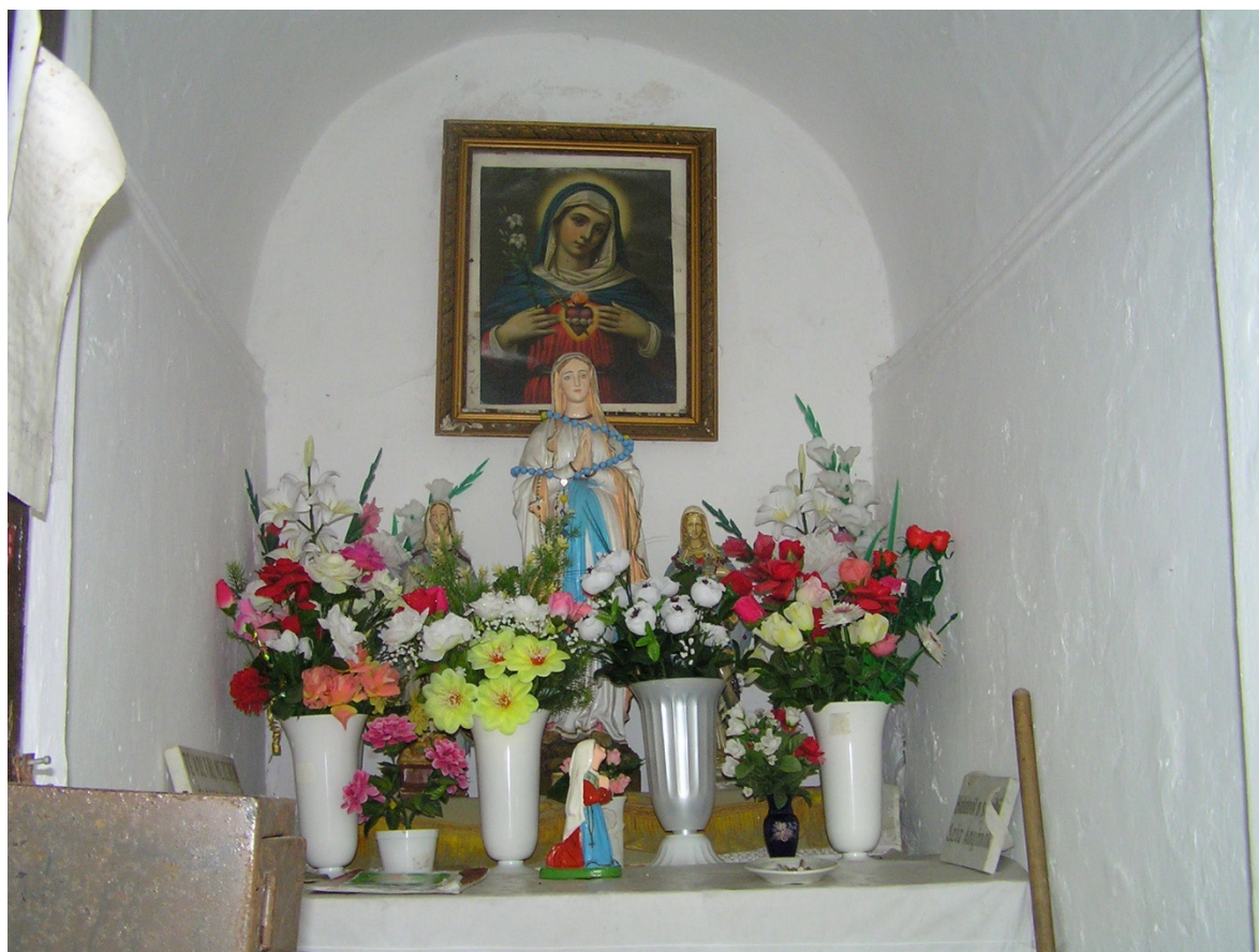
Figure 2. The Chapel in Egyházaskő-Vecseklő.

World War, the relocation of the Germans who had once lived there, and the crises of the newcomers who were settled there. The second research site is located in present-day Slovakia, the Hungarian-inhabited village of Egyházaskő-Vecseklő (Nová Bašta-Večelkov) (Figure 2) (Up to the end of the First World War, the settlement was part of Hungary, but, under the Trianon Peace Treaty of 4 June 1920, it became part of Slovakia.).