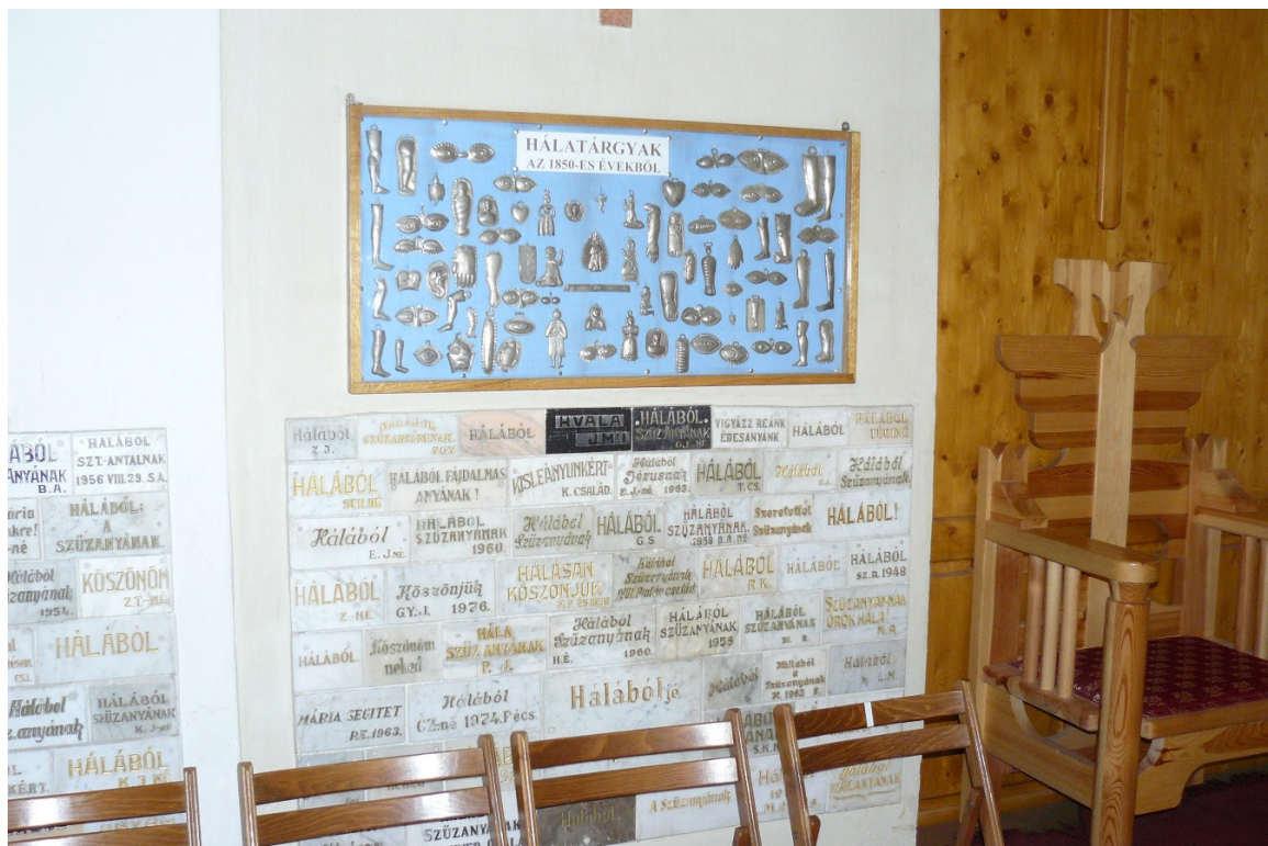
Figure 9. Gratitude tablets in Máriagyűd, Photo taken by Krisztina Frauhammer, 2008.