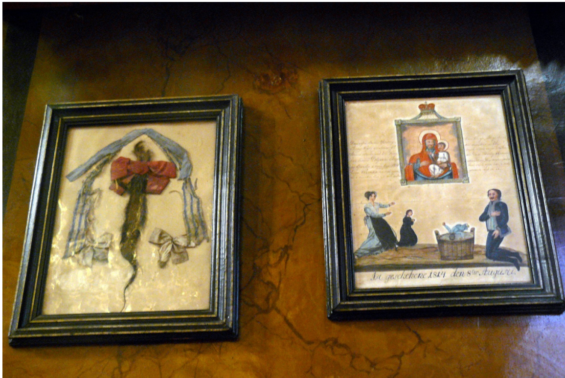
Figure 8. Ex votos in Máriapócs, Photo taken by Krisztina Frauhammer, 2008.

maintaining interpersonal connections (e.g., letters), and also for communication of the self. All of these functions appear also in the case of church guestbooks.