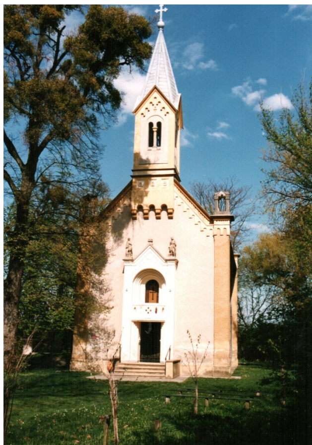
Figure 1. The chapel in Máriakálnok, Photo taken by Krisztina Frauhammer, 2008.

To answer my questions, I carried out research at five shrines in Hungary. The first site was a small village, Máriakálnok, in western Hungary, a lesser-known shrine with a small catchment area (Figure 1).