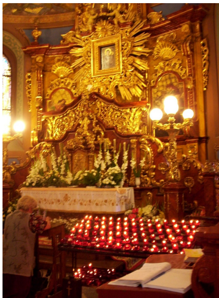
Figure 5. The Goestbook in Máriapócs, Photo taken by Krisztina Frauhammer, 2008.