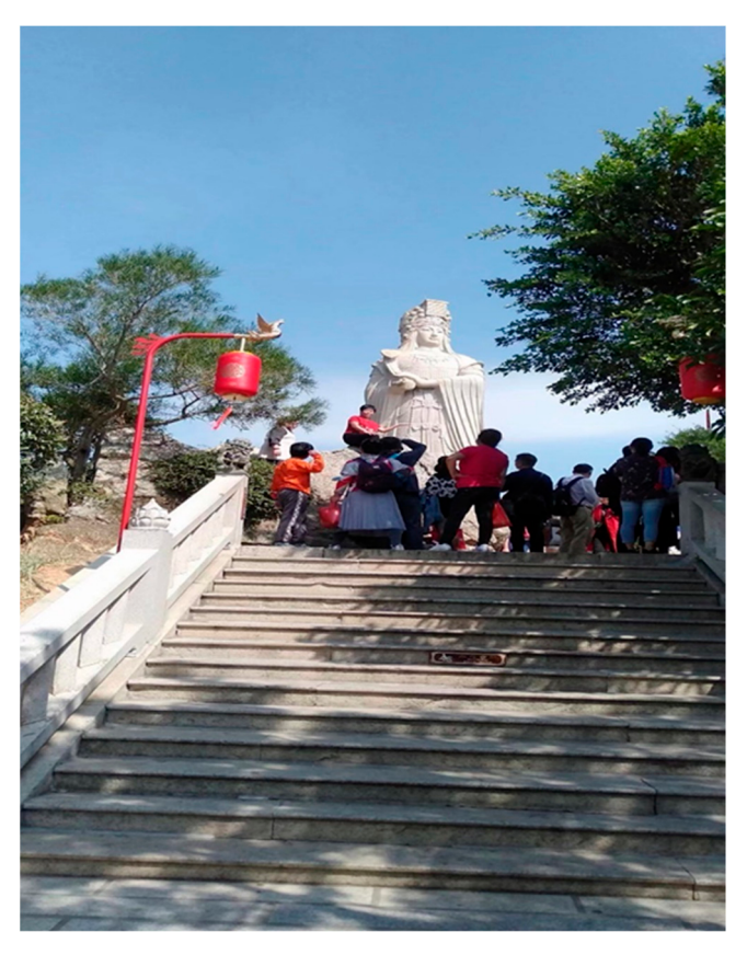
Figure 1. The statue named "the Goddess of Peace."

buildings and religious sites of the ancestral temple. As described in the local government document entitled "Construction Planning of Ancestral Temple", the reconstruction project was envisioned to "highlight the traditional style and thereby making the temple complex as an ideal of ancient architecture. This temple should be a combination of religious pilgrimage, tourism, academic center, and vocation".<sup>32</sup> In other words, key to the invention of tradition was making the ancestral temple a "foundational hierophany," to draw from Mircea Eliade, an axis mundi connecting to primordial, mythical times.<sup>33</sup>