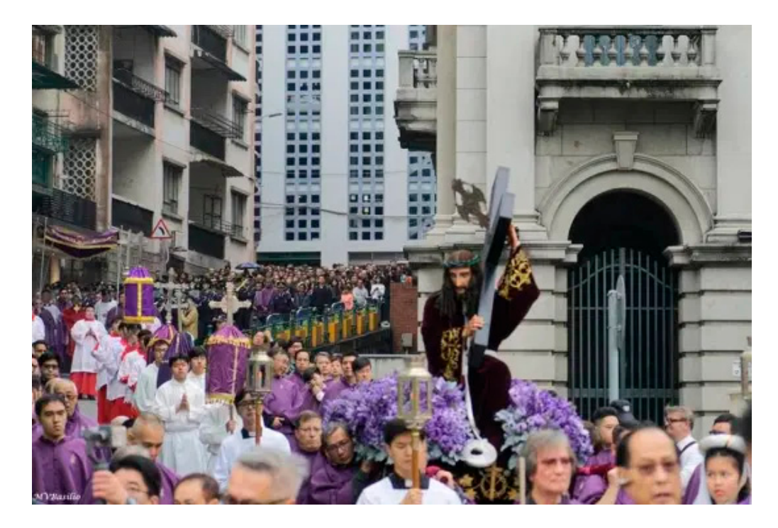
Figure 2. Procession of Bom Jesus, 10 March 2019.

By the beginning of the twentieth century there were at least twenty Catholic religious processions each year in Macao, including those of the Passion on the first Sunday of Lent, the Dead Christ on Good Friday, the Risen Christ on Easter morning, Our Lady of Pleasures also known as Our Lady of Remedies (in Portuguese A Nossa Senhora dos Prazedes or dos Remedios ) at the end of April or beginning of May, Corpus Christi, the Guardian Angel of the Kingdom of Portugal on 10 June, St Anthony on 13 June, St John the Baptist on 23 June, St Roque on the Second Sunday of July, the Assumption on 15 August, the Immaculate Conception on 8 December, as well as the tradition of visiting each of the Parish churches