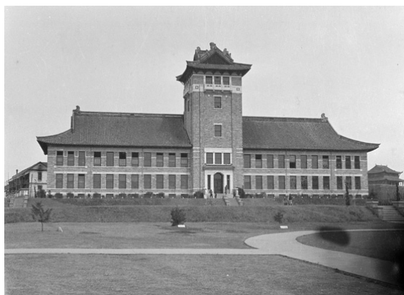
Figure 1. The North Building of the University of Nanking.