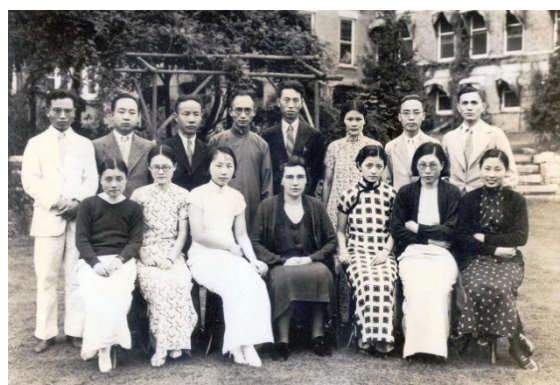
Figure 5. A Group Photo of Teachers and Students of the University of Nanking in 1937.