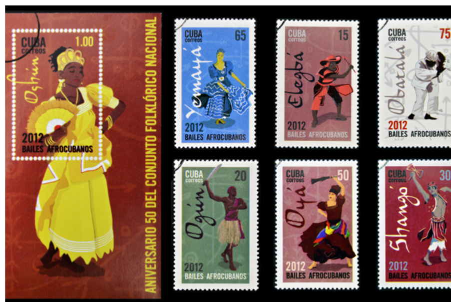
Figure 1. Orisha -themed postage stamps published by the Cuban government in 2012 to honor the 50th anniversary of the Conjunto Folklórico Nacional de Cuba (aka the National Folkloric Ensemble of Cuba, or CFN).

In one emblematic example, the Cuban government issued a series of postage stamps to commemorate its premiere folkloric ensemble—the Conjunto Folklórico Nacional (CFN), which García directed between 2001 and 2004—on the occasion of its 50th anniversary in 2012 (see Figure 1). Each stamp in the series depicted a different orisha , as they might be costumed and/or embodied in the course of ritual possession trance or staged folkloric performance. In a similarly ecumenical space for popular music (and public culture) in Cuba, the group Orishas (whose name speaks for itself) became the best-known exponents of Cuban rap in the 1990s. More recently, a 2016 music video by El Chacal (aka Ramón Lavado Martínez)—likewise, unambiguously titled “Shangó,” in honor of the virile orisha of thunder, drumming, and dancing—includes a montage of the artist performing devotional rituals, filmed and edited in the glossy, polished style of a documentary reenactment.