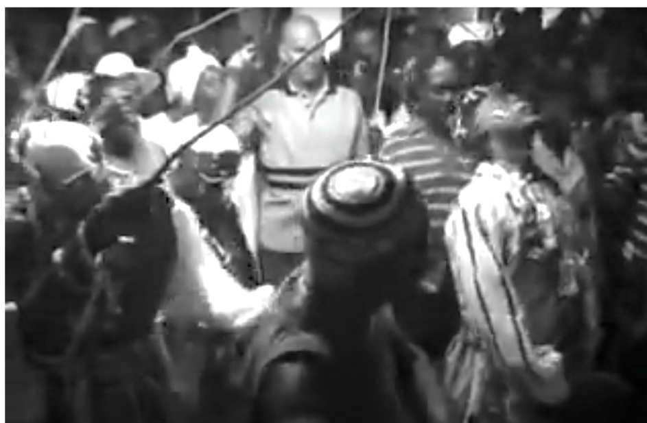
Figure 5. Still from Vamos al tambor (2003).

Beyond the fact that recording technology has become increasingly commonplace in orisha ritual, the publication of Vamos al tambor relied on Calvo's assertion of ritual authority: introductory text presents the film “with the blessings of our Elders and Orishas,” indicating that discussion within the religious community and divination were conducted in order to establish the project's legitimacy. Kabiosile Productions' multimedia publications—videos, audio recordings, written texts, (including musical transcriptions) published independently by Tina Gallagher—shift, rather clearly and categorically, between liturgical and didactic functions. Gallagher's long-term, intimate involvement with Calvo constitutes an exemplary collaborative approach (arguably in the spirit of applied ethnomusicology or participatory action research), as well as offering an important precedent for more recent Matanzas-based multimedia productions by the El Almacén collective. 34