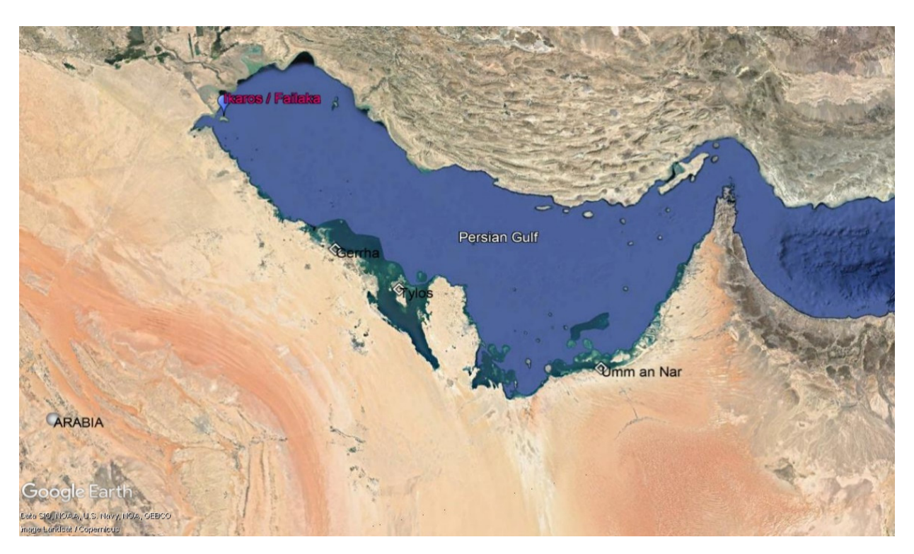
Figure 1. Map of the Persian Gulf showing the position of Ikaros/Failaka. The map was created by the author using Google Earth Pro maps.

But does this also occur outside the Mediterranean, in the nesiotic space of the Persian Gulf? How might the notion of insularity apply to the islands of the Persian Gulf and in particular to Ikaros/Failaka island? In Kosmin's (2013, p. 68) view 'the Arab/Persian Gulf, much like the Mediterranean, should be regarded as an environmental and (consequently) geopolitical entity'. The islands of the Persian Gulf can be considered as geo-historical entities, as part of a long-term history in which their populations increase, mingle, move or decline as a consequence of broader historical developments (Brughmans 2013). Our knowledge of the unique character of the islands of the Persian Gulf has grown thanks to the archaeological discoveries of the mid-20th century. From the 1950s onwards, a series of Danish archaeological missions worked on three islands of the Persian Gulf, Ikaros/Failaka (north), Tylos/Bahrain (center) and Umm an-Nar (south) (Figure 1). Their work has generated new perspectives in the study of this area (Potts 2016, p. 109). Moreover, the continuous systematic excavations in the Persian Gulf by American, Italian, French, Greek, Kuwaiti and Slovak archaeological missions, among others, have revealed a vibrant maritime and land network that, from the Bronze Age onwards, spread from Mesopotamia, southern Iran, the Persian Gulf, the Arabian Peninsula and the Indus Valley (Potts 2016, pp. 29–31, 109–10; Hannestad 2019, pp. 314–15; Kosmin 2013).