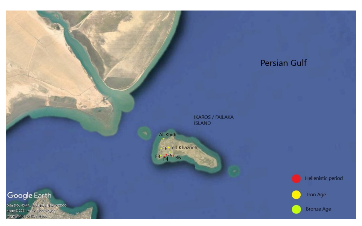
Figure 2. Map of Ikaros/Failaka. The map was created by the author using Google Earth Pro maps.

The west side was the closest part of the island to the mainland and contained wells of fresh water. This was therefore the area that received settlement (Figure 2). The proximity of the island to the mainland determined its contacts with the continental empires and civilisations of the region (Hassan et al. 2020, p. 11). As Ikaros/Failaka is a coastal island with few natural resources, it was not isolated since it depended on its connections with continental areas for its survival. On the other hand, although this island lies close to the coast, it depends on the particularities of the sea in the region and on the monsoons that affected navigation and dictated where one could anchor safely (Seland 2013, pp. 373–74).