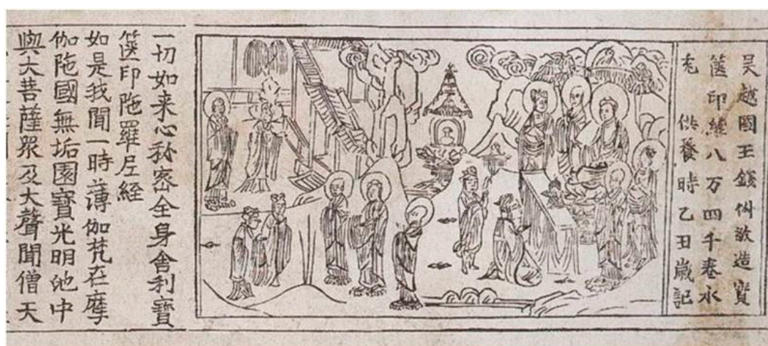
Figure 3. Detail of the Karaṇḍamudrā Sūtra . Found inside the miniature iron stūpa discovered in Shaoxing, Zhejiang Province, China. 965 CE, Wuyue (907–978). Xylograph; ink on paper. H. 8.5 cm; L. 182.8 cm. Zhejiang Provincial Museum. After (Li 2009b, p. 13).