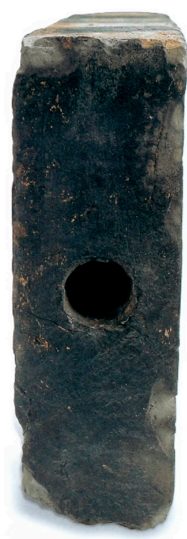
Figure 5. Hollowed brick that encased a printed scroll. Found in the ruins of the Leifengta, Hangzhou, Zhejiang Province, China. Ca. 975 CE, Wuyue (907–978). L. 37 cm; W. 18 cm; D. 6 cm. Zhejiang Provincial Museum. After (Li 2010, p. 132).