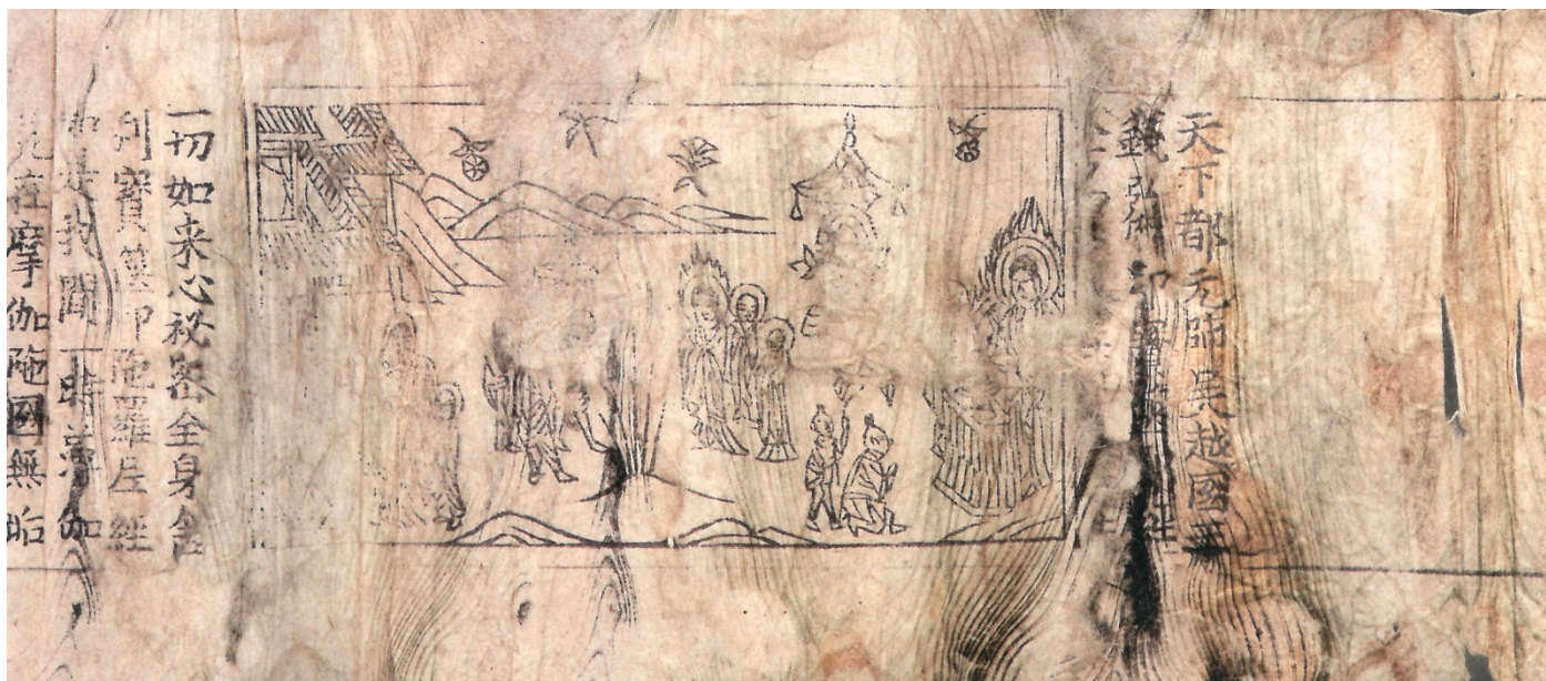
Figure 2. Detail of the Karaṇḍamudrā Sūtra . Found in Wuwei County, Anhui Province, China. 956 CE, Wuyue (907–978). Xylograph; ink on paper. H. 7 cm; L. 150 cm. Anhui Provincial Museum. After (Li 2011, p. 156).

Province in 1917 (Edgren 1972), whereas the other was discovered in a brick tomb beneath a Song-dynasty relic pagoda in Wuwei County, Anhui Province in 1971 and is now in the collection of Anhui Provincial Museum (Figure 2). 65