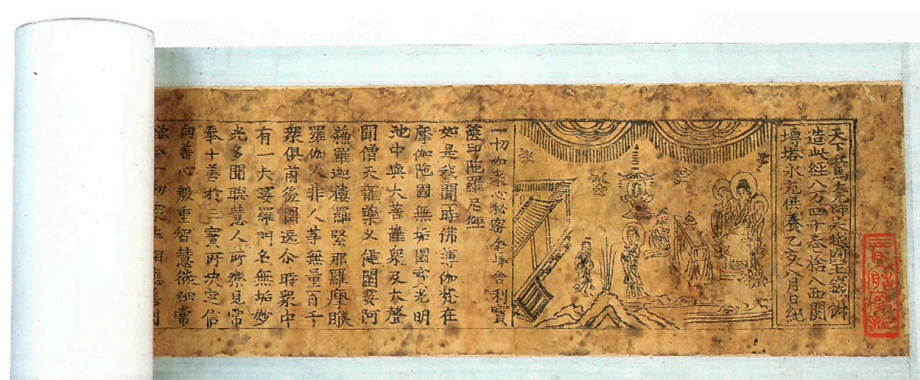
Figure 4. A scroll of the Karaṇḍamudrā Sūtra . 975 CE, Wuyue (907–978). Xylograph; ink on paper. H. 7.6 cm; L. 210 cm. Found in the ruins of the Leifengta, Hangzhou, Zhejiang Province, China. Zhejiang Provincial Museum. After (Li 2009b, p. 45).