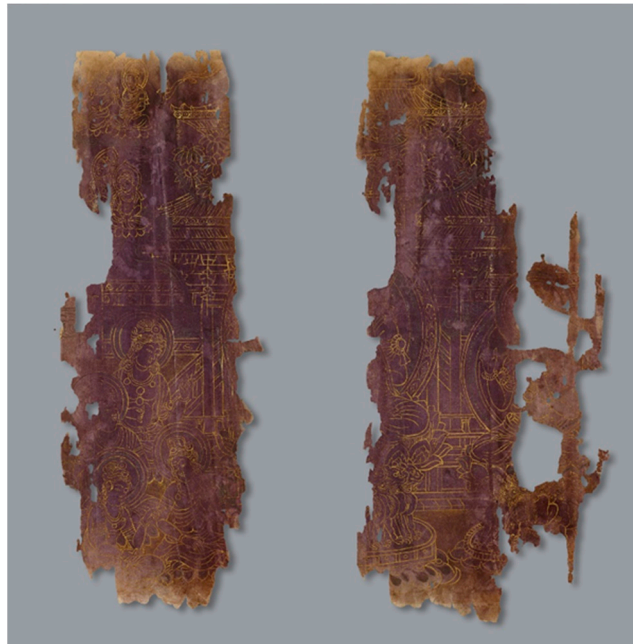
Figure 6. Frontispiece to the Flower Garland Sūtra . Ca. 754–755 CE, Silla (57 BCE–935). Gold and silver pigment on red mulberry paper. H. 25.7 cm; L. 10.9 cm; H. 24.0 cm; L. 9.3 cm. Leeum, Samsung Museum of Art.