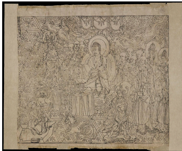
Figure 7. Frontispiece to the Diamond Sūtra . Found in Cave 17 of Mogao Grottoes, Dunhuang, China. 868 CE, Tang (618–907). Xylograph; ink on paper. H. 27.6; W: 28.5 cm. British Library.