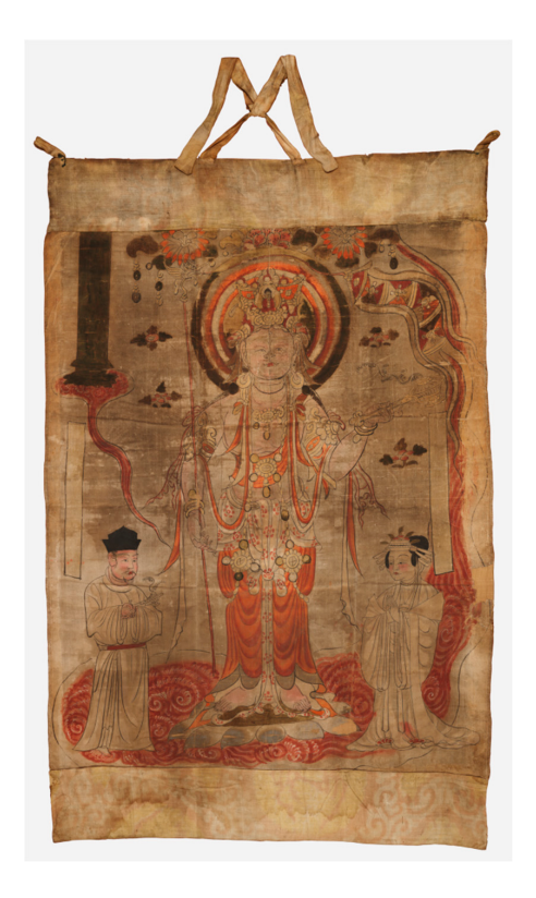
Figure 13. Guanyin attended by Two Donors. Dunhuang, c. 9th century. Banner; ink and color on silk, 95.3 \times 61.8 cm. Harvard Art Museums/Arthur M. Sackler Museum, Second Fogg Expedition to China Fund (1925,12).