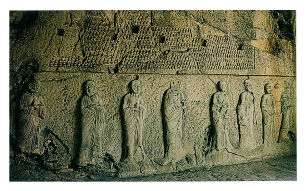
Figure 8. Patriarchal figures on the south wall of Kanjing si Cave. Longmen Grottoes, late 7th to early 8th century.

xingdao seng images (Figure 8).<sup>41</sup> The monk figures are aligned at regular intervals along the lower registers of the side and back walls of these caves. Most of them move forward in a clockwise direction, creating a grand scene in which a group of monks appear to be engaged in ritual circumambulation. The inscriptions flanking each of the 25 monks in Leigutai Central Cave largely accord to the patriarchal lineage narrated in the Fu fazang yinyuan zhuan 付法藏因緣傳 (Tradition of the Causes and Conditions of the Dharma-Treasury Transmission), and the 29 figures in Kanjing si Cave resembling those in Leigutai Central Cave are also considered to have portrayed patriarchs.<sup>42</sup> One could argue that the monk images in Ganlu Monastery 甘露寺 in Zhexi documented in the Lidai minghua ji also showed a similar arrangement, as it is said that xingdao seng was depicted on the four walls of the ante-chamber and the main chamber of Mañjuśrī Hall.<sup>43</sup>