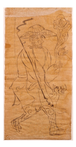
Figure 11. Itinerant monk on the reverse of the Lotus Sutra (detail). Dunhuang. Ink on paper, H. 26.1 cm. Bibliothèque nationale de France (Pelliot chinois 3075).