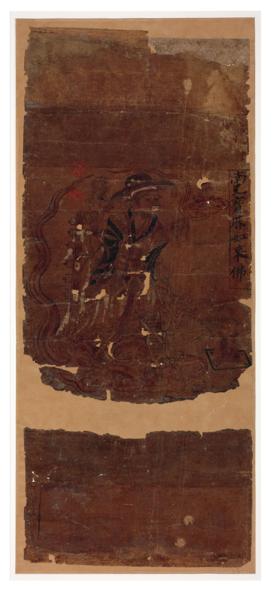
Figure 16. Itinerant Monk. Dunhuang, 10th century. Ink and colors on paper, 71.0 × 29.0 cm. Bibliothèque nationale de France (Pellio chinois 4074).