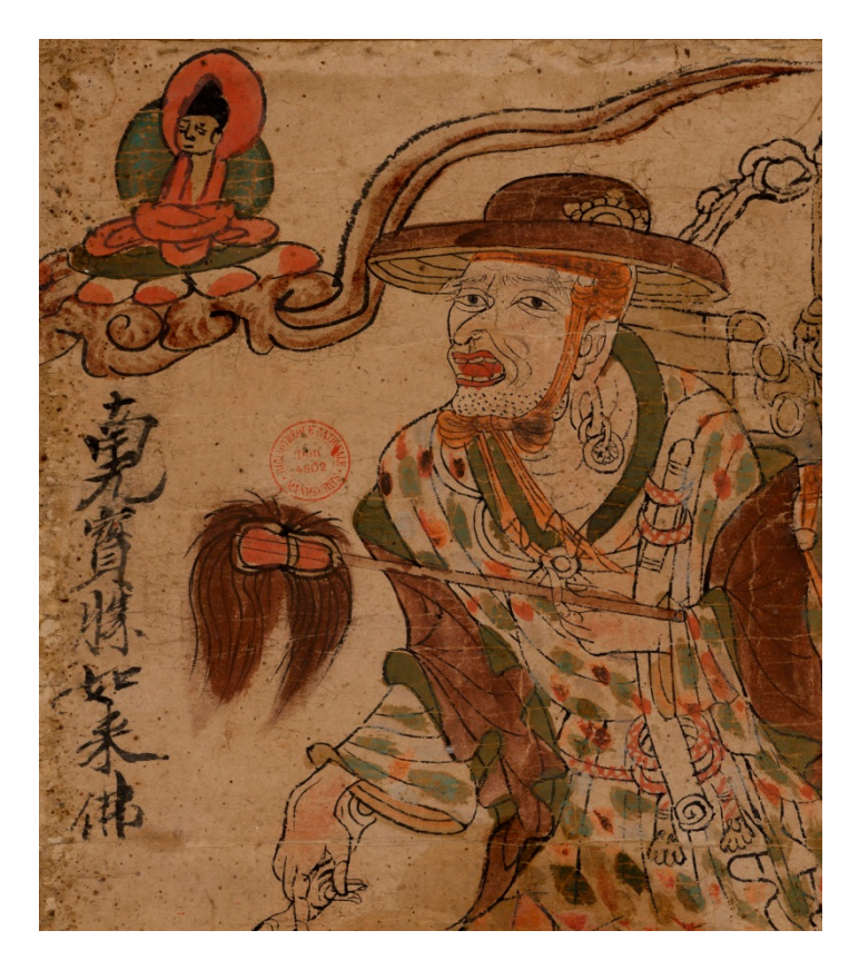
Figure 5. Itinerant Monk (detail). Dunhuang, 10th century. Ink and colors on paper, 55.0 \times 32.0 cm. Bibliothèque nationale de France (Pelliot chinois 4518(39)).

A figure similarly depicted with his mouth open is found in the well-known Kamakura period (1185–1333) image of Xuanzang portrayed as an itinerant monk (Figure 6).<sup>24</sup> In this painting, the legendary pilgrim is believed to be reciting the Bore xinjing 般若心經 (Heart Sūtra), which protected him during his journey in the Western Regions.<sup>25</sup> As no small Buddha is depicted in the Xuanzang's portrait, a more comparable example would be the portrait of Shandao 善導 (613–681) from the same period.<sup>26</sup> His signature act of chanting Amitābha's name is illustrated by a golden thread connecting his mouth to several small Buddhas hovering in the upper-right of the painting.<sup>27</sup>