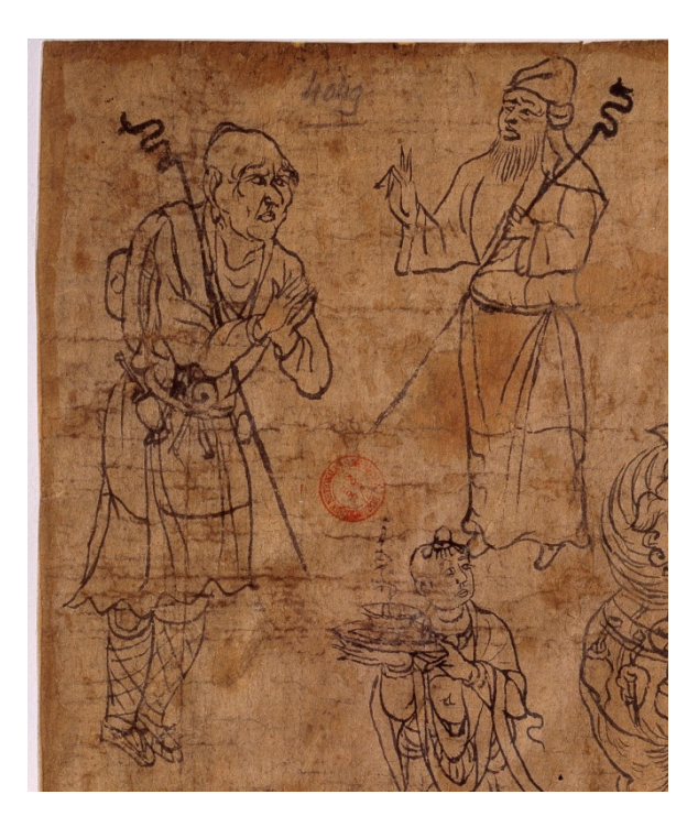
Figure 10. Mañjuśrī and Four Assistants (detail). Dunhuang, 9th–10th century. Ink on paper, 30.6 \times 42.5 cm. Bibliothèque nationale de France (Pelliot chinois 4049).