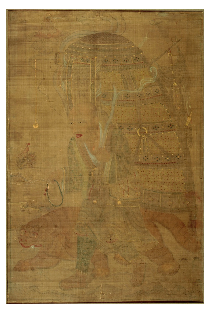
Figure 3. Itinerant Monk. Dunhuang, 9th century. Ink and colors on silk, 79.0 × 53.0 cm. Musée Guimet (EO.1138).

I concur with Xie's assertion that it was only in a later period that the monk became identified with Baosheng Buddha. Regarding the earlier iconography, the two cartouche spaces in a couple of examples suggest that the names of both the monk and small Buddha were supposed to be provided within the compositions. A good example is found in one of the paintings in the Musée Guimet (EO.1138) in which two cartouche frames are present in the upper-right and -left corners (Figure 3). Considering the refined brushwork, balanced composition, and meticulous details in the painting, it is difficult to imagine that the cartouche spaces were demarcated without a specific purpose. This seems to quell any doubt that the left and the right cartouches were assigned respectively for the small Buddha and the monk. Another example is the British Museum piece that features two rectangular frames set one above another in the left side of the composition (Figure 4).<sup>22</sup> Compared with the Guimet piece (EO.1138), the brushstrokes are loose and flaccid, making the depictions appear somewhat flattened and abstract. This lack of artistic sophistication suggests the possibility that the painter simply copied the cartouche frames from an earlier example, yet there is no question that the upper and lower cartouches in the British Museum were designed for the small Buddha and the monk respectively.