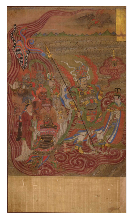
Figure 14. Vaiśravaṇa . Dunhuang, 9th century. Ink and colors on silk, 37.6 \times 26.6 cm. The British Museum (1919,0101,0.45)