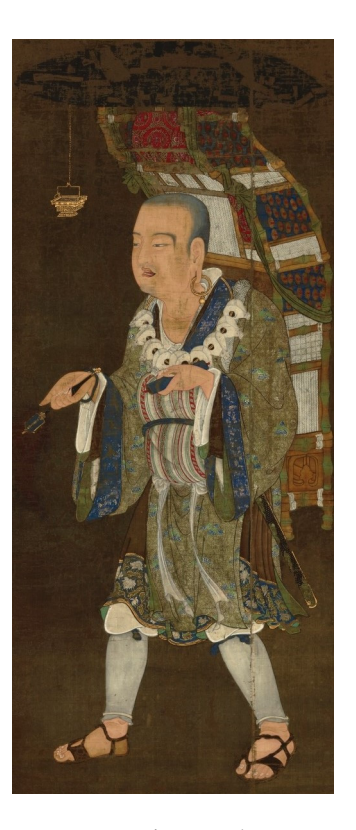
Figure 6. Portrait of Xuanzang as an Itinerant Monk. Kamakura period, 14th century. Ink and colors on silk, 135.3 \times 90.0 cm. Tokyo National Museum.

Furthermore, the likening of a monk to a Buddha is not unusual when considering the monastic practices developed around the 10th century. And this provides a basis for understanding how a monk could have been regarded as Baosheng Buddha in the itinerant monk paintings from Dunhuang, most of which have been dated to the 9th and 10th centuries. To mention a couple of references, the Song gaoseng zhuan recounts that Xiaokang 小康, an ardent follower of Shandao, who was active during the Zhenyuan era (785–805), wished to meet Shandao during a visit to Shandao's shrine in Chang'an, and that Xiaokang witnessed "the true image [of Shandao] transformed into a Buddha's body."<sup>29</sup> Another reference more relevant to the itinerant monk paintings, since the source is from Dunhuang, is in the Sengqie Heshang yu ru niepan shuo liudu jing 僧伽和尚浴入涅槃說六度經 (Sūtra on the Six Perfections as Spoken by the Monk Sengqie before Entering Nirvāṇa) discovered in the Mogao caves and dating to before the 11th century. From this text, it can be ascertained that Sengqie 僧伽 (617–710), who was already revered as an incarnation of Avalokiteśvara in the 10th century, was further elevated to the status of a Buddha based on Sengqie's remark that "I was called Śākyamuni Buddha."