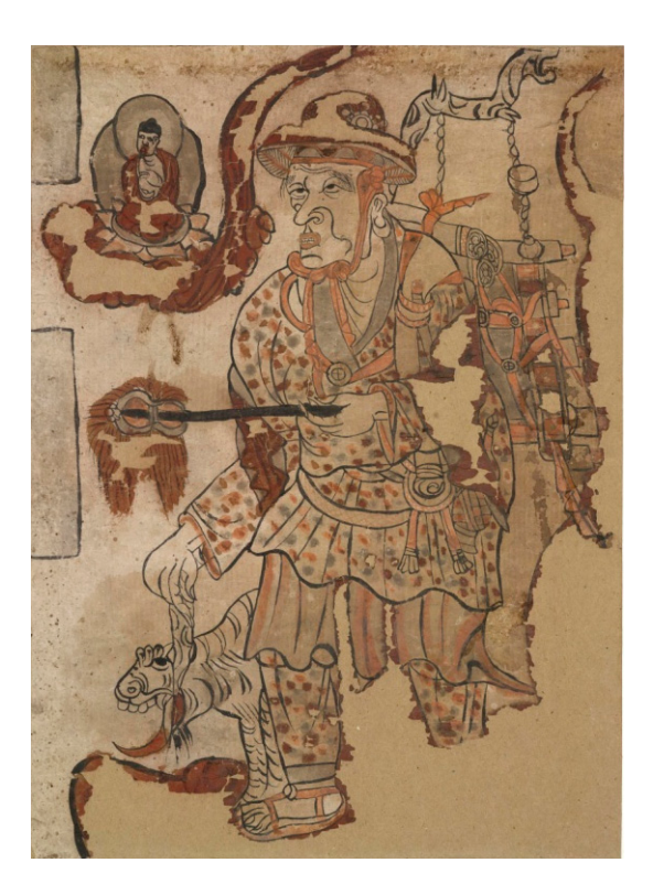
Figure 4. Itinerant Monk. Dunhuang, 10th century. Ink and colors on paper, 41.0 \times 29.8 cm. The British Museum (1919,0101,0.168).

Another notable aspect of the Guimet painting (EO.1138) is the way in which the trail of the cloud vehicle of the small Buddha extends towards the face of the monk, who holds his mouth open (Figure 3).<sup>23</sup> As noted in previous studies, all of the main figures in the twelve paintings appear to be chanting. The piece in the Bibliothèque nationale de France is particularly notable for the relationship between the monk's recitation and the small Buddha (Figure 5). The phrase "Homage to Baosheng Buddha," signifying the monk's invocation of the Buddha, is written along the left edge, and the monk is facing the characters with his mouth visibly open. With the Buddha's name and the monk located within the same pictorial time and space without a demarcating line between them, it appears as if the scene is capturing the very moment that the sounds "Nanwu Baosheng rulai fo" leave the monk's mouth. The small Buddha positioned immediately above these words reflects its close association with the words. This composition undoubtedly derived from the artist's understanding of the close relationship between these components.