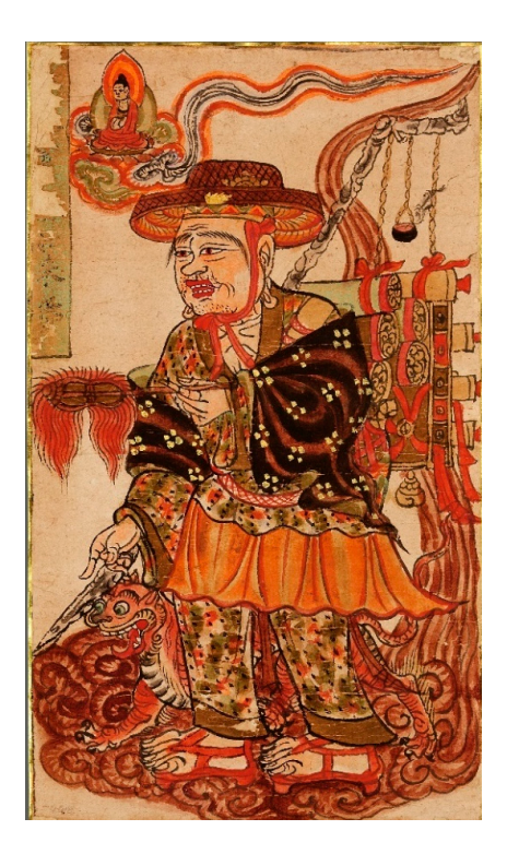
Figure 1. Itinerant Monk. Dunhuang, 10th century. Ink and colors on paper, 49.8 × 28.6 cm. National Museum of Korea.

In previous scholarship, this group of paintings was often referred to as "itinerant monk paintings" or "xingjiaoseng tu" 行脚僧圖.³ While a fair amount of attention has been paid to these pieces, no consensus exists regarding whom the main figure represents. While few currently support its earlier identifications as Xuanzang 玄奘 (602?–664), inarguably the most famous pilgrim monk from the Tang period (618–907), or Dharmatrāta, one of the Eighteen Arhats in Tibetan Buddhism (Stein 1921; Matsumoto 1937, 1940a, 1940b; Kumagai 1995), it remains difficult to determine whether the figure should be considered Baosheng Buddha or its incarnation, a bianwen 變文 (transformation texts) performer, or a historical figure such as Li Tongxuan 李通玄 (635–730) (Akiyama 1965; Mair 1986; Wang [1995] 2016). A major obstacle in identifying the figure is the fact that almost no immediate textual sources survive. This is why, rather than acknowledging these paintings as a tradition unto themselves, previous studies tend to identify them with other better-known visual traditions that can be substantiated by relatively rich textual sources.