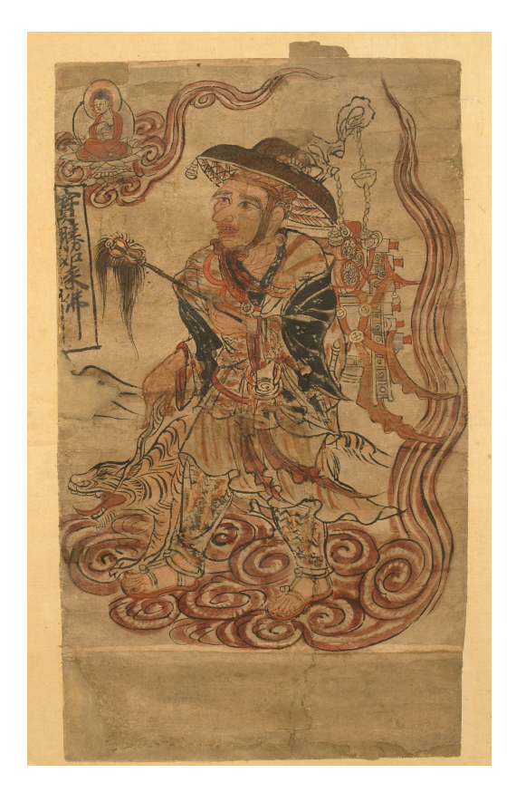
Figure 7. Itinerant Monk. Dunhuang, 10th century. Ink and colors on paper, 51.8 × 29. 3 cm. Inv. No. Dh-320. The State Hermitage Museum, St. Petersburg.

The silk painting in the Musée Guimet (EO.1138) certainly appears to be the earliest example of this type of painting, and the existence of the two cartouche frames fits the earlier iconography in which the small Buddha and the monk were perceived as separate individual beings. In terms of style, it is unlikely that the painting on paper with two cartouche frames in the British Museum is contemporaneous with the earliest silk painting. It is possible that the two cartouche spaces were created while copying earlier models with these features or that there still existed confusion over the identities of the small Buddha and the monk. The inscriptions in the paintings in the State Hermitage Museum and the Tenri Library omit the word "nanwu" before the Buddha's name, so possibly the original context of the monk's recitation of the Buddha's name has been largely forgotten (Figure 7).<sup>34</sup> Additionally, they feature the most simplified and awkward depictions, and it is likely that their dates are later than others among the itinerant monk paintings.