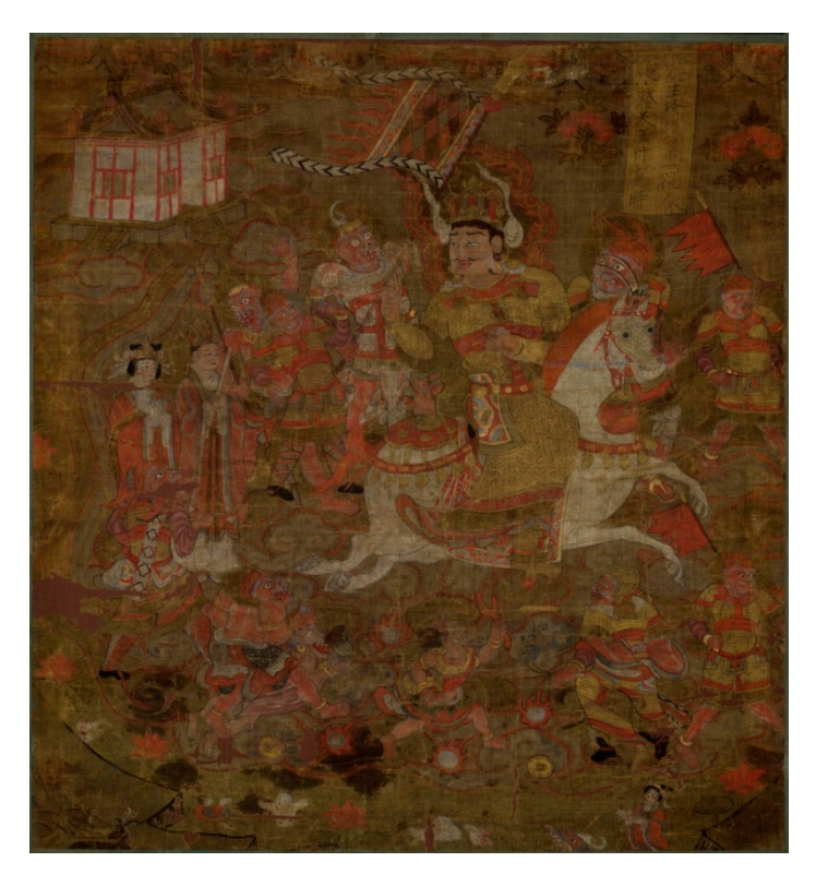
Figure 15. Vaiśravaṇa . Dunhuang, mid-10th century. Ink and colors on silk, 61.8 \times 57.4 cm. The British Museum (1919,0101,0.26)

For the scriptural basis of the three surviving paintings, Matsumoto mentioned the chapters on Four Heavenly Kings in the Zhang Ahan jing 長阿含經 (Long Discourses), the Daloutan jing 大樓炭經 (Sūtra of Great Conflagration), the Qishi jing 起世經 (Sūtra on the Arising of the Worlds), and the Qishi yinben jing 起世因本經 (Sūtra on the Primary Causes of the Arising of the Worlds). He took particular notice of the account in the Qishi jing of Vaiśravaṇa with five great yakṣas roaming in a park with a pond near his abode in the three cities on the northern slope of Mt. Sumeru. He considered that the paintings illustrated the scene in which Vaiśravaṇa leaves his cities and roams about the park with his entourage. To