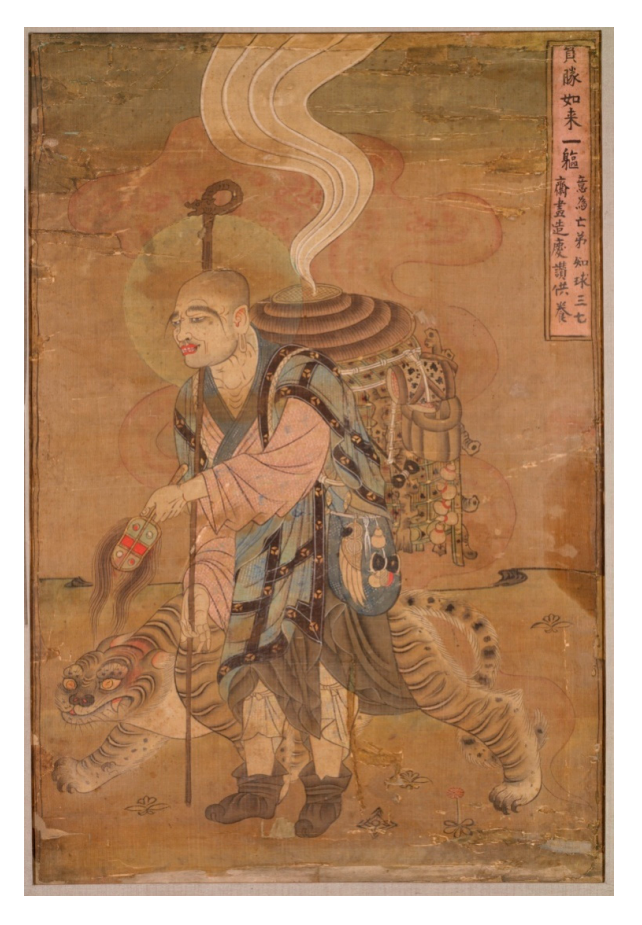
Figure 2. Itinerant Monk. Dunhuang, 9th–10th century. Ink and colors on silk, 79.8 × 54.0 cm. Musée Guimet (EO.1141).

Perhaps a more important question than whether or not the monk represents Baosheng Buddha is the relationship between the main figure and the small Buddha in these compositions. As early as the 1960s, Akiyama Terukazu proposed that the monk was an incarnation of Baosheng Buddha. <sup>19</sup> More recently, in 2009 Xie Jisheng examined Baosheng Buddha's association with the western direction, pointing out that a monk named Baosheng 實際—along with Yijing 義淨 (635–713), Śubhakarasiṃha (善無畏, 637–735), and Bodhiruci (菩提流支, ?–727)—was regarded as one of the four Tripiṭaka masters who brought Sanskrit sūtras to China. He also pointed out that Baosheng Buddha represents the west in sūtras such as the Foshuo chengzan rulai gongde shenzhou jing 佛說稱讚如來功德神呪經 (Sūtra of Incantation of Praising Buddhas and Merits). <sup>20</sup> For Xie, Baosheng Buddha's association with the west resulted in the small Buddha's inclusion in itinerant monk paintings as the deity venerated by the monk and from the late Tang to the Song (960–1277) period the monk became equated with Baosheng Buddha. <sup>21</sup>