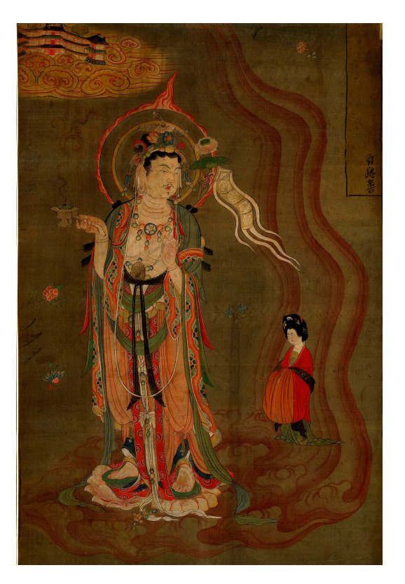
Figure 12. Soul-Guiding Bodhisattva . Dunhuang, 9th century. Ink and colors on silk, 80.5 \times 53.8 cm. The British Museum (1919,0101,0.47)

Phillip Bloom's discussion of clouds is also worth consideration in the present context. In tracing the origin of the clouds prevalent in Water and Land Rituals Paintings of the Song period, he pointed out the emergence of independent, self-sufficient cloud-borne deities among Dunhuang banners from the 9th to 10th century. The examples he listed are Vaiśravaṇa and Soul-Guiding Bodhisattva housed in the British Museum, Guanyin attended by Two Donors in the Harvard Art Museums, and Itinerant Monk (MG. 17683) in Musée Guimet (Figures 12–14). Bloom further explained that these icons were completely divorced from the spatial and narrative concerns that often dominated the decorative schemes of cave-shrines and emerged as autonomous objects of devotion. Describing the new tendencies observed in textual and visual materials of Dunhuang as a "liturgical turn," Bloom addressed how their emergence could be related to the development of the Water and Land Ritual.<sup>67</sup>