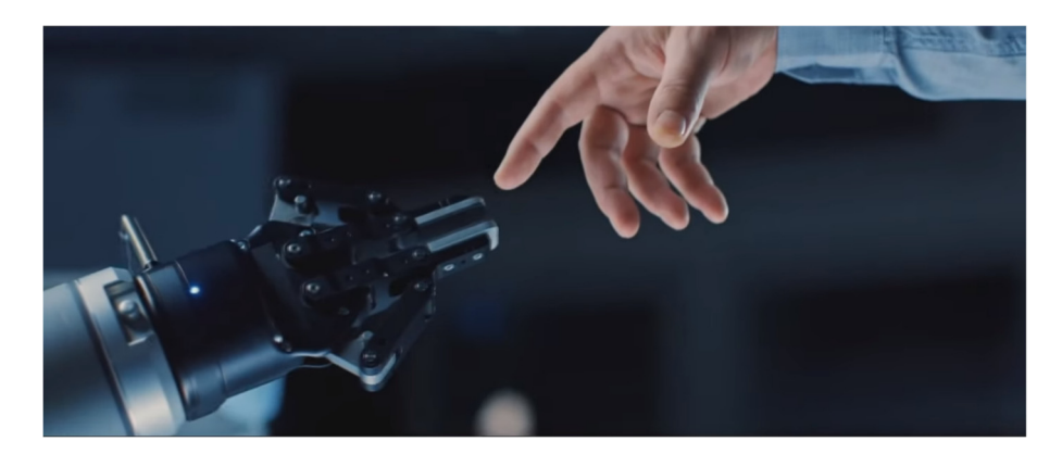
Figure 3. The Star Trek: Picard example.

Apart from these few examples showing more than just hands and forearms, the representation of AI in this corpus came in two primary forms: either as an embodied robotic hand or as a more ethereal, or abstract, 'digital' hand. The robotic hands were then either jointed white metal and plastic hands or fluid metallic hands without joints.<sup>3</sup> In the case of the Star Trek: Picard example, the robotic hand was a 21st century-looking robot arm with a more basic pincer, as in Figure 3 below.