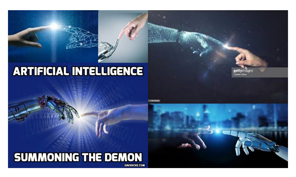
Figure 4. Examples of AI Creation Memes.

In examples with digital hands, they were either formed of points of light or vector lines. Some examples of all types are in Figure 4 below: