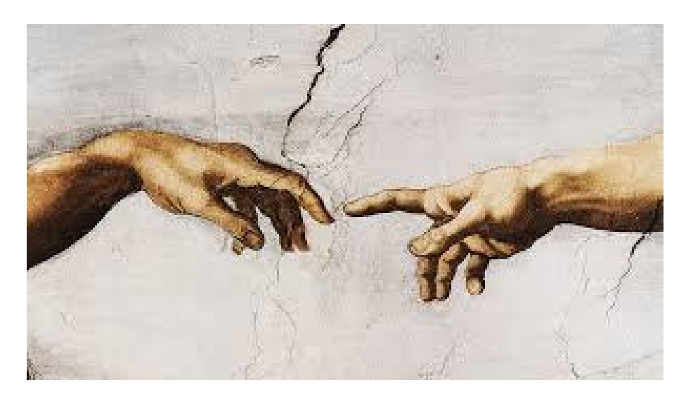
Figure 2. Poster of The Creation of Adam.

In this article, I will explore the employment of this particular image format in AI discourse with examples of what I am terming the AI Creation Meme—the image from the European Commission's website being a prime example that also appears in a significant and impactful online location. The methodology of this article is informed by art history and meme theory as well as anthropological observations in order to explore the impact of this very visible use of religious imagery and its connection to post-humanist and apocalyptic ideas and discourse. The AI Creation Meme will also be explored in relation to research on the New Visibility of Religion and the post-secular society.