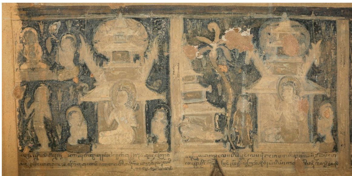
Figure 29. Pagan, Kutha, 13th century. Two Vimana images—the left image concerning a young woman who wished to be reborn as a man, the right one showing the benefits of being in the Buddha’s vicinity, his very sight guaranteeing the lucky mansion inhabitant many years of bliss in the heavens.

Figure 28. Nyaung U, Kondawgyi, 13th century. Four examples of the diverse audiences addressed by the Buddha, including snakes, princes and kings, monks and divinities. Inscriptions originally likely here are now missing. (a) Buddha addressing monks and Brahmas. (b) Buddha addressing nagas, monks and lay people.