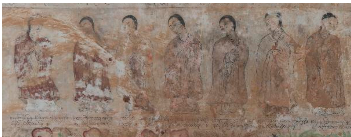
Figure 45. Pagan, Sulamani, images dating to the 18th century. Gotami and the paradigmatic Bhikkhuni(s).

By now, vernacular texts in Thai were also likely known, especially the story of Phra Malai, the Burmese Shin Malae, shown tidying up the Sulamani Cetiya environs in Tāvātimsa, and about to meet Metteyya prior to relating what he learned to the people on earth. More attention also was lavished on differentiating the “good people”. Comparing the plaques and paintings of the Pagan era to their counterparts from the 18th and 19th century indicates an altered ideational matrix in which the “deterrence theaters” were embedded. 74