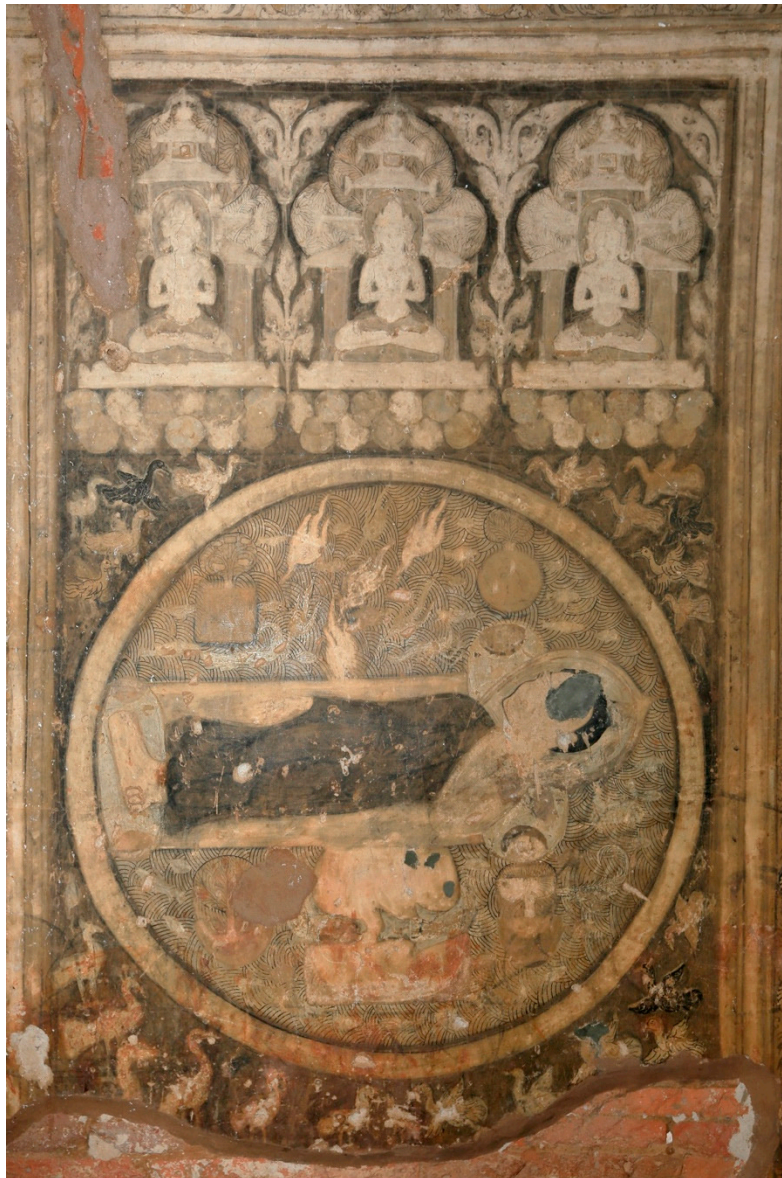
Figure 15. Pagan, 13th Century, endowment 585. The bodhisatta's dreams on the Night of Awakening, linked to three heavenly mansions providing corroboration for the dreams' interpretation.

the broader meaning enveloped in what—in other contexts—were the Four Omens. 23 The Omens were illusory; gods disguised themselves to reveal life's facts to the pampered prince, presenting what was not physically there, but nonetheless crucial for the response exposure generated. The ruse worked, indicating how what was seen could have profound effects—altering the prince's grasp of reality, generating an emotional upheaval that, in turn, had stupendous consequences—attesting thereby to the utility of manipulated appearances. The prince in the Yuvāñjaya Jātaka (no. 460) mastered life's facts by observing the evanescence of dew, experiencing a saṃvega moment much like prince Siddhārtha's, as befitted his being the bodhisatta in a previous life (Figure 16)