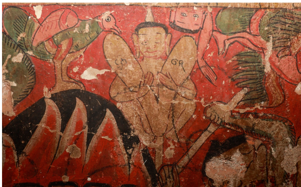
Figure 51. Anaint, Endowment 69, 18th century. Punishment for pleaders.

In this new world, ordinary and extraordinary vices were divested of their narrative contexts, and highlighted independently, targeting mediums, drunkards, vendors of intoxicants, and people who lied or hoped to attain their goals by dishonesty or flattery. None of the above means to suggest that a much better integration of authority and control had materialized by the time of king Thalun's reign, but his ambition augured transformations. A wishing tree, inserted as a break between narratives linked to the Buddhavamsa, Vessantara, Vidhura and Nimi Jātaka, slivers above inscribed hell scenes, providing the counterfoil. 78