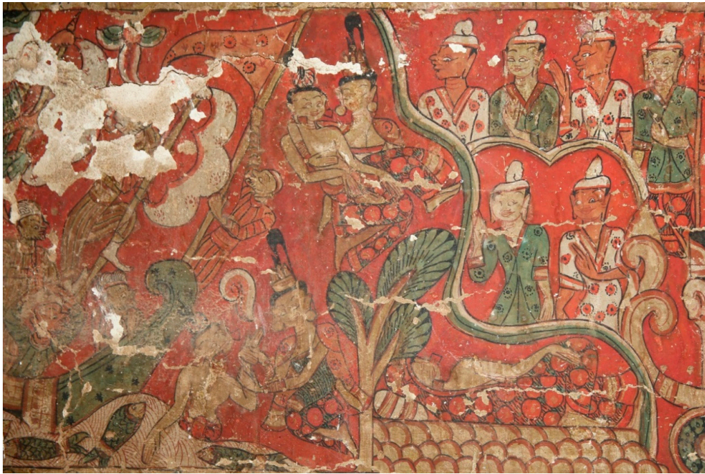
Figure 7. Anaint, 18th century. Foreigners as merchants in the Mahājanaka Jātaka, identifiable by their ugly facial features and attire.