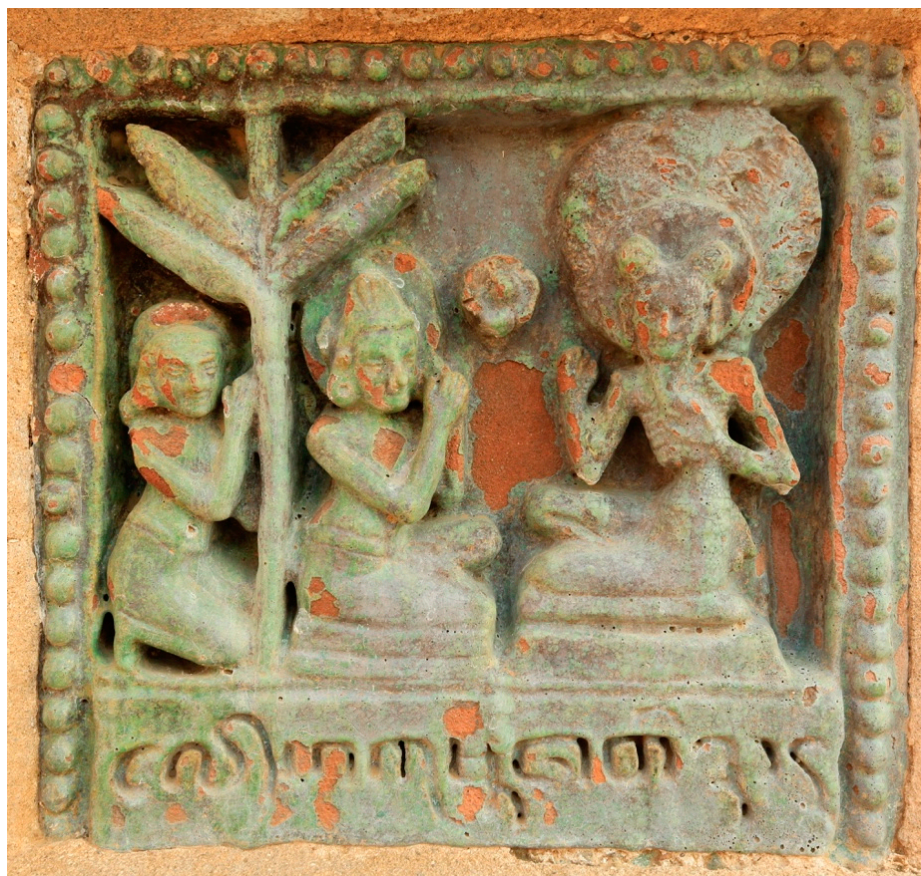
Figure 42. Pagan, Ananda, 11th century. Lohakhumbi Jātaka, 314.