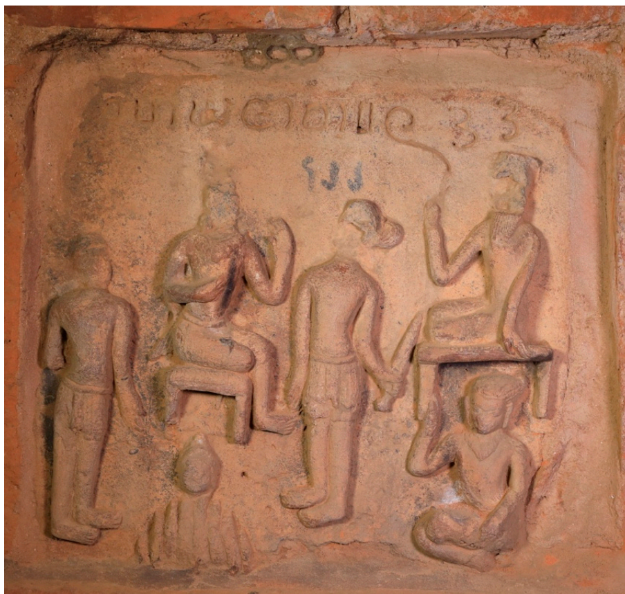
Figure 9. Pagan, Hpetleik Stupa, 11th Century. Jataka 422. Devadatta sinking into the earth, usually shown by a fire bursting from the underground, only the king's head remaining visible.

In Aśvaghoṣa's Buddhacarita , The Life of the Buddha , during the second watch of the night of awakening, Siddhārtha sees all beings' births and death, including their sojourns in hell: "some are made to drink fiery molten iron ... some are devoured by horrid dogs, with iron teeth...if the evil doers could only see the fruit of their deeds ... they would ... vomit hot blood ... " 8 This sliver is absent from the Pali Nidānakathā , one of the sources drawn upon in Pagan to master the complexities of the Buddha's partial biography. 9 Concerns with hells and the heavens were, however, very much part of Pagan's public face early on, indicating the utility of the ideational construct, of which these two settings were a part. (Figures 9 and 10) Their relevance was broadly spread; meritorious animals also received their heavenly mansions' rewards, like the elephant, the horse, the monkey, and the ox, for example, in the 13th-century Kutha hpaya (845). As later donative inscriptions indicate, and as will be shown more extensively below, the threat of ending up in the netherworld was a living concept that donors feared.