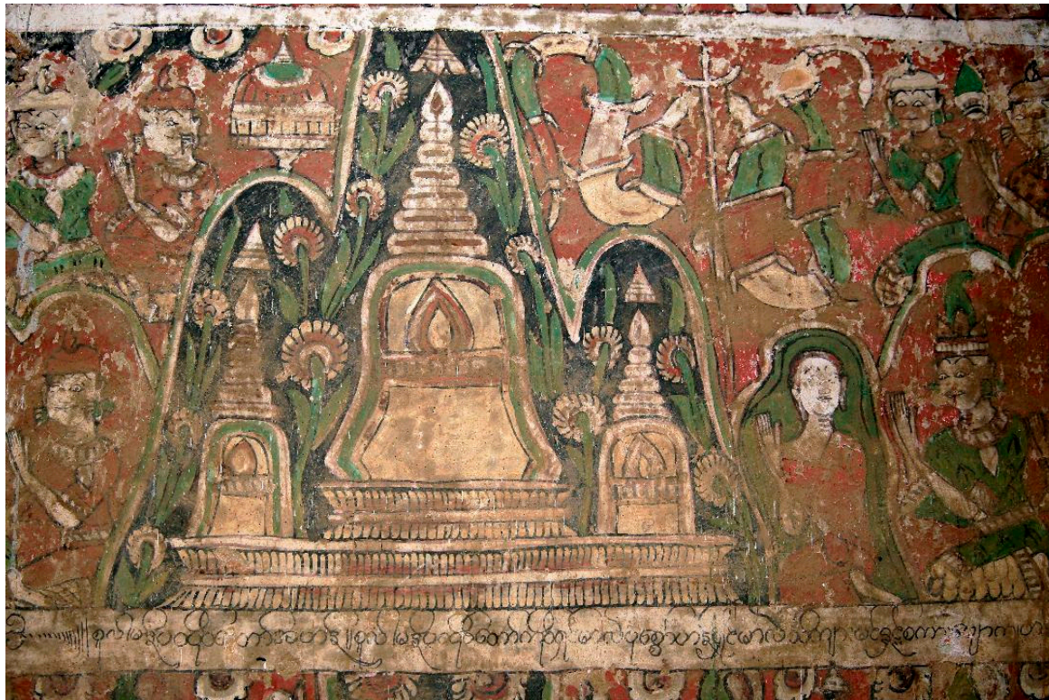
Figure 14. Pakhan nge, Manawayama, 18th century. Shin Malae sweeping Tavatimsa. The gods and Indra make offerings to the Sulamani (Culamani) Hpaya and converse with Shin Malae.

There is no indication that, at least on the popular level, anyone thought these cosmic realms were unreal, (Figure 14), nor does anyone seem to have been excited by the problematics of what was being roasted in hell's pots or who was living the high life in a Tāvātimsa palace, given the disintegration of all constituents at death. 16