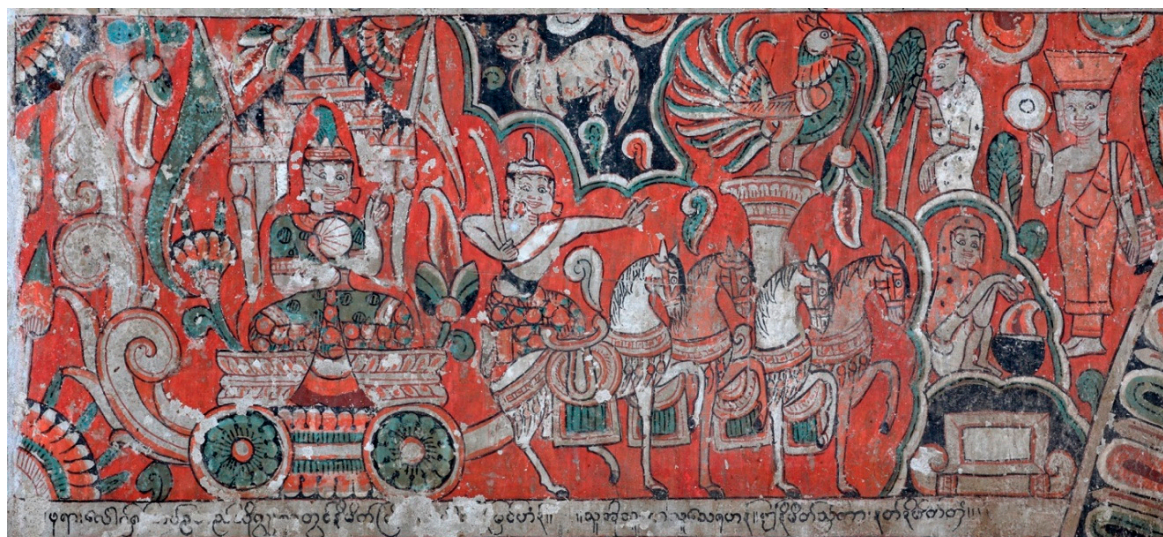
Figure 1. Salyingyi, 18th Century. The Four Omens. In the garden, the prince sees four beings, an old man, a sick man, a dead man and a recluse.

The use of such materials to enhance the significance of a sponsored endowment (Figure 1) illuminates the evolving contours of the Burmese sense of virtue, this society’s understanding of the world, and, with it, the human condition. This article does not contend with the question of whether these practices and the ideational assumptions behind them—rituals, liturgies and habits of the heart—amount to a “religion”. However defined, the term was unknown to the Burmese until very recent times. 2