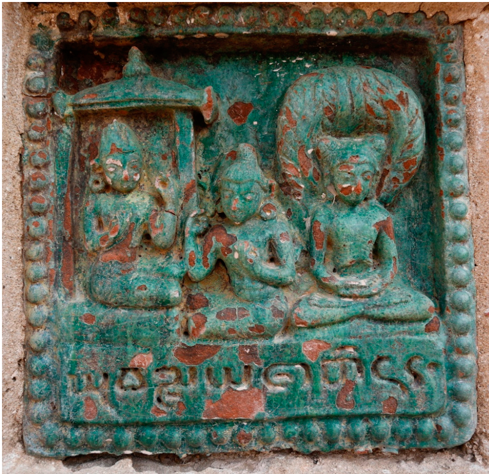
Figure 16. Pagan, Ananda, 11th century. Yuvanjaya, Jataka 460. A monoscenic interpretation, on a glazed plaque, encapsulating a story linking sighting a natural phenomenon—the sun burning away the dew—and grasping thereby life’s meaning.

The Aṅguttara Nikāya insists that the Four Omens are part of everyone’s life, but are ignored, and the result is hell. 24 This is echoed by the Devadūta sutta of the Majjhima Nikāya , where the thickheaded transgressor assumes that the Omens don’t apply to him. The Devadūta sutta is one of the texts whose content appeared listed seriatim by title, on endowment walls, a form of footnoting 11th–13th century style. When asked by king Yama whether he stumbled upon “divine messenger(s)” —counterparts of the ones that set prince Siddhārtha on the road to Buddhahood—a miscreant admitted to having encountered them but, misinterpreting their message, failed to draw the right conclusion, namely that what he witnessed applied to him as well and was also a clue to present and future punishments. The sutta also mentioned the “good people”, sappurisa , who, unlike this hell inhabitant, heeded omens and dwelled in bliss. 25