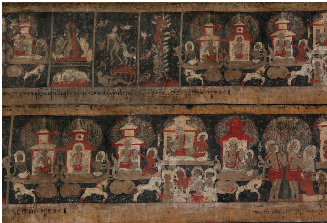
Figure 37. Pagan, Lokahteikpan, 12th century. Two segments of the Nimi Jātaka—visit to hell and visit to one vimāna.

the names of particular hells or transgressions, introduced the rest of the stupa's visual décor—the entire series illustrating bodhisatta lives. 60 (Figure 38a,b).