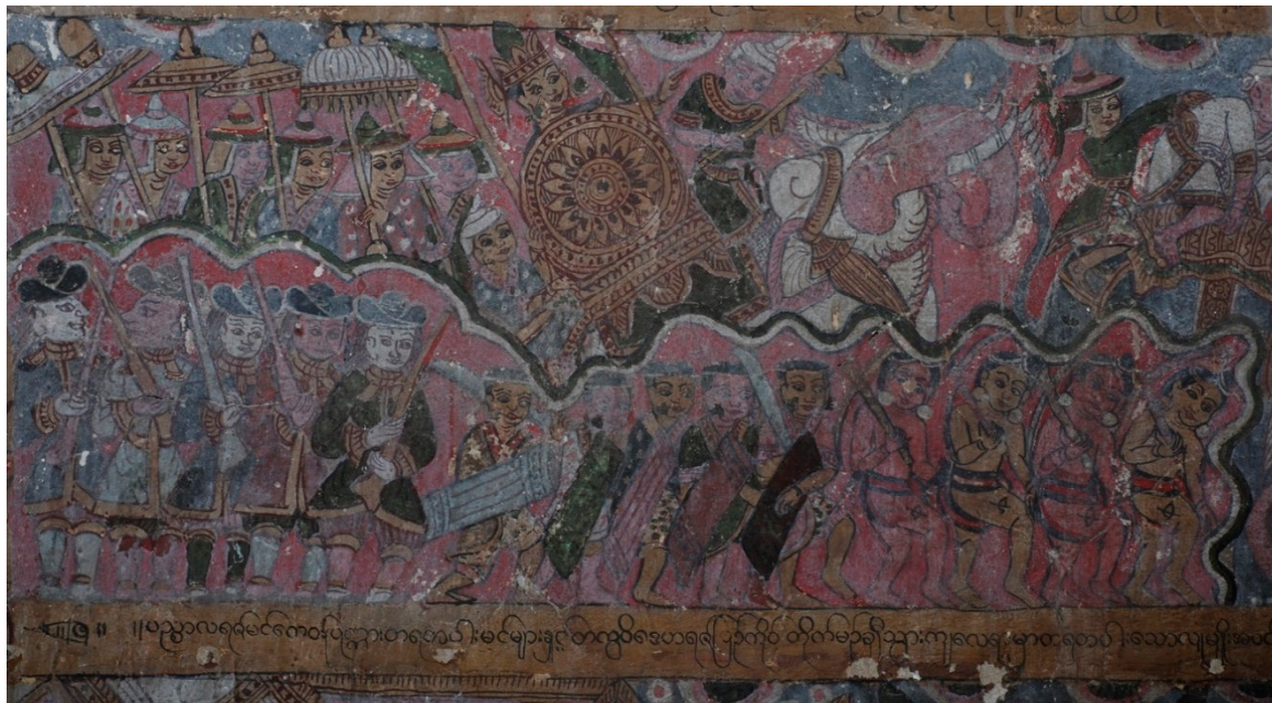
Figure 48. Laung U Maw, Ywathitkye. Early 19th century. Segment of the 101 Tribes, incorporated in the Mahosadha Jātaka.

Administrative changes and such groups' (most of them unidentifiable) allegiance did not thereby displace local control, exercised by land-based grandees authorized to benefit from their domains, nor did they alter social and cultural dynamics. Much like in Pagan, where misleading similarities belied a lack of uniformity, Nyaung Yan and early Konbaung structures likewise reflected the localism of donors, painters, program composers, and perhaps the sangha lineage of the monks affiliated with the compounds' housing such structures. 76