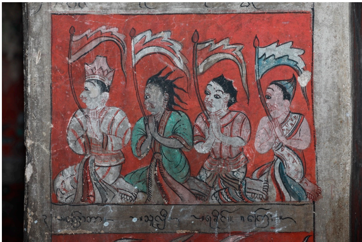
Figure 46. Shin Bin Pwin Lan, 19th century. Four Representatives of Groups among the 101 Tribes, including Rakhine.