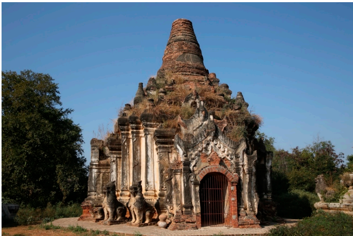
Figure 6. Anaint, 18th century.

Such stories had appeared in shifting garbs since the 11th century, when imagery reflected Northeast Indian origins. More important was what they serviced, an elaborate, sophisticated and influential conditioning mechanism on behalf of royal and communal needs. The mechanism was grounded in prevailing theories of psychology and physiology, meant to harness human emotions to create better royal subjects, referenced in inscriptions as “the good people, sappurisa ”. This Pali term first appeared in the Mon vernacular before the end of the 11th century and remained a staple of