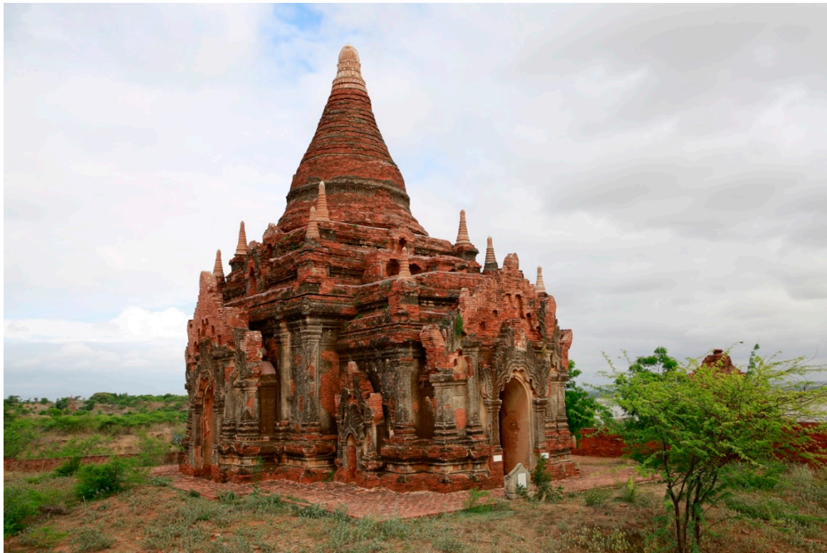
Figure 27. Nyaung U, Kondawgyi, 13th century.