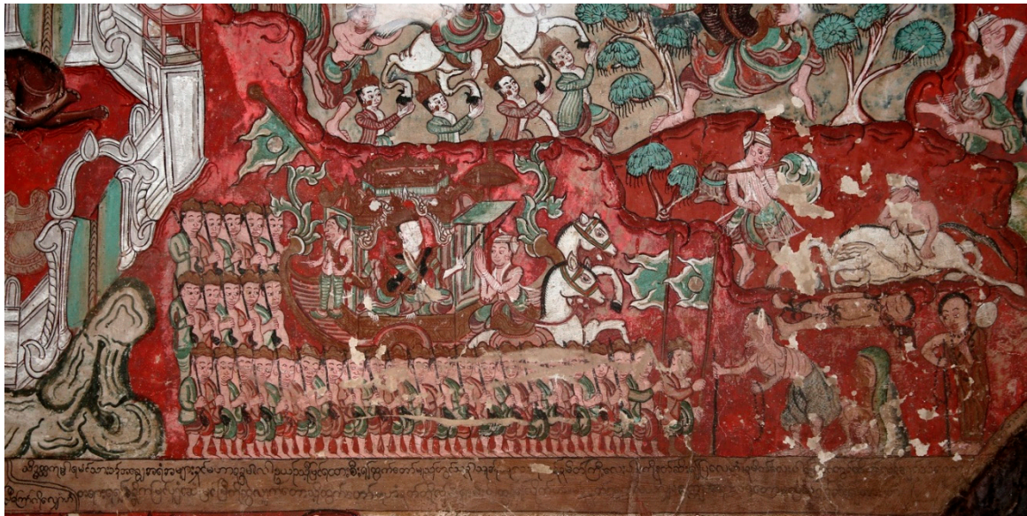
Figure 5. Amyint, Kuntaung Hpaya, 19th Century. Four Omens with embellishments—the dead man being attacked by crows, featuring also an immense army accompanying the garden sojourn, linked above to the Great Departure and, on the right side, the demise of the horse and the always-weeping charioteer dismayed by his master’s choice to abandon courtly life.