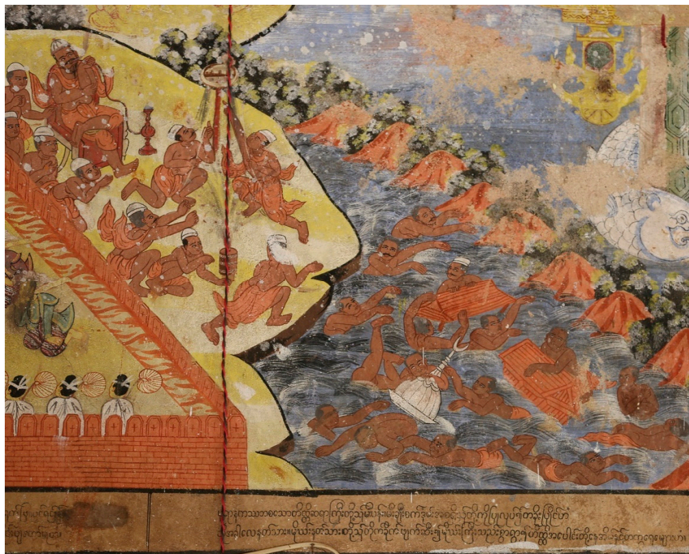
Figure 8. Pakokku, Shwetantit, 1917. Defeat of heretics identified here as Muslims, pointlessly clutching a mosque roof—recognizable by the crescent moon. They are drowning in the ocean surrounding Meru, hinted at by the giant fish encircling the mountain.

The popularity of hell and heavenly subjects in visual and ideational contexts fluctuated with the ebbs and flows of Burmese premodern history, refashioned by historical contingencies. Economists