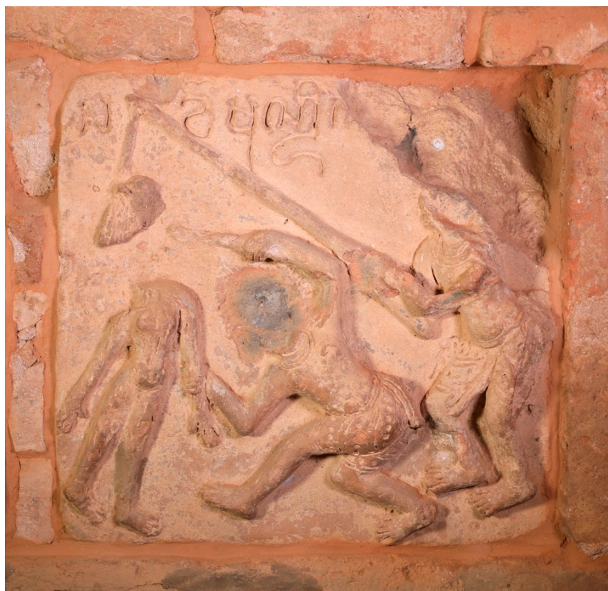
Figure 18. Pagan, Hpetleik stupa, 11th century. Sankhamundika Hell.

Using hell images exploited fear, turning it into a key component of the conditioning process, informing the meaning of saṃvega, and necessitating what pasāda offered, because evoking dread was good, but it also needed an antidote. (Figure 18) As Nāgārjuna put it in his Suḥṛllkeha , a friendly letter to the king, "... fear will arise through seeing pictures of hell, reading, remembering or hearing about them" and useful, since other people's misery had salutary effects, which was why Nāgārjuna, Bhāviveka, and their Pali counterparts piled it on, describing, among many other horrors, sliced bodies cooked like a mass of rice in great pots. 33 (Figure 19)