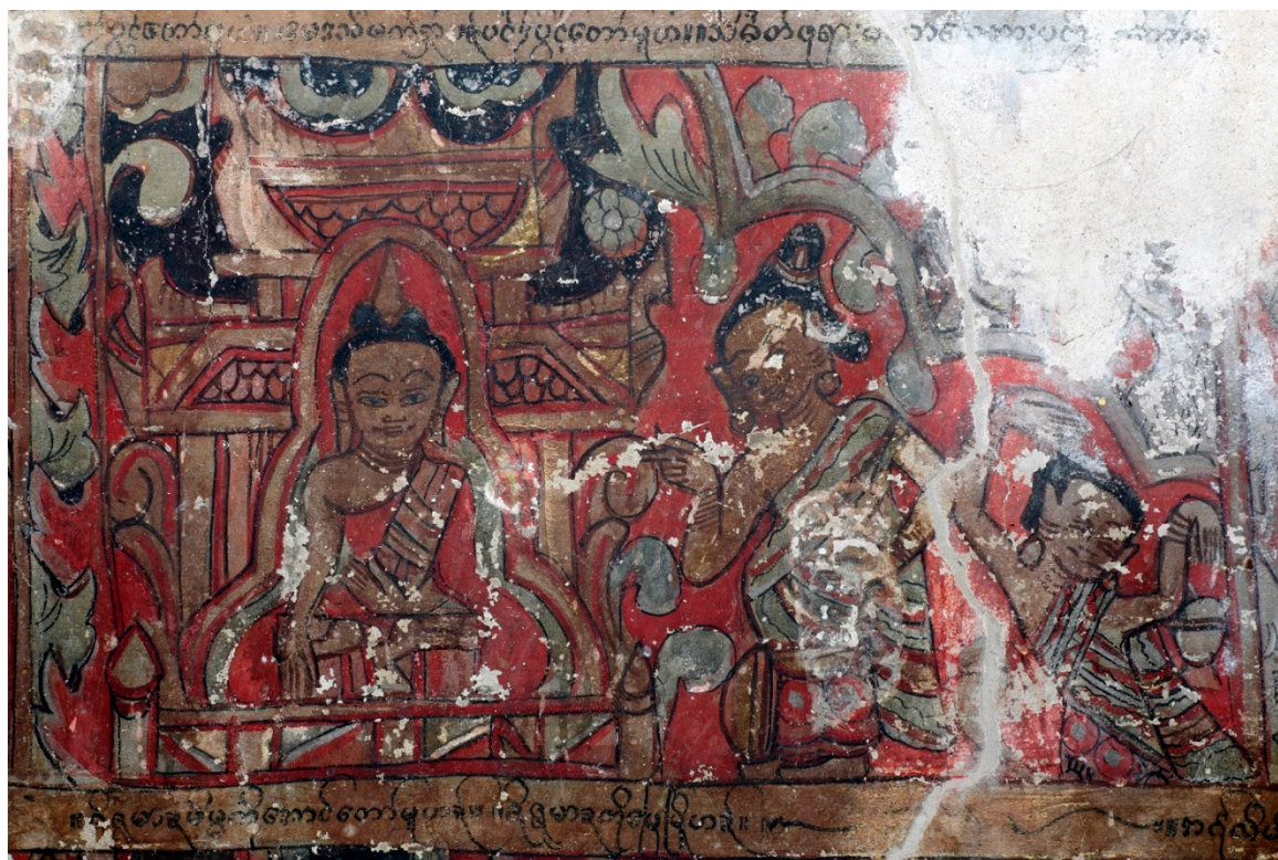
Figure 17. Salyingyi, 18th century. Punishment of Cinca, the bowl she used to fake her pregnancy on the ground, showing her next sinking into the ground.

Hell images and the stories about kammatic accounts behind them, were, in effect, saṃvega prompts. Images of ferocious birds pecking at corpses or scavenging dogs feasting on bodies were components in a sophisticated conditioning stratagem that exploited viewers or witnesses' emotions, grounded in a prevailing understanding of human psychology, to jump start a transformational process. It was not enough to show the wicked Ciñcā sinking into the ground; en route, black birds were shown attacking her body, in a later interpretation that was not part of the textual source but meant to augment her punishment. (Figure 17)