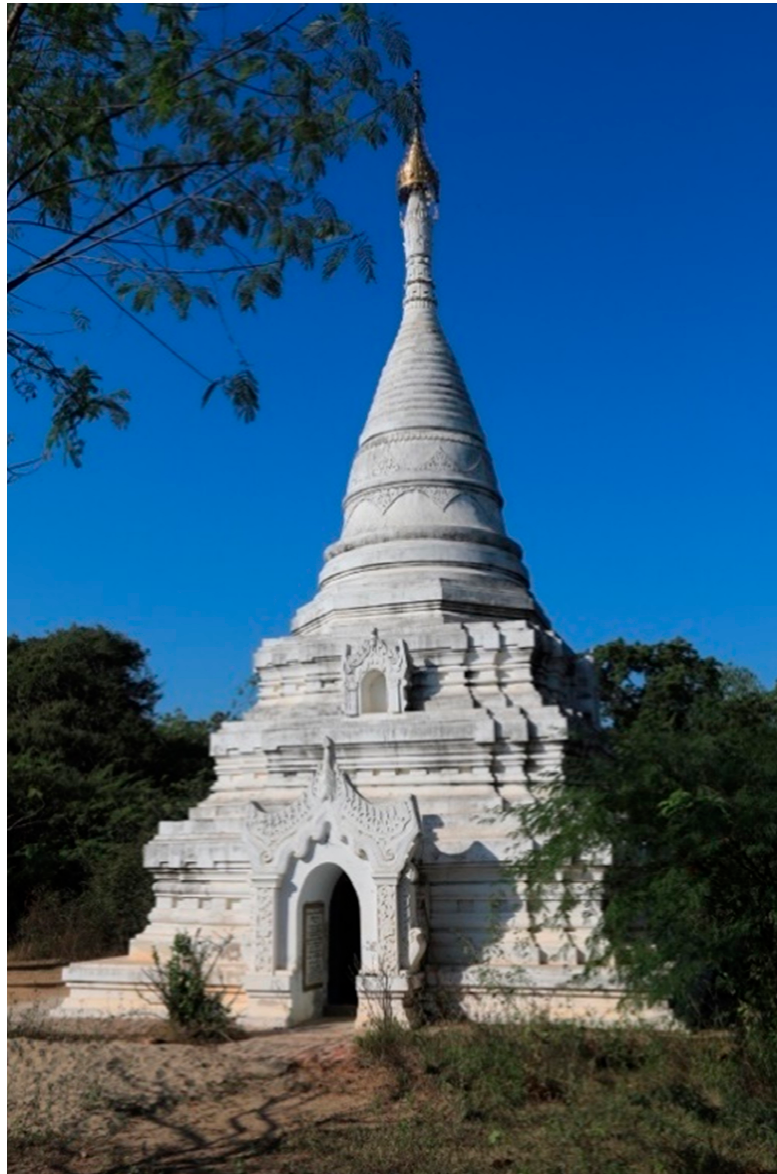
Figure 2. Salyingyi, 18th century—a typical medium sized endowment.

Recognizing variations enables the tracing of important ideational developments—which is valuable, as more conventional historical data are missing.