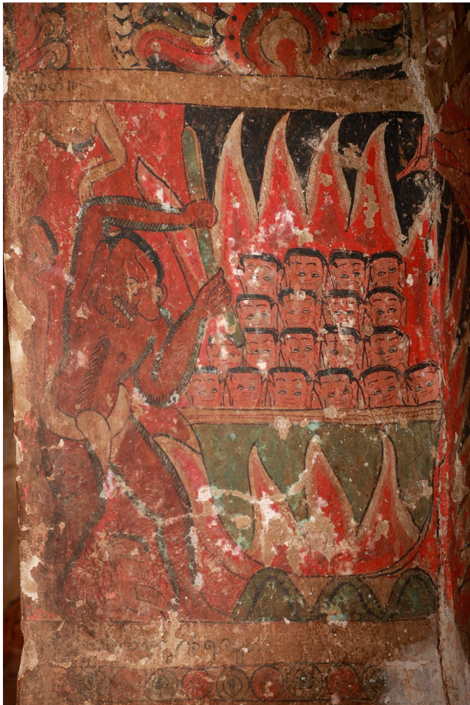
Figure 19. Anaint, Zeditawtaik. 18th century. Pots in which transgressors were cooked—one of the most popular and ancient images illustrating punishments in hell.

Shock value also informed several Jātaka narratives. In the Cūḷadhammapāla jātaka , 358, the bodhisatta was a seven-month-old baby, being chopped up on a slab as his mother watched. (Figure 20)