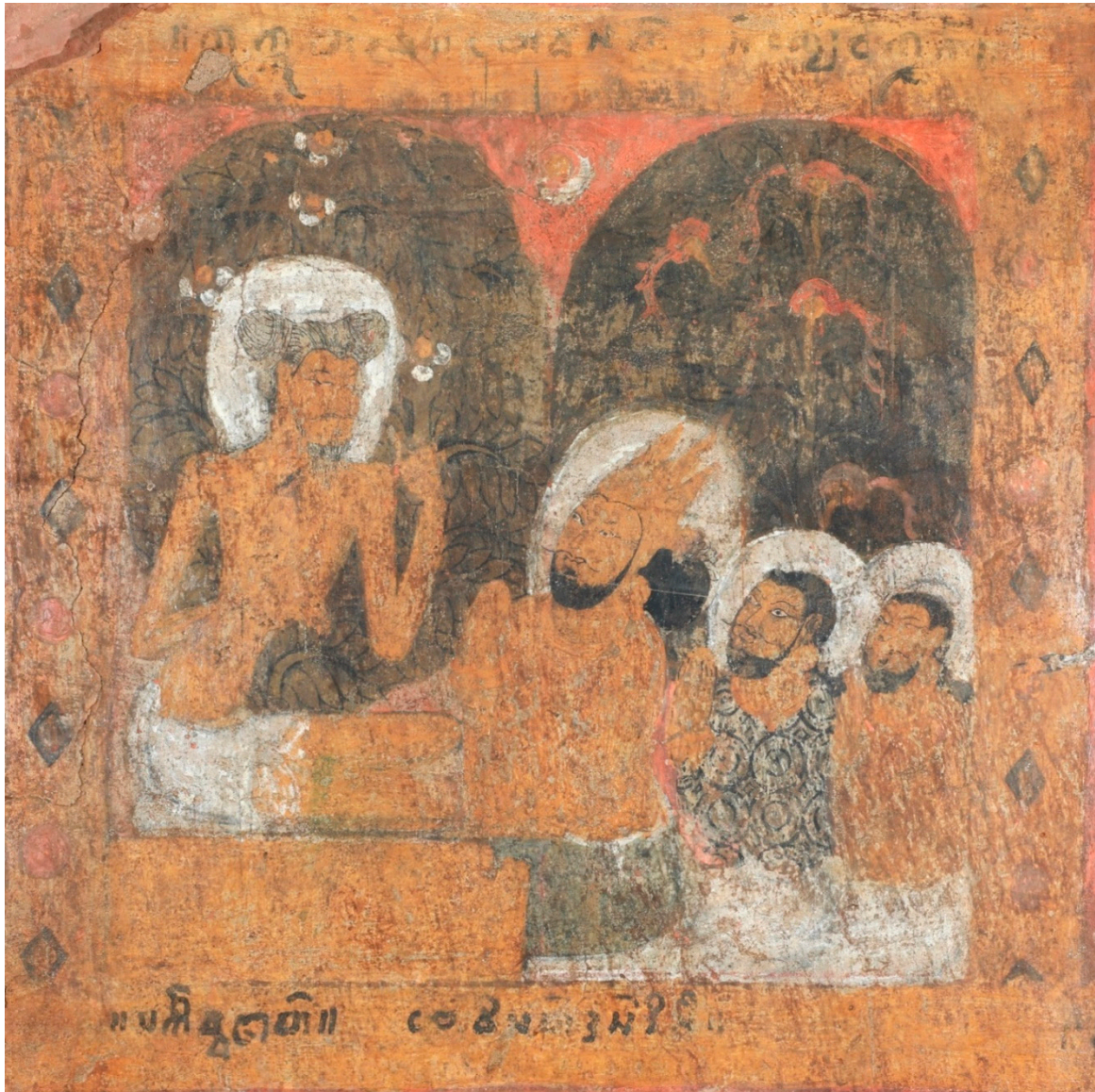
Figure 23. Pagan, Myinkaba Kubyaukgyi 1112 AD. Samkicca Jataka 530.

bright qualities . . . protecting the world”, according to the Itivuttaka , the means of destroying rebirth. 44 As exit from saṃsāra , however, was practically unattainable, more achievable and, at the same time, more immediately useful substitutes materialized. Confirmation of the existence of these rewards was provided by the Heavenly Mansion stories. They retained their resonance from the end of the 11th century until early modern times.