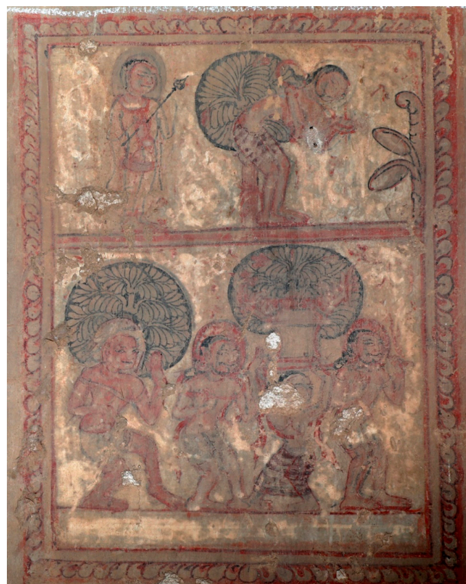
Figure 3. Pagan, Winido, 13th century, Endowment 659. The Four Omens, compressed into one frame, and featured, among numerous others, prince Siddhartha—Buddha Gotama biographical slivers.

The format of the Four Omens remained unstable; sometimes all four components appear, in other instances only one or two (Figure 3). Their location was also a movable feast, in several instances following immediately, for example, the encounter with the Brahmin predicting the baby's future. At other times the Four Omens appeared shortly after the Birth Episode as an introduction leading to The Great Departure, both interpretations omitting important intermediate episodes, hinting at what interpreters wanted to foreground.