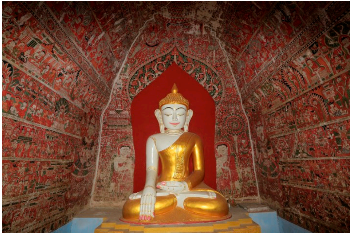
Figure 12. Salyingyi, 18th century, interior.

However defined, visuality assumes seeing, a truism that nonetheless is key to how endowment decors were meant to be understood and what contemporaries believed happened, if only notionally, when people gazed at a structure's interior or a stupa's outer shell. (Figure 12).