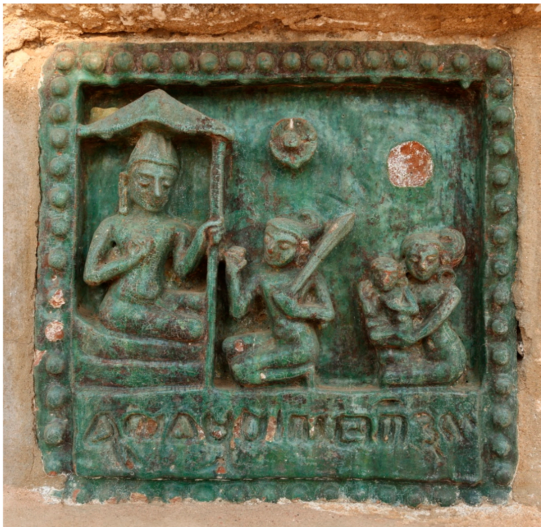
Figure 20. Pagan, Ananda 11th century. Cūḷadhammapāla Jātaka, 358—the bodhisatta’s mother is cradling the baby prior to its dismemberment.

The Ananda image shows the queen cradling what are, in the written narrative, pieces of flesh that had once been her son. In the painted Mon version, Indra’s presence suggests a somewhat different narrative, but close enough in that, presumably, the being on the ground is the cut up bodhisatta.