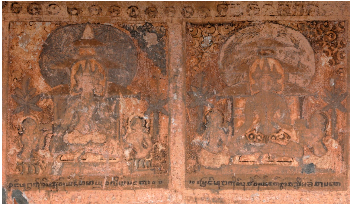
Figure 30. Pagan, Kutha, 13th century. Two vimanas allocated for animals.

husband Mahosadha, he told the king. Nāgasena was trying to explain away the Buddha's charge, that the king repeated, regarding women's inherent deceitfulness. Amarā, said Nāgasena, had the good fortune not only to follow her inner prompts, but also to not be unduly tempted to stray. 48