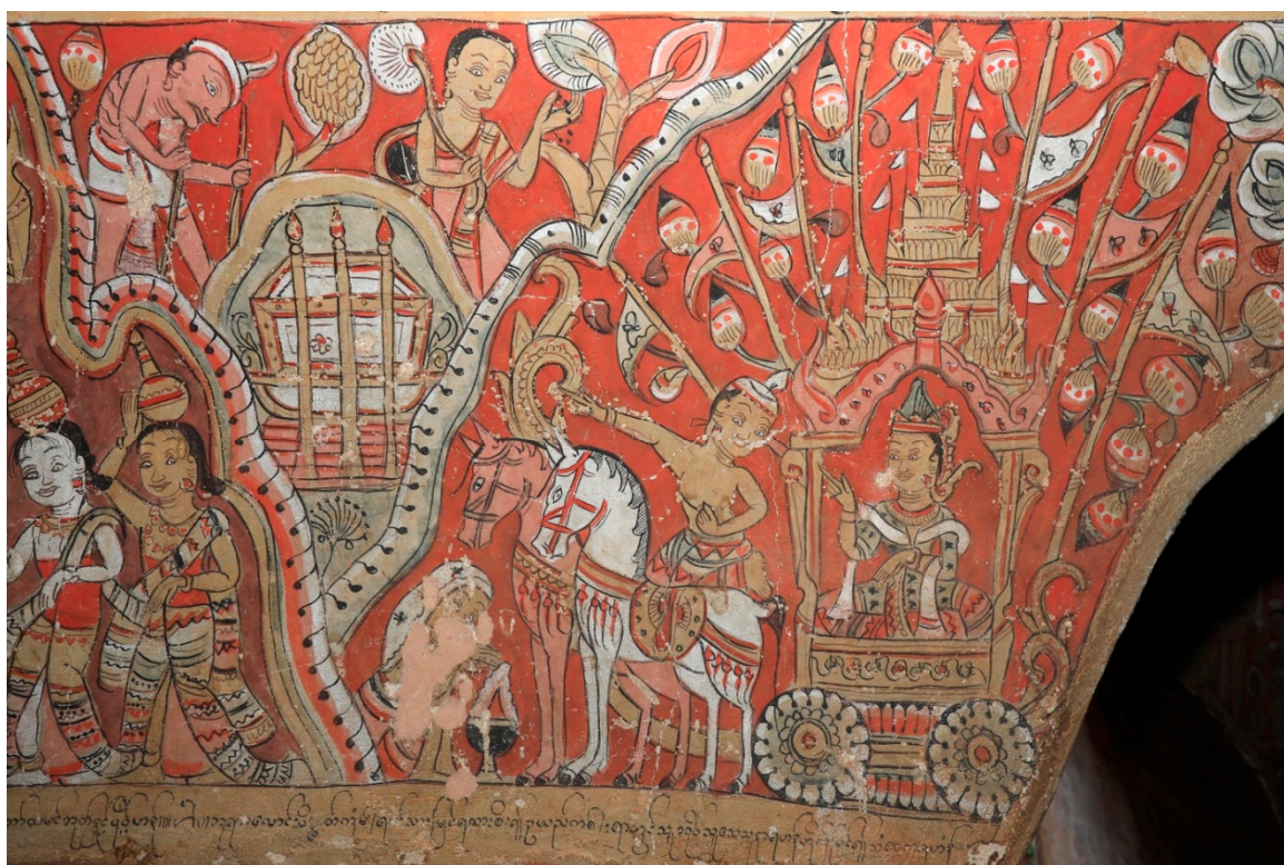
Figure 4. Anaint, Zedi Taw Taik, 18th century. Four Omens in a later interpretation.

Like the image contexts, the visual narratives' written sources also moved with the times, since the Dhamma, given its users, was always in motion. (Figure 4) In later centuries, for example, unease about the lack of seeming interaction between the prince and what he was looking at during his garden escapades, prompted insertions. This could take the form of a conversation between Siddhārtha and the "rahan", the ascetic, even though the original Pali text emphasized that the "unreal" Omens were but a mirage conjured to hasten the prince's advancement to Awakening, attesting the power of the seen, for emotions like saṃvega and pasāda . In other cases, the meaning of the Omens could be reinforced by making images interchangeable. Thus, the dead Jūjaka in a Vessantara Jātaka image was made to resemble the Four Omen's dead man in another tier. The ever-plastic Pali terms were also in motion, likely shedding their Pagan era meaning. That meaning is restricted for us, given the meager evidence, to what the Pali texts themselves had to say, the images illustrating the episode and their contextual placement.