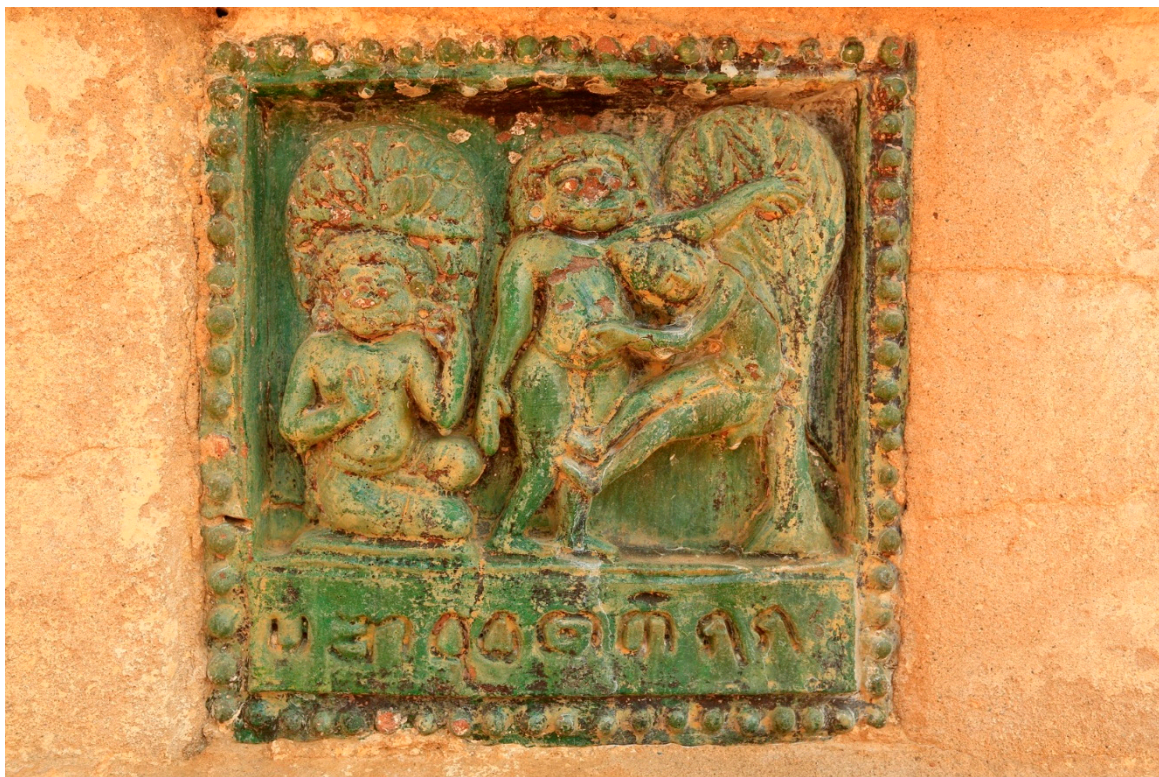
Figure 22. Pagan, Ananda, 11th century. Khadirangāra Jātaka 40.

In the Khadirangāra Jātaka , (no. 40), fearlessness defines the bodhisatta who, bent on feeding a paccekabuddha, steps into a fiery pit prepared by Māra, whereupon a lotus springs up from the fire, facilitating his deed. (Figure 22) Sly Nāgasena performed one of his intellectual sleights of hand when Milinda wondered why arahants, by definition fearless, scampered out of the way when charged by the Nalagiri elephant. Nāgasena distinguished between mental and bodily sensations. Arahants, free of the former, were still subject to the latter. 38