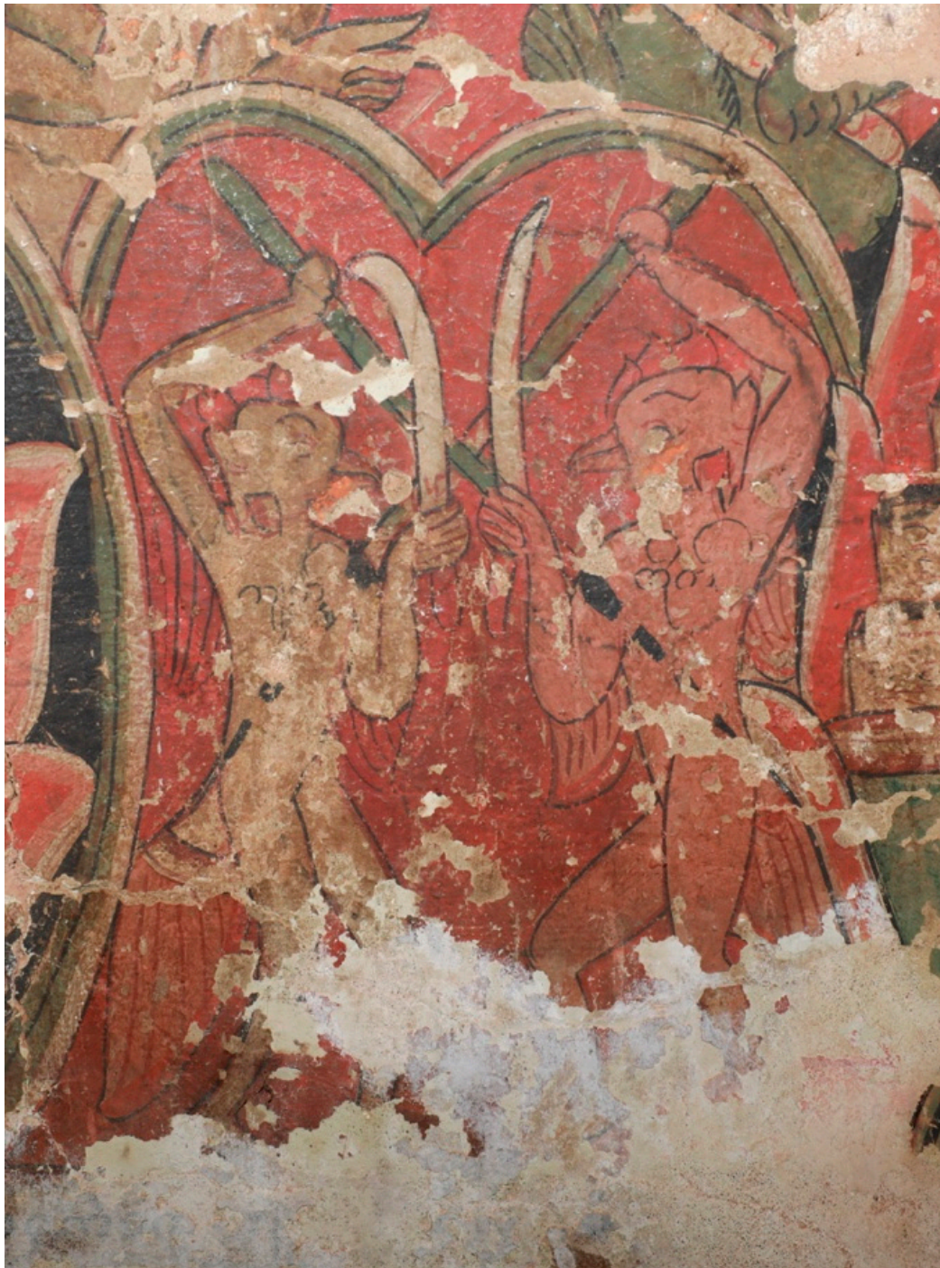
Figure 50. Anaint, 18th century, Punishment for Engaging in Cock Fights.

The shift becomes visible in the reign of King Thalun (1584–1648), suggesting sub-currents materializing earlier but difficult to identify. One of Thalun's edicts threatened street pipe smokers with 100-lash strokes, because of fires that plagued crowded settlements, indicating more invasive royal authority as well as the growth of population centers. Corrupt tax collectors were probably always subject to horrific punishments; now, they were threatened with dismemberment in the market square, the impaled having their bodily remains devoured by birds and beasts. Lawyers, (what the sense of that term meant in this context remains unknown), were singled out, and a few decades later shown meriting a peculiar punishment, altering their private parts to become giant, slimy and foul-smelling testicles. (Figures 50 and 51).