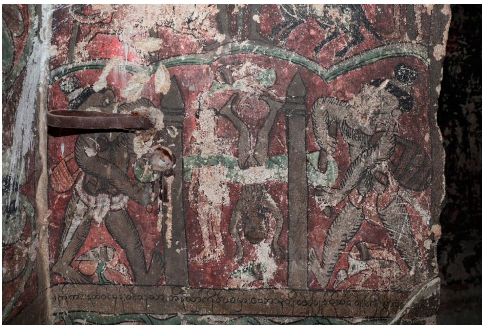
Figure 44. Powin Daung, Cave 480, 18th century. Punishment, among other things, for adultery.