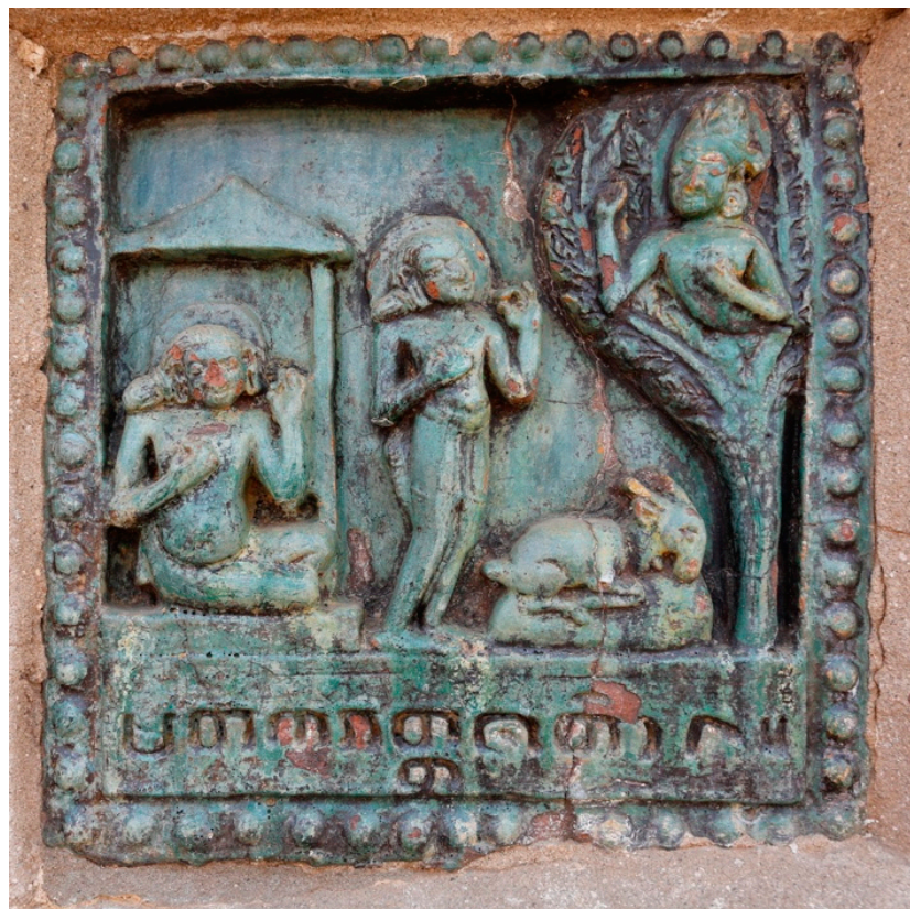
Figure 40. Pagan, Ananda, 11th century. Matakabhadda Jātaka, 18.