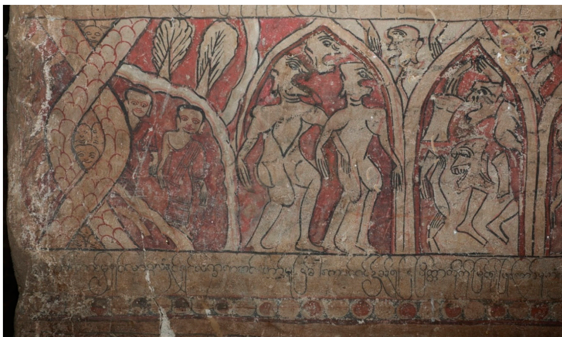
Figure 13. Pakhangyi, Endowment 227, late 18th century. Shin Mogalan and Shin Lakshana descend from the mountain. They see in the sky that there are ghosts and then they smile.

Imagination was linked to images because assimilating what one saw required it, though in the context of the Pali informed world, imagination had a mixed reputation, deemed useful, but also problematic. Buddhaghosa, the great theoretician of the Pali path, regarded images as an inferior form of information transmittal. This was why "guarding" the doors of perception, including seeing, was a desideratum for monks, since unguarded sense faculties facilitated misconduct, which, as another important doctrinal text, the Itivuttaka , warned, led to hell. 15 (Figure 13)