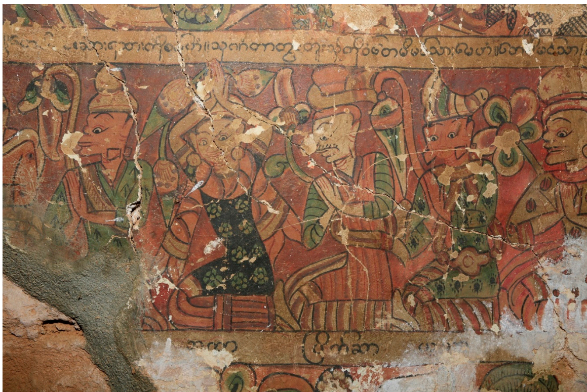
Figure 47. Anaint, 18th century. Five representatives of the 101 Tribes, including a woman.