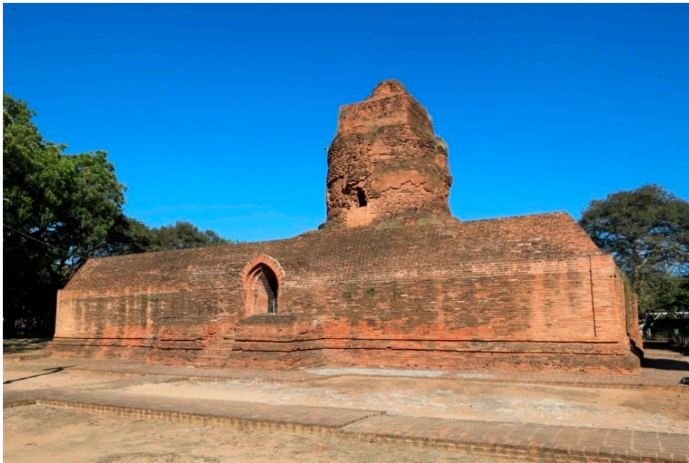
Figure 32. Pagan, Hpetleik Stupa, 11th century. Several hell images survive at the entrance to an encircling corridor featuring jataka plaques on both sides.

Furthermore, in addition to monitoring people's future lot, fear was exploited on behalf of their present lives. 55 (Figures 32 and 33a,b).