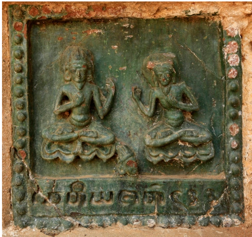
Figure 10. Pagan, Ananda Stupa, 11th Century, Jataka 422. Devadatta sinking into the earth, only the crowned head showing.

If images of hells and heavenly mansions socialized people into certain patterns of behavior, other sub-components of the Buddha tapestries likewise provided behavioral modification prompts. One example was the generosity of king Pasenadi, whose asadisadāna , incomparable donation, merited Pagan billboards, large images framing Gotama with subimages narrating the activities defining that gift's uniqueness, making the term part of the vernacular in later centuries. (Figure 11a,b).