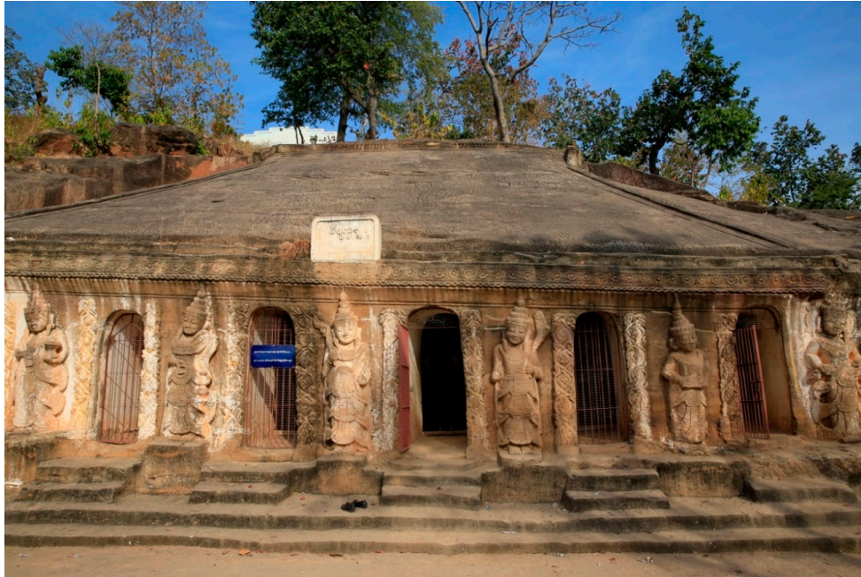
Figure 43. Powin Daung, cave 480 late 18th century. Décor preserving numerous inscribed punishments for specific transgressions.

At the same time, new segments of the Pali Daw, once invisible in the public square, entered the Buddha story tapestries. On hand were also, by the 18th century, two extensive Burmese narratives of that story, creating a different mosaic, adding new subchapters, concerned, for example, with Gotami, the bhikkhuni sangha, Gotama's father's funeral, Malika's Gift of the Cloth, the Eight Victories, and much else. (Figure 43, Figure 44, Figure 45)