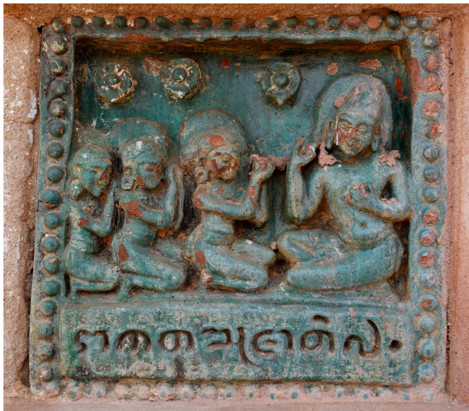
Figure 31. Pagan, Ananda, 11th century. Akataññū Jātaka, 90.

Hirī and ottappa were stimulated by narratives and images among other means. (Figure 31) This might explain why prompts were sometimes so over the top in their shock value. Saigyō, mentioned above, had noted that punishing miscreants by plucking out their tongue was not only horrific in and of itself but also deprived sufferers even of the consolation afforded by verbalizing pain. 53 The Āṅguttara Nikāya catalogued with relish hells' instruments, including the gruel pot, cutting off the top of the skull to drop in a hot iron ball; Rāhu's Mouth, inserting in the criminal's mouth an oil cup with a wick and lighting it; Flesh Hooker, being flayed with double fish hooks, and what was called the pickling process. Nāgasena repeated this to king Milinda, and similar tropes feature in the Pali and later vernacular literature. 54