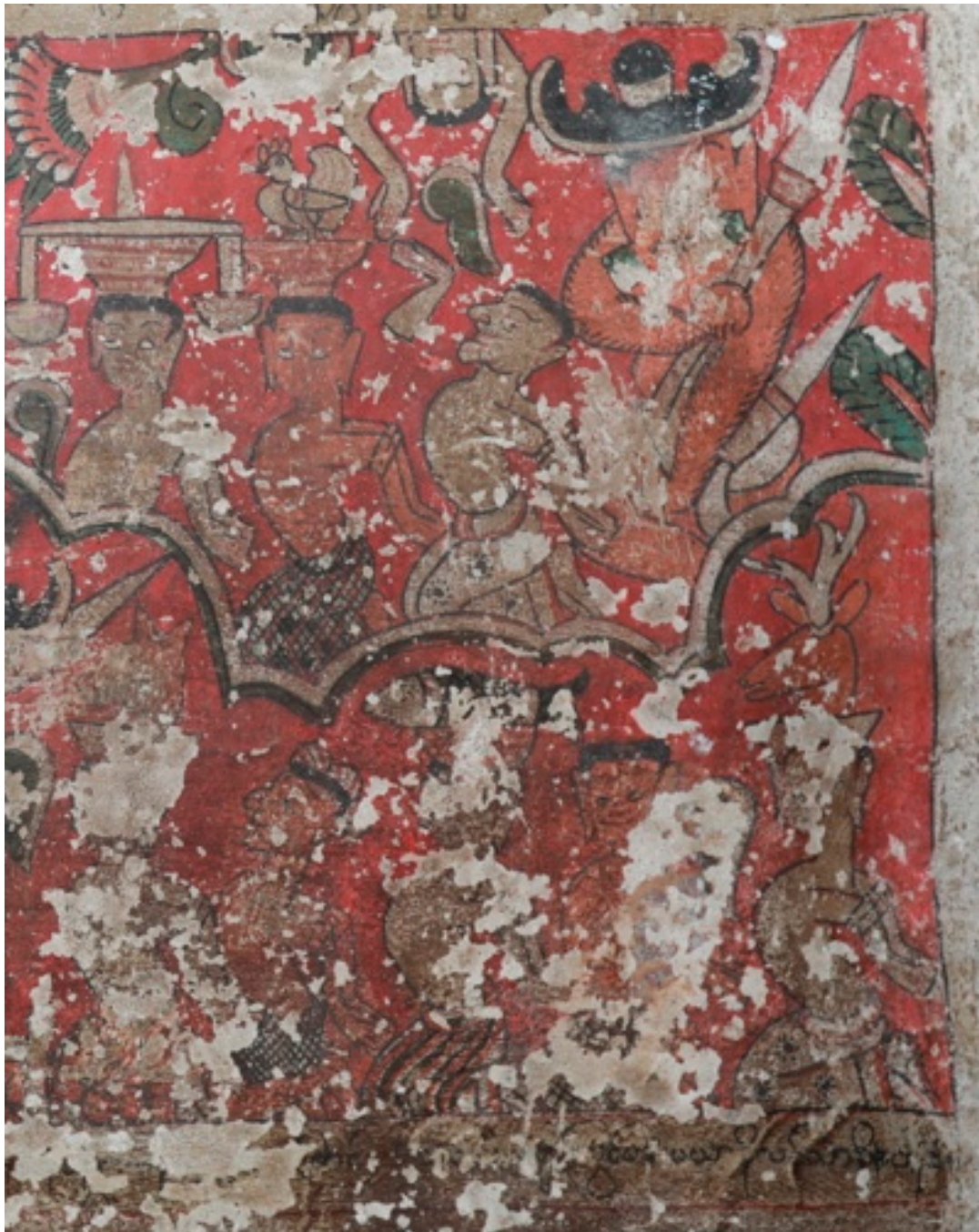
Figure 49. Anaint, 18th century. Punishments for transgressions, including mistreating animals.

the ten courses of wholesome actions, renunciation, treating sentient beings well, and working for their welfare. The omens were interpreted to mean that the encounter with old age cured the prince of the hubris typical of the young, the presence of the sick men divesting him of glorying in his own health, the sight of the dead man dissipating the fantasy of living forever. Earlier generations' sense of samvega as a "holy shit moment" survived, but were dressed in a somewhat different garb. As for pasāda, it was now linked to practices such as meditation, another instance of perennial written and visual volatility. 77