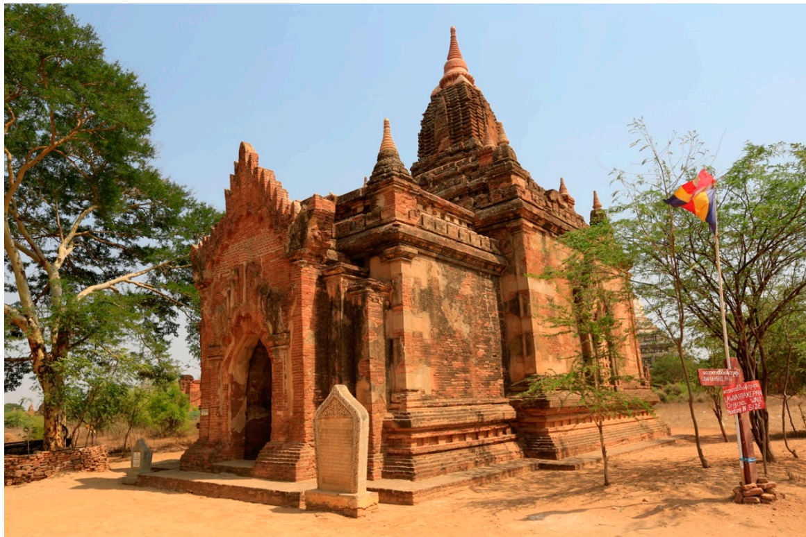
Figure 34. Pagan, Lokahteikpan, 12th century.

Examples of the former are the paintings of the Nārada and Nimi Jātakas in the early 12th century Lokahteikpan. (Figures 34 and 35a,b). These two stories belong to the last of the Jātaka books, the Mahānīpāta . Because of their association with the attainment of the parami(s) (perfections necessary for Awakening), they were depicted in extenso, as opposed to mono scenically.