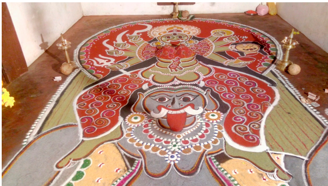
Figure 4. kaḷam drawn prior to a muṭiyēttu performance representing Bhadrakālī with eight hands holding weapons and riding on Vēṭāḷam.