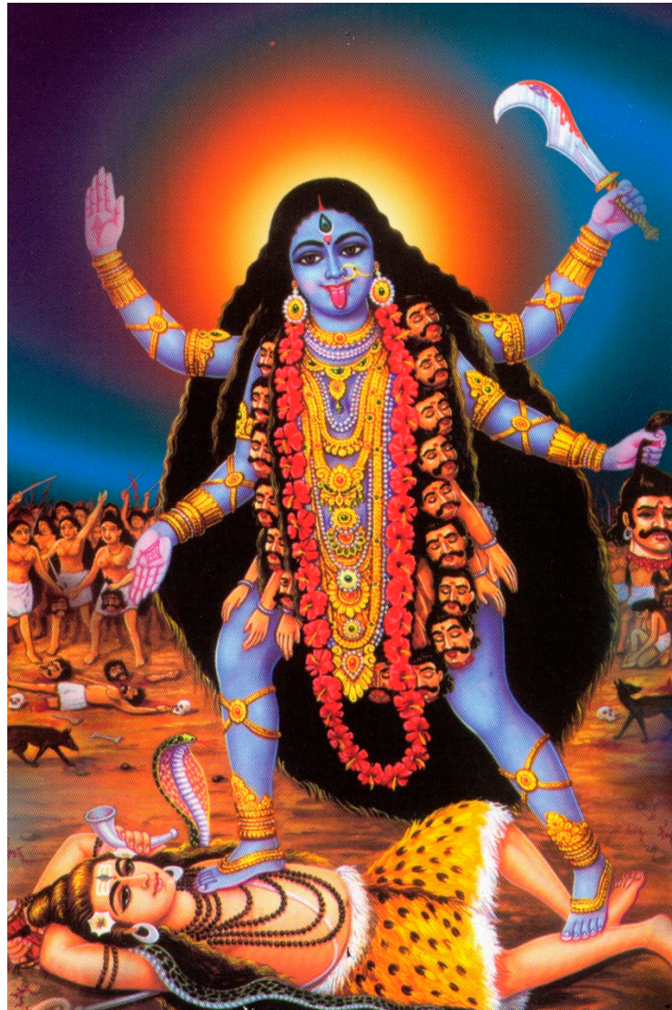
Figure 3. Postcard showing a 'beautified' Kālī.

hair is very black, she wears a red sari and has fangs ( daṁṣṭram ). She has 4 hands like kīḷkāvu' amma (Bhadrakālī of the temple Chottanikkara), she has a gentle/mild ( śāntam ) face. 30