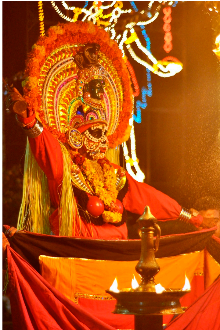
Figure 1. Bhadrakālī in muṭiyēttu '.

translate the extreme variability that is inherent to popular Hindu worship as it is practiced in the innumerable tiny goddess shrines of South India. This article is therefore about Hinduism as it is practiced in the hearts of individual men and women, with all the variety, discrepancies and fuzziness pertaining to the human experience and psyche. The conclusions are therefore entirely limited to this peculiar framework and to the context of those few high-caste Bhadrakālī temples of Central Kerala that treat their goddess with a yearly performance of muṭiyēttu '. My purpose here is also not to theorise about popular goddess worship, but to present some circumscribed and contextualised expressions of it and show how it is translated in the reasoning and words of those who practice it.