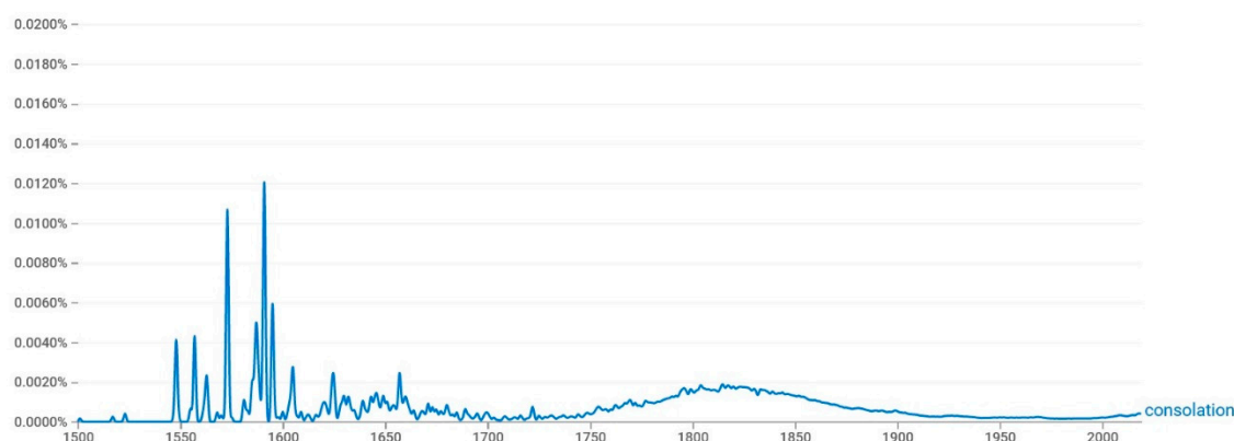
Figure 1. N-gram for “consolation”, English corpus 1500–2019, case-sensitive, no smoothing ( https://books.google.com/ngrams/graph?content=consolation&year_start=1500&year_end=2019&corpus=26&smoothing=0# , last accessed on 20 November 2020).

On the other hand, as opposed to the word ‘consolation’, the phenomenon has continued to matter. Recent work in the field of cultural geography has mined the philosophical and theological literature of consolation (see Jedan et al. 2019), and the medical professions continue to allude to the traditional adage “ La médecine c’est guérir parfois, soulager souvent, consoler toujours ” ([Medicine sometimes cures, often alleviates, always consoles], see, e.g., Keizer 2016).