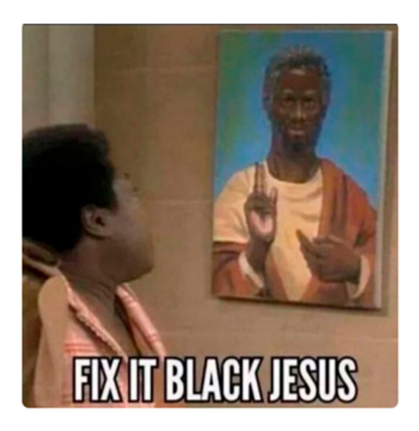
Figure 4. "Fix it Black Jesus" meme.

Though Black Jesus disappeared from Good Times , the painting continues to resonate in contemporary popular culture. In somewhat Biblical fashion, J.J.'s Black Jesus was resurrected in the 2000s as a digital meme. The meme, which is a screen grab from the "Thank You Black Jesus" episode, shows Florida gazing at the Black Jesus painting as it hangs on the wall. In white, bold capital letters at the bottom of the image "FIX IT BLACK JESUS" appears (Figure 4).