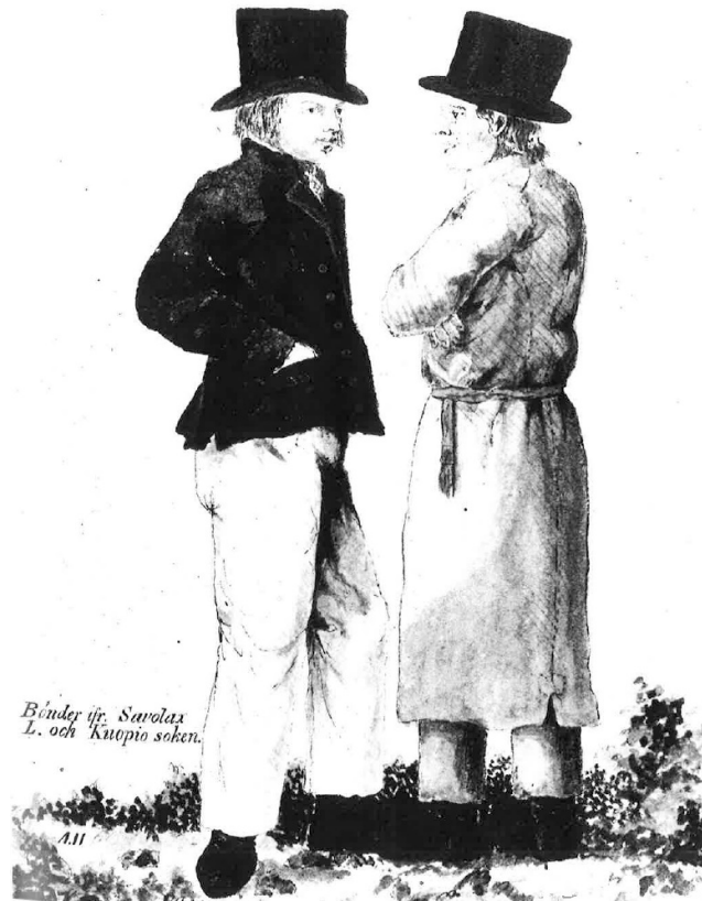
Figure 3. Peasant dress in Savonia in the 1820s. The man on the left wears a jacket much like the körtti jacket. Watercolour by Adolf Hårdh (1807–1855).

One interesting element of the körtti dress is that it was not recommended, let alone enforced, by the leaders of the movement. Although Ruotsalainen and other spiritual leaders preached against vanity and ‘showing off’ ( koreilu ) and condemned certain styles and colours (especially red and multicoloured garments were considered sinful), there was no direct incentive to make people dress in any particular manner (Vilkuna 1928). The dress style seems to have been donned fairly spontaneously, and it spread when members of the movement visited each other in different parts of Finland. At this time, there were ecstatic elements in the movement, and ‘awakening’ often happened as a radical transformation, which came to involve the changing of one’s clothes (Mäntykoski 1973). This sometimes involved dying one’s clothes black, or giving away or even burning old, now undesirable garments (Hakulinen 2008). Instead of throwing old clothes away and making new ones, an awakened individual could also indicate their awakening by attaching long ‘skirts’ to the hem of their jacket (Vilkuna 1928). The early leaders of the movement eventually came to consider this transformation as positive, as is shown in the statement of Jonas Lagus (1798–1857), an Ostrobothnian (north-west Finland) körtti preacher: