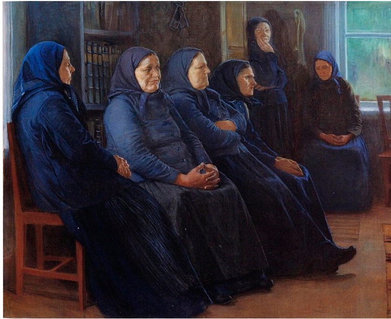
Figure 4. Venny Soldan-Brofeldt (1863–1945): Heränneitä , 1898. Collection: Ateneum (the Finnish National Gallery).

The Awakening festival also gave the members of the movement a chance to meet each other and get a sense of the spread and prominence of the movement. But more importantly, the new movement leaders, most notably Wilhelmi Malmivaara (1854–1922, born Malmberg), believed that the movement would be best placed within the Church rather than as a sect outside of it. The körtti movement became less marginalised, but also more politically involved, albeit in no centralised or generally agreed manner (Huhta 2007). The körtti dress came to symbolise not only belonging to the movement but also characteristics considered desirable by many Fennomans: un-selfishness, piety and modesty. Such characteristics reinforced körtti dress's anti-fashion nature, but also forcefully drew it into the realm of nationalist politics. An elementary part of this kind of framing was the exclusion of ecstatic elements from the movement's religious practice, which typically also led to the exclusion of female leadership that had previously been fairly prominent (Sulkunen 1999). Arguably, this re-enforced the status of the male körtti dress as more profoundly symbolic of the movement than the female dress.