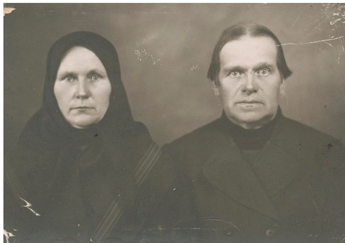
Figure 2. Author's great-grandparents in kórtti dress, c. 1920s/1930s.

Kórttiläisyys today is one of the established revivalist movements within the Evangelical Lutheran Church of Finland—there are altogether five such movements in existence. It is also the most liberal of the movements, both in terms of its membership's values and its leaders' statements (Salomäki 2010). People associated with kórttiläisyys , or those who consider themselves to be a kórtti , are not necessarily formally members of the movement. For example, in 2017, members of Herättäjä-Yhdistys counted at 5196, while the annual summer festival of the movement, Herättäjäjuhlat, attracted an estimated audience of 21,000 (Herättäjä-Yhdistys 2018).