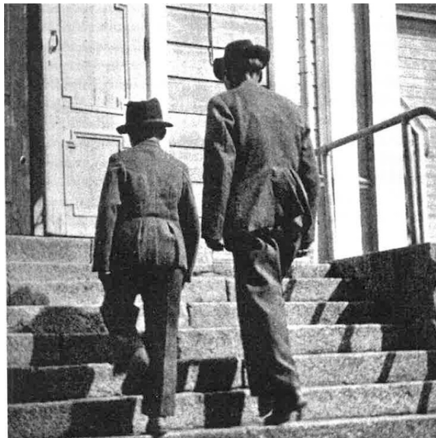
Figure 1. The male körtti dress with distinctive 'skirts', 'körtit'. Photograph: Wilhelmi Malmivaara (1854–1922) in Heränneen kansan arkea ja pyhää , 1952.

(particularly prominent in the male jacket, Figure 1). The word is supposed to derive from the Swedish word 'skört', meaning the skirt of a coat or jacket. This dress detail is still central to the style of körtti dress today and is known as körtit (pl. for körtti ). An alternative explanation for the word refers to a geographical location where körttiläisyys emerged powerfully in its early years: Keyrettijärvi (lake Keyretti). According to this explanation, these people would have been referred to as keyrettiläiset (of Keyretti), and this word would have then been corrupted into körttiläiset (Vilkuna 1928). Both explanations stress that the name was initially a derogative expression but has for a long time now been embraced by the members of the movement. Historically, körttiläisyys has been associated with the Savonia area in eastern Finland and the Ostrobothnia area in western Finland. It spread from these areas to North Karelia and Kainuu in eastern Finland. Today, the movement is spread practically everywhere in Finland.