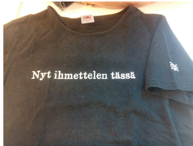
Figure 8. A körtti t-shirt, 'Here I wonder'. The logo of Herättäjä-Yhdistys on the sleeve.

movements within the Church. This is particularly important when a member of the movement wants to take a stance with regard to a political issue that divides the Church, such as gay marriage.