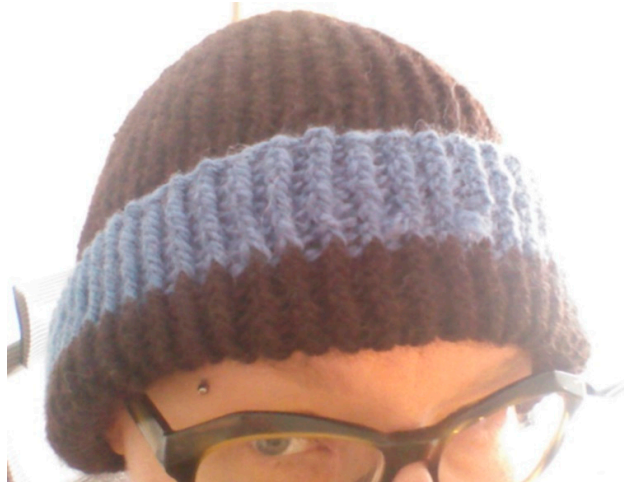
Figure 10. A körttipipa .

A körttipipa is made of black wool, which again refers to traditional colour and material preferences, with a blue stripe (in many different shades) referring to the blue stripe pattern of the körttihiivi . But a different kind of körttipipa was also available, with a red stripe, and referred to as ‘ suruton ’—sorrowless. This pipa was five euros more expensive than the one with a blue stripe, for worldliness ‘should be more costly’. This is an example of the subtleties of körtti humour: mild self-mockery concerning the history of the movement where red was considered unacceptably worldly and sinful and was thereby banned completely. Today’s körtti can wear such a garment in spirit of self-irony and humour, as shown in the following discussion concerning the körttipipa in a Facebook forum (my translation).