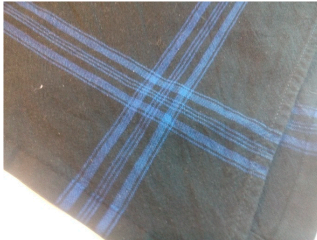
Figure 5. The körtti scarf today.

be one of the most recognisable and traditional signifiers of the movement, and its use has been versatile over the years. For example, a new kind of körtti scarf, a tube scarf, was made for fundraising purposes for the Tampere Herättäjäjuhlat in 2018. The woman behind the idea, Petra Perttula, tells that the fabric for the scarf was produced locally from organic cotton, using a scan of a 'traditional' körtti scarf's pattern. As the required fabric for the tube scarf was a knit, rather than a woven fabric where yarns of both the warp and the weft together form the pattern, scanning was found to be the best way to reproduce the pattern in a new kind of material (Figure 7).