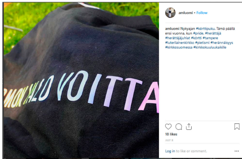
Figure 9. The ‘armon valo voittaa’ t-shirt on Instagram. Hashtags include nykyajan #körttipuku (modern körtti dress), #pride and #kirkkokuuluukaikille (the church belongs to everyone).

So, in many ways, the körtti movement operates between tradition and liberalisation today, using mixed means to communicate its position within the Church. A further means of creating belonging is humour, which both appeals to those who are new to the movement and strengthens the connections between those already within it. It is said that a central liberaliser of the movement in the 1960s and 1970s, Jaakko Elenius (1939–2010), considered humour a positive force: