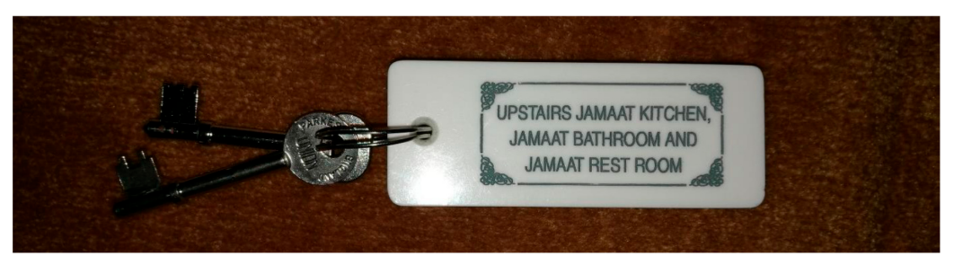
Figure 6. A collection of signs indicating TJ's entrenchment on the landscape of many British mosques.

By contrast, due to sectarian differences, TJ will effectively be barred from operating in the majority of Barelwi (459 mosques; 23.7%) and Salafi-inspired (182; 9.4%) mosques—although this is not always the case. For instance, while conducting fieldwork in Birmingham during the summer of 2014, I spent a night with a visiting TJ group from Medina, Saudi Arabia<sup>11</sup> that was staying in an Arab Salafi mosque. Local activists informed me that that regional TJ authorities, based at the Birmingham Markaz, make a point of sending only Arab TJ groups to mosques of this kind as the usual groups of South Asian ethnic origin are more readily objected to. The cosmopolitan Al-Rahma mosque in Liverpool may be cited as another example. Founded (and still managed) primarily by Muslims of Yemeni and Somali extraction, it can in no way be considered Deobandi, yet it has a long history of allowing TJ groups to visit and stay, permitting them to deliver their talks after the daily prayers. According to Mogra (2014, p. 189), TJ has, in some UK cities, also achieved limited success in accessing mosques of Barelwi and Ahl-e-Hadith orientation as well as those founded by non-South Asian Muslims who "tend to be sympathetic towards TJ, especially for bringing change among some wayward youths". Similarly,