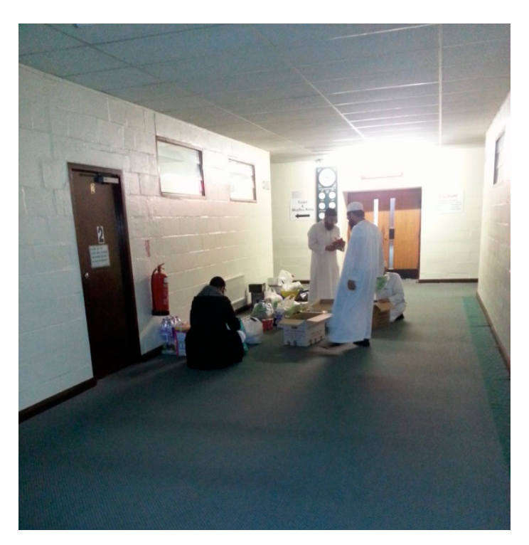
Figure 4. A young British-born TJ group packing their provisions in Dewsbury before departing on an international 40-day TJ excursion in November 2013.