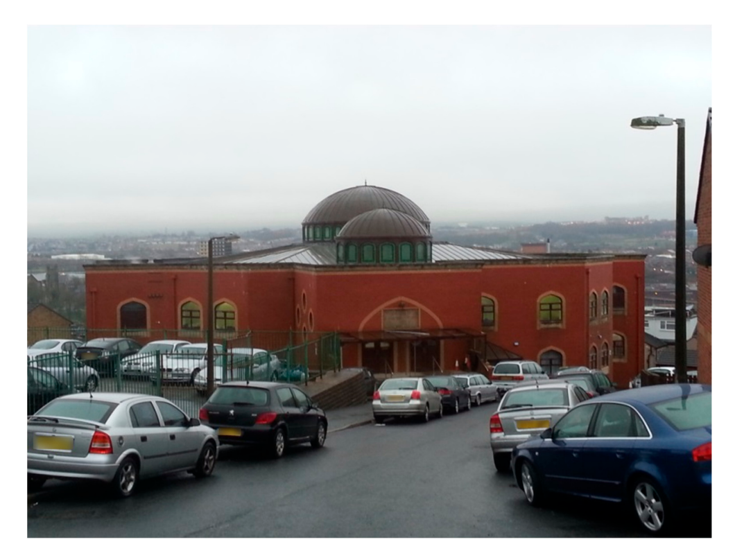
Figure 9. Blackburn Markaz (the number of cars indicating the amount of attendees the weekly programme attracts)

the course of my fieldwork, I attended several Thursday night gatherings at the Blackburn Markaz (see Figure 9), which invariably attracted a largely youthful crowd of up to 1000 Muslims of mainly South Asian origin from mosques across the halqa including Bolton, Preston, Liverpool, Nelson, Lancaster and, of course, Blackburn. Following the lecture, many participants proceed downstairs to the bottom storey of the building where a communal meal is served—usually accompanied by much good-natured camaraderie and jovial chatter as TJ activists from across the halqa (who have often spent time together on extended khuruj outings) catch up with each other and newcomers are gently socialised into the movement. The really dedicated (up to 50–100) stay the night each week, only returning home, or going straight from the markaz to their workplaces, after offering the Friday dawn prayer ( fajr ) in congregation. Given that the night preceding Friday is regarded as being especially blessed, one of the objectives of the overnight stay is to facilitate the rising for the pre-dawn optional tahajjud prayer—a particularly emphasised component of TJ's devotional cosmology.