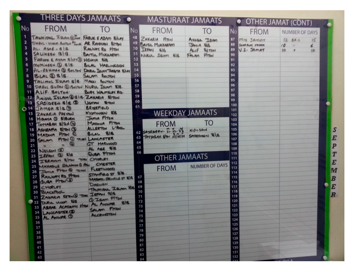
Figure 10. The oversized noticeboard template in Blackburn Markaz, freshly filled out on a Tuesday evening, that displays the "routes" of all the jama'ats operating in the Lancashire halqa on a typical week. Source: author's photo (October 2013).

the visiting TJ leaders from the different mosques across the halqa will make their way to the noticeboard to take note of the "routes" given to each of their expected jama'ats . This information will then be relayed to the remainder of the TJ activists in their own mosque, usually at the daily mashwera meeting held after the Fajr prayer the next (Wednesday) morning. Younger activists then often disseminate the destination of that weekend's jama'at to their friends or other potential recruits via WhatsApp or text message (see Figure 11).