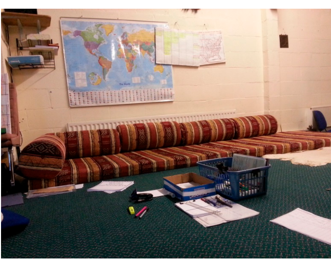
Figure 13. It is noteworthy that national and international maps adorn the walls of the Dewsbury headquarters, although critics maintain that it has failed to engage adequately with the wider society on its doorstep (Lockwood 2012).