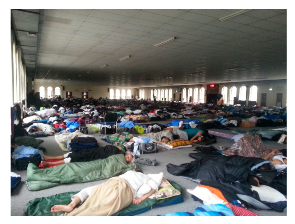
Figure 5. The upper floor of the large TJ complex in Dewsbury strewn, in Ziauddin Sardar's (2004, p. 2) words, with a plethora of "contended logs" taking their sunna siesta nap during the peak summer holiday period in 2014.