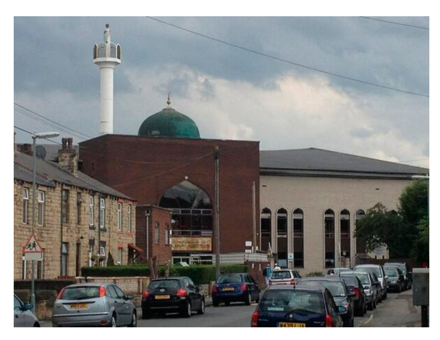
Figure 1. The Tablighi Jama'at (TJ) headquarters in Dewsbury, West Yorkshire.