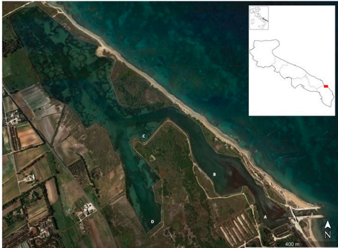
Figure 1. Map of sampling sites (A, B, C, D) in the Acquatina di Frigole lagoon (Apulia region, southeast Italy).

Sampling in the “Aquatina di Frigole” lagoon involved four strategic sites (named A, B, C and D) arranged along the salinity gradient. Three experiments were carried out for each site, corresponding to three sampling replicates for site A: A1, A2, A3, site B: B1, B2, B3 and site C: C1, C2, C3; for site D: D1, D2, D3. Their geo-locations are shown in Figure 1.