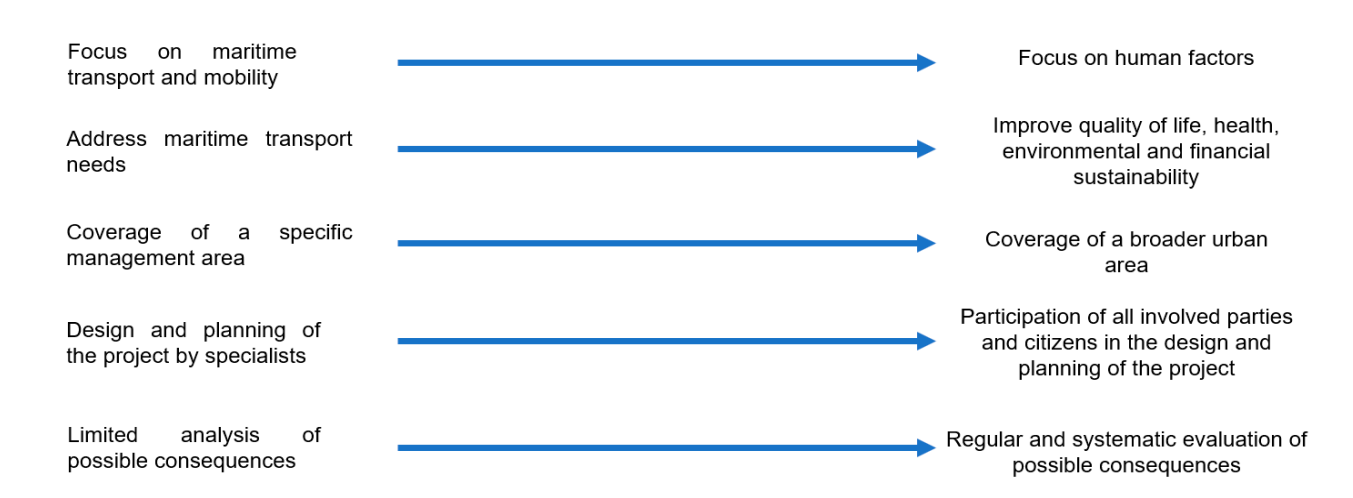
Figure 1. Areas of comparison between the traditional and proposed planning.

Figure 2 details the exact step-by-step implementation and the precise structure of the tasks recommended by word-for-word guidelines. The challenge of implementing an SPDP is to adapt it to a given local context, taking into account the specific characteristics of each separate port, while maintaining ambitious goals and avoiding inappropriate compromises. The plan presented here is meant to describe these stages in depth. However, because various activities must be conducted in tandem, it can be challenging to establish which processes and activities should come first during the plan practice stage.