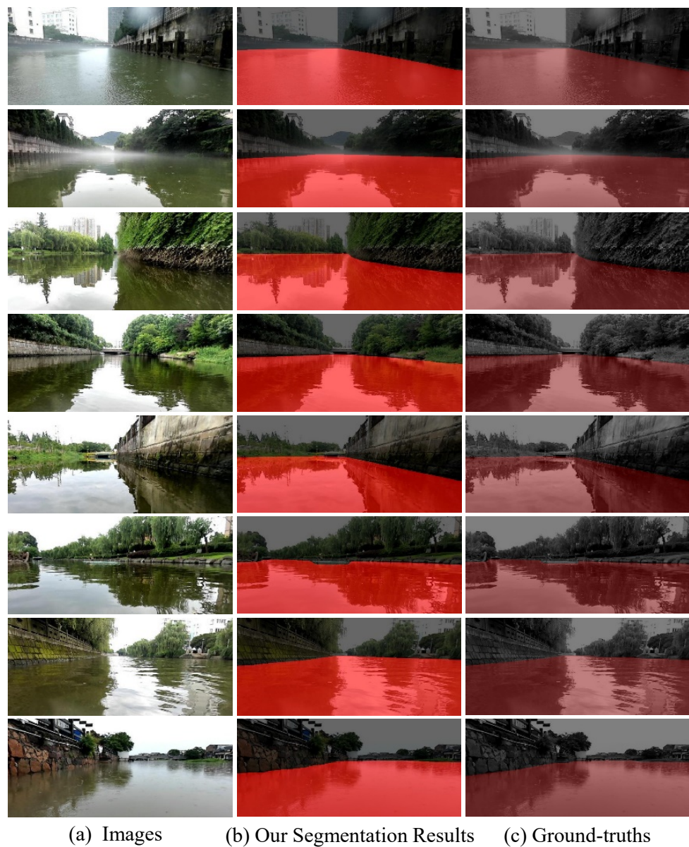
Figure S2. More qualitative results of our methods.