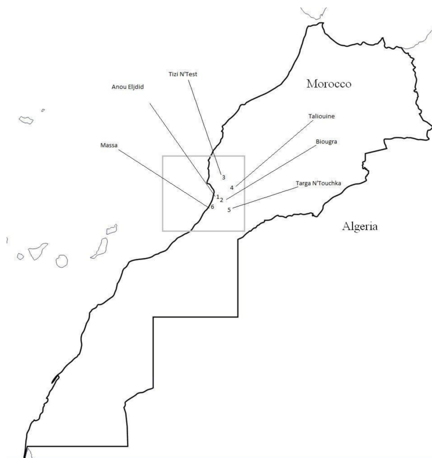
Figure 2. Approximate locations of the six villages in the Souss-Massa region of Morocco that were assessed for vegetable landrace use. The latitude ( ^{\circ} N) and longitude ( ^{\circ} W) of each village: Anou eljdid (30.162045, -9.252229 ); Biougra (30.220658, -9.372859 ); Massa (30.004087, -9.636919 ); Taliouine (30.531266, -7.923879 ); Targa N' Touchka (29.885070, -9.199597 ); and Tizi N' Test (30.868223, -8.379130 ).

The data collected for the vegetable landrace assessment conducted in the Souss-Massa region of Morocco were compiled and placed into tabular form. The specific questions asked of famers in each village related to vegetable crop landraces were collated with overall means also determined for this data. Additional information collected regarding the vegetable crop landraces currently grown, as well as those lost over the last 30 years is also presented.