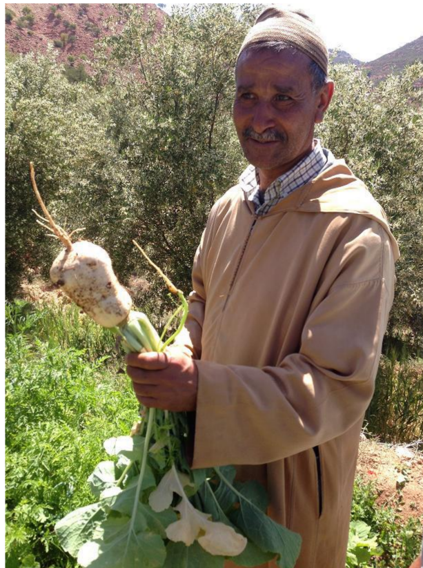
Figure 3. A Moroccan small landholder farmer near the village of Tizi N' Test (in the Anti-Atlas mountain region of southwestern Morocco) showing off his prized turnip. This turnip is a specimen of the landrace that was collected at this location.