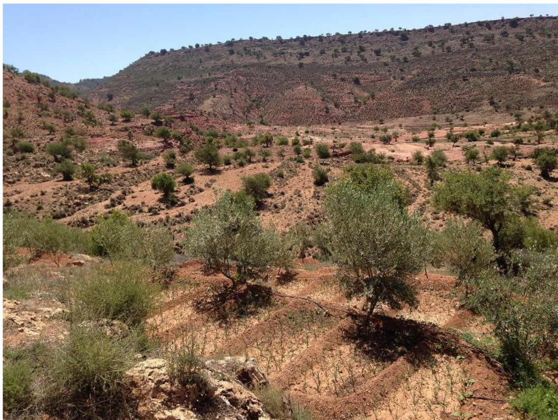
Figure 1. Landscape of a typical, small subsistence farm in Anti-Atlas mountain region of Southwestern Morocco. Notice the onions growing in the basin irrigation beds underneath the olive trees.

This landrace assessment was conducted in the Souss-Massa region of Morocco. This area includes Agadir, a city of approximately 750,000 people, which has significant Berber influence, with an arid to semi-arid climate. Temperatures range from highs of ~40 to 45 °C in July and August to lows of ~2 to 4 °C in January. There is minimal rainfall with only 150 to 250 mm received annually, with little occurring from May to September, which is typically a very dry time of the year. More than 90% of the farmers in this region are small landholders, especially those in remote areas of the Anti-Atlas Mountains, and generally have only between 5 and 10 ha. This environment is oftentimes dry and hot which provides significant stress for plant growth and survival. The landscape of a typical, small subsistence farm in the Anti-Atlas mountains of Southwestern Morocco (near the village of Tizi N' Test) is provided in Figure 1.