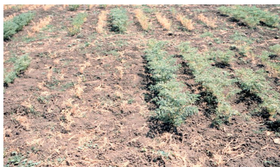
Figure 2. Chickpeas affected by Fusarium wilt in Beja-Tunisia.

The wilt can be observed in susceptible genotypes within 25 days after sowing in the field (designated “early wilt”) [23,24]. However, symptoms are usually more visible in the early stages of flowering, 6 to 8 weeks after sowing and can also appear up to podding stage (“late wilt”). Late wilted plants exhibit drooping of the petioles, rachis and leaflets, followed by yellowing and necrosis of foliage [23]. Early wilting causes more loss than late wilting. Nevertheless, seeds from late-wilted plants are lighter, rougher and duller than those from healthy plants [25,26].