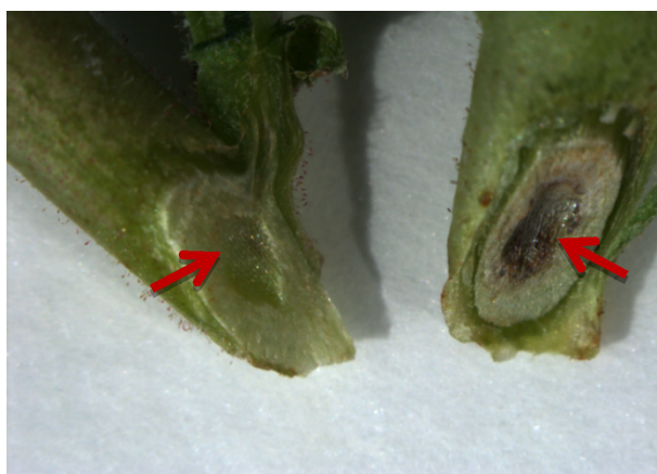
Figure 3. Stem discoloration of a chickpea plant artificially infected by Foc. Healthy plant on the left.

The fungus remains dormant as chlamydospores in plant debris until stimulated to germinate, once carbohydrates are released from decaying plant tissue or from roots [31]. The stimulus for germination may be host or nonhost plant roots, or contact with pieces of fresh (not colonized) plant debris [33]. After the chlamydospores germinate, conidia and new chlamydospores may be formed as well as hyphae. Following germination, a thallus is produced from which conidia form in 6–8 h, and chlamydospores in 2–3 days if conditions are favorable. Invasion of the roots is followed by the penetration of the epidermal cells of the host or the non-host [34] and the development of a systemic vascular disease in host plants [35]. Penetration occurs either through wounds or directly [33]. The most common sites of direct penetration are located at or near the root tip of both taproots and lateral roots [36]. Penetration is controlled by a combination of different factors that include fungal compounds, plant surface structures, activators or inhibitors of fungal spore germination, and germ tube formation [37]. During colonization, the mycelium advances intracellularly through the root cortex until it reaches the xylem vessels and enters them through the pits. The fungus then remains exclusively within the xylem vessels (Figure 3), using them to colonize the host [38].