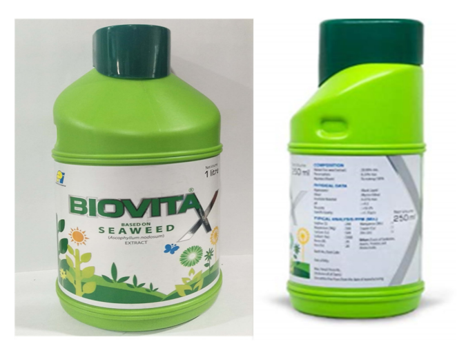
Figure 2. Example of biostimulant (AnE) produced by PI Industries Ltd., Sagar, Madhya Pradesh, India.

In another study, Danesh et al. [71] observed that Ascophyllum seaweed extract affected the growth parameters of tropical crops. When treated with AnE, tomato plants ( Lycopersicum esculentum Mill.) showed an increase in plant height and root and shoot biomass, with a significant enhancement in numerous minerals and nutrients in the shoots and fruits of tomato plants at a concentration of 0.5%. The mineral nutrients of the fruits were significantly increased: nitrogen by 81%, phosphorus by 8%, potassium by 50%, calcium by 57%, iron by 25%, and zinc by 33%, and the intensity of sodium was reduced by 2% [71]. The AnE enhanced the yield and quality of the tomato fruit, as betaines in the extract enhanced the chlorophyll pigment in the tomato leaves and decreased its deterioration rate [72,73]. The seaweed-treated tomato plants exhibited improved concentrations of minerals in their shoots and a significant increase in fruit quality and other attributes, including size, color, total soluble solids, ascorbic acid, and minerals under tropical growing conditions [73]. Mohamed et al. [74] observed that the foliar application of AnE in the chickpea cultivar Giza 195 improved the seed quality and amino acid and mineral contents in the seeds and induced favorable changes in the protein profile.