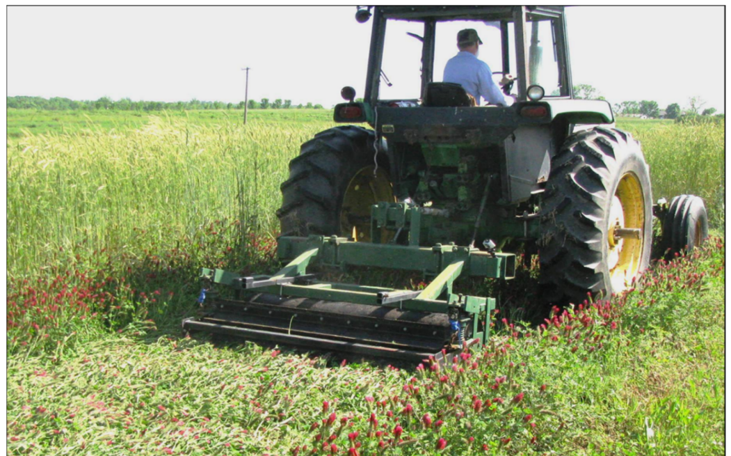
Figure 3. Two-stage roller-crimper (1.8 m wide) (Multistage crop roller. Kornecki, 2011, US patent #7987917 B1) in crimson clover [23].

The effectiveness of mechanical termination using roller-crimpers and flail mowers was compared with the untreated (non-rolled) cover crop. However, the control treatment with respect to cantaloupe yield was the flail mowing method. Transplanting cantaloupe into flail-mowed residue is a more practical operation for a no-till system. In contrast, in Alabama, planting the cantaloupe seedlings into an untreated, non-rolled cover crop is impractical.