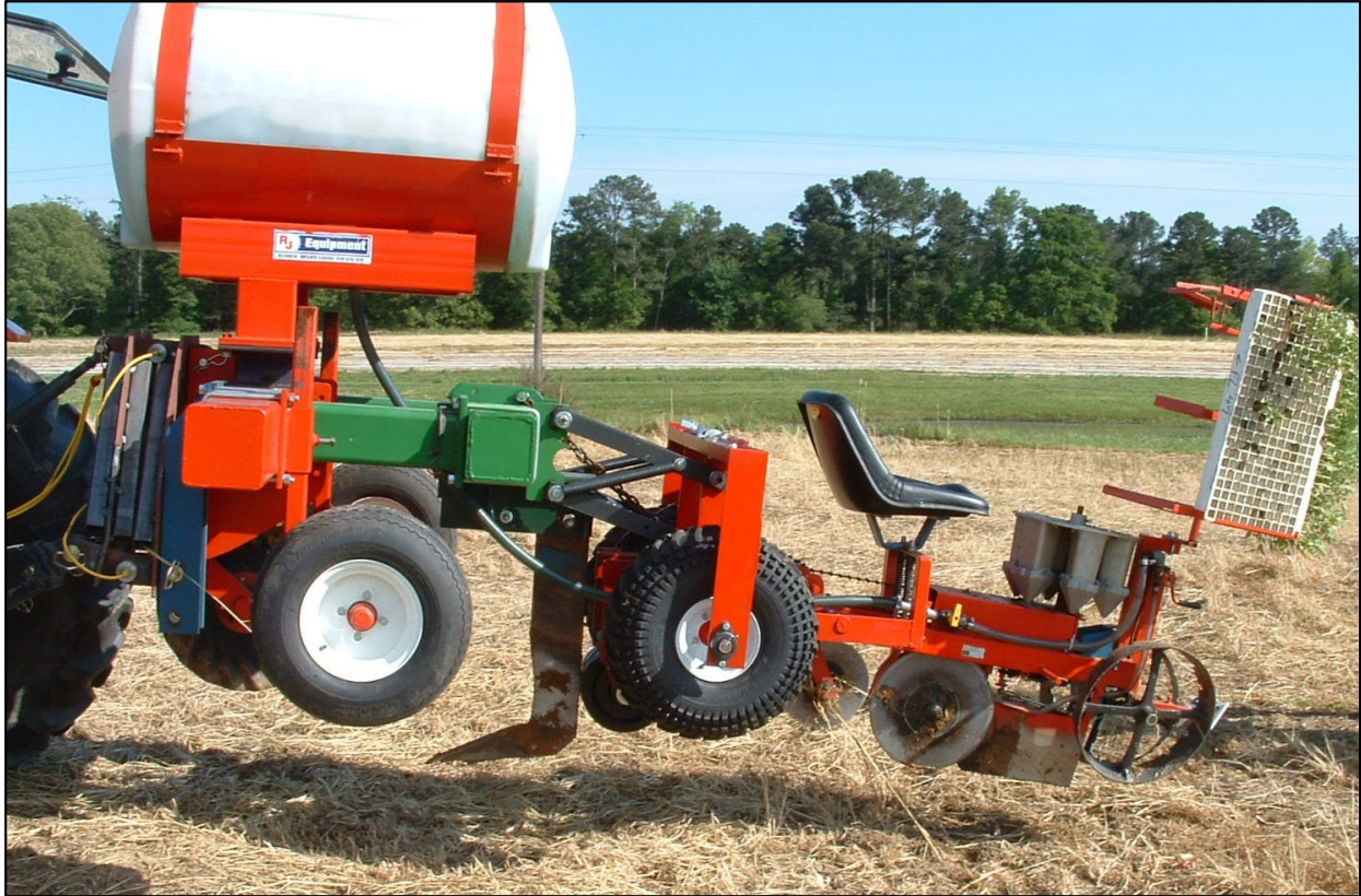
Figure 7. Modified RJ transplanter with added subsoiler shank to alleviate soil compaction while planting cantaloupe seedlings.

Three weeks after cover crop termination, the cantaloupe seedlings (cultivar Athena) were transplanted directly into cover crop residue utilizing a modified RJ one-row no-till vegetable transplanter (RJ Equipment, Blenheim, ON, Canada; Figure 7).