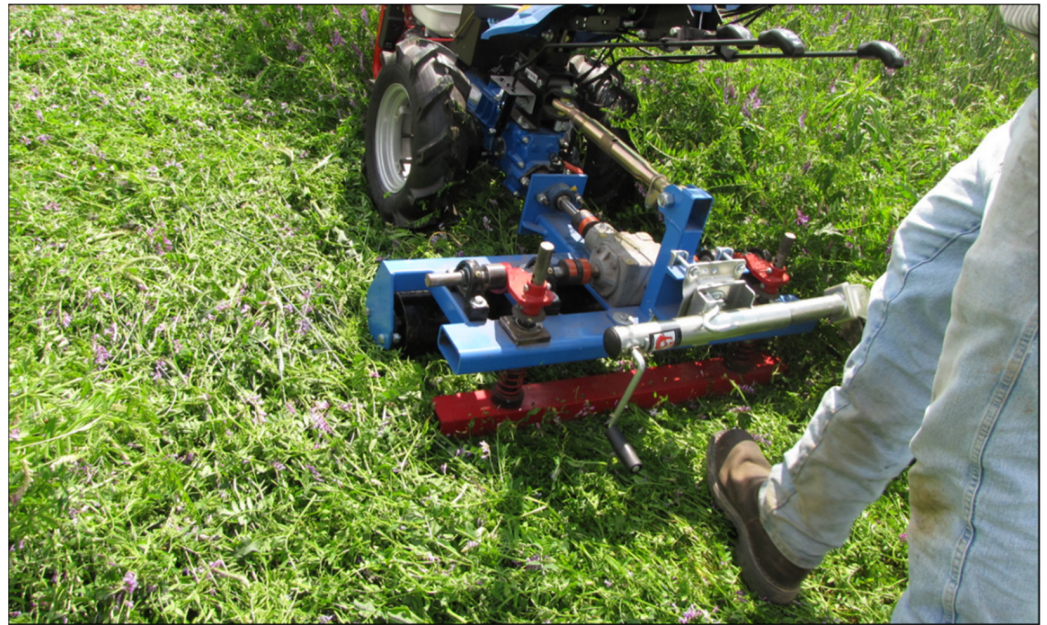
Figure 4. Powered roller-crimper (Kornecki, 2012, US patent # 8176991 B1) in hairy vetch. [24]; US patent #7987917 B1.