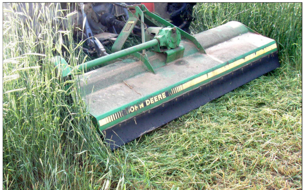
Figure 5. Flail mower (John Deere, Moline, Ill.) in cereal rye.

Cover crop termination rate data using the previously mentioned equipment were collected and evaluated 7, 14, and 21 days after treatment application, denoted as days after treatment (DAT), and compared to the control (non-rolled cover crops). During this period, volumetric soil moisture content (VMC) was also measured. The results were compared to the untreated cover crops. Termination rates were estimated using a handheld light sensor-based chlorophyll meter SPAD 502 (Konica-Minolta, Ramsey, NJ, USA). This portable sensor is capable of instantly measuring the chlorophyll content or “greenness” of plants. The SPAD 502 quantifies slight changes or trends in plant health long before they are visible to the human eye and provides a means of non-invasive measurement. The meter is clamped over leafy tissue and an indexed chlorophyll content reading (usually from 0 to 50.00) is recorded in less than 2 s. The data logging version of the SPAD 502 (item 2900DL) allowed