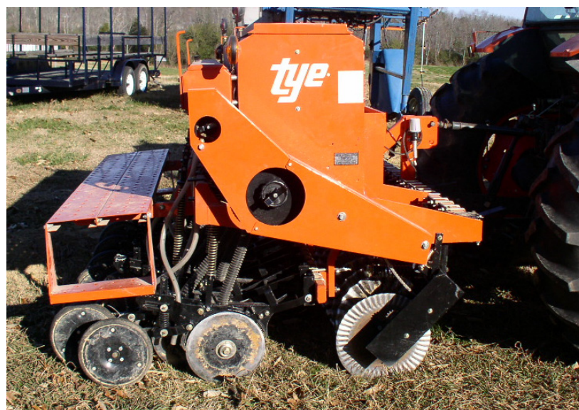
Figure 2. TYE Grain Drill Model No.: 124-530X, AGCO, Duluth, GA, USA.