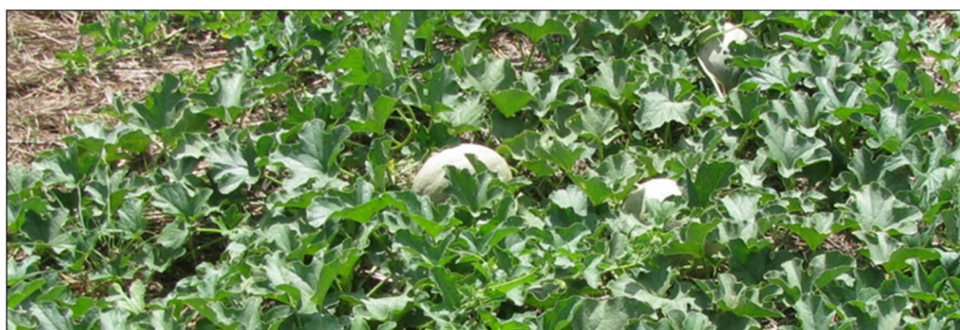
Figure 8. Cantaloupe fruits (Var: Athena) on cereal rye cover crop residue in 2010.

For the 2010 growing season, crimson clover had the lowest yield with 49,946 kg ha -1 compared to cereal rye (68,019 kg ha -1 , depicted in Figure 8) and hairy vetch (61,875 kg ha -1 ). Possible reasons for the reduced yield for the crimson clover may be due to the low termination rates (<90% at 21 DAT) noticed for the crop throughout the different termination methods. This could lead to competition for water and nutrients between the cash crop and cover crop. For fruit weight, a significant ( p -value < 0.0001) difference between the years existed, with 2010 having an average fruit weight of 2.31 kg compared to a lower weight of 2.0 kg for 2012. Over the two growing seasons, significant differences in fruit weight occurred among rolling treatments ( p -value = 0.0857), with a higher fruit weight for the powered roller, shown in Table 14 (2.25 kg), compared to a lower weight for the two-stage roller (2.10 kg) and for the flail-mowed residue (2.12 kg), without differences between these treatments (LSD = 0.12 kg). Moreover, over two growing seasons, fruit weight with respect to cover crop type indicated no significant difference in fruit weight among covers ( p -value = 0.1736), with 2.20 kg, 2.19 kg, and 2.08 kg generated for hairy vetch, cereal rye, and crimson clover, respectively.