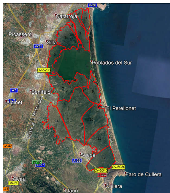
Figure 1. Image of rice crop area in the P.N. Albufera de València and the actuation zones into which it was divided (Image source: Google Earth. Modified by J.M. Giner).

The rice-producing area was divided into 13 zones. The plots are all accessed by paths which are parallel to the ditches, making transverse movements difficult. In addition, seven possible storage points were identified within the production area. These areas of harvesting and storage points were used as a reference for calculating the distances to be covered during transportation in the production area. The delimitation of these zones was carried out by direct observation of the transport routes and intermediate obstacles in Google Earth (Figure 1).