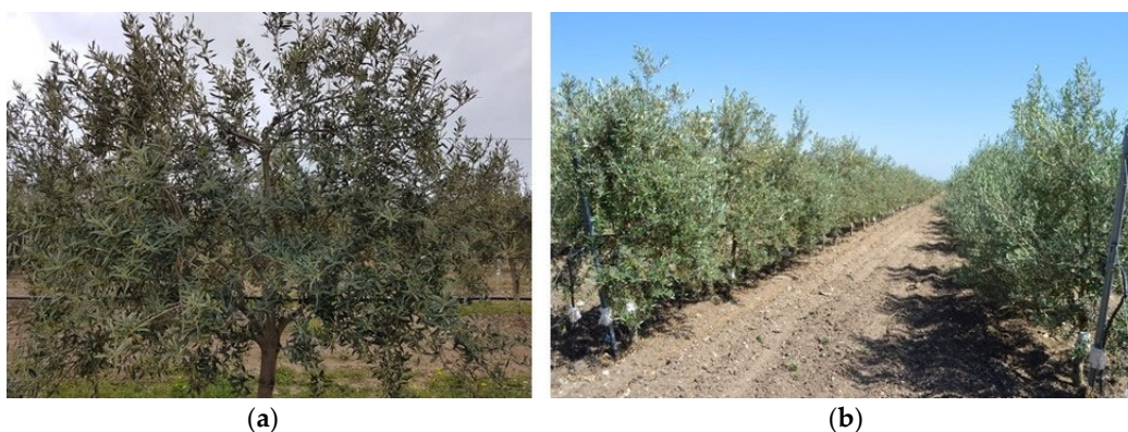
Figure 2. Example of high-density “pedestrian olive orchard” in southern Sicily: (a) “Calatina” olive tree trained to “free palmette”; (b) continuous walls of “Calatina” trees trained to “free palmette”.