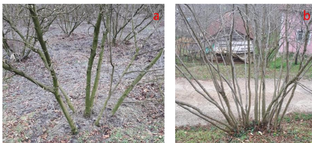
Figure 1. Ocak system with low (a) and high (b) branch density.

cultivation of hazelnuts, and ocaks comprise old and plenty of branches. Ocak is a bush-like growing system that consists of no main trunk as a tree. Branches are all considered as a tree without connecting a trunk. Even though this system is suggested for flatlands by many researchers [4,15,16], cultivation with this system is being used in all growing areas of Turkey. Pruning application is generally performed as removing excessively old branches or newborn suckers and pruning on branches is not performed. In recent years, the studies about the ocak system [17–19] and its effects on yield and quality increased significantly. However, these studies are still insufficient, and there need to be a lot more studies describing the ocak system and its effects. Clarifying the effects of branch numbers in ocak is one of the most crucial issues among all studies. This study was carried out to determine the effect of the number of branches in ocaks on fruit quality parameters in ‘Palaz’ and ‘Tombul’ cultivars.