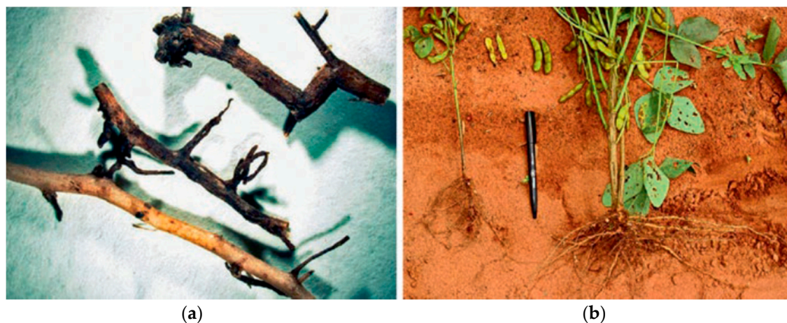
Figure 2. (a) Necrotic soybean roots infected with lesion nematodes, and (b) a stunted plant with a reduced and necrotic root system (green circle) compared to a noninfected plant (Photos: (a) Suria Bekker and (b) Driekie Fourie, North-West University, Potchefstroom, South Africa).