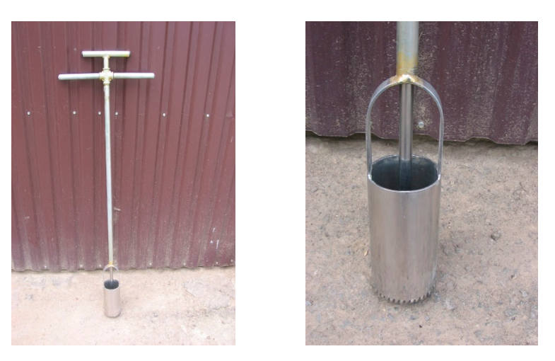
Figure 1. Soil sampling tube.