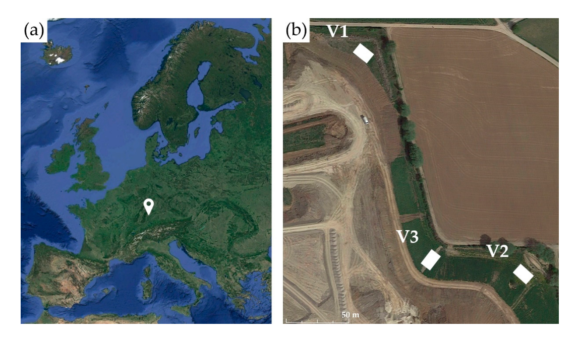
Figure 1. Location of the stone quarry ( a ), and arrangement of the demonstration plots V1–V3 at the stone quarry ( b ).

which the quarry company is mining for gravel. An older part of the mine is currently renaturalized and integrated into the typical landscape, consisting of 47% agricultural fields and 34% forest, following the regulations of the federal state Baden-Württemberg. In this area, two demonstration plots (V1, 48°39′57.6″ N 8°55′53.3″ E, and V2, 48°39′51.8″ N 8°55′59.7″ E) (Figure 1b) are available for this experiment. In addition, another area located on a slope (V3, 48°39′52.3″ N 8°55′55.8″ E) (Figure 1b) was selected to account for topographical peculiarities of the given site, but this area was not large enough to establish another demonstration plot. The integration of this field test into the given renaturation plan required official authorization by five regional government departments.