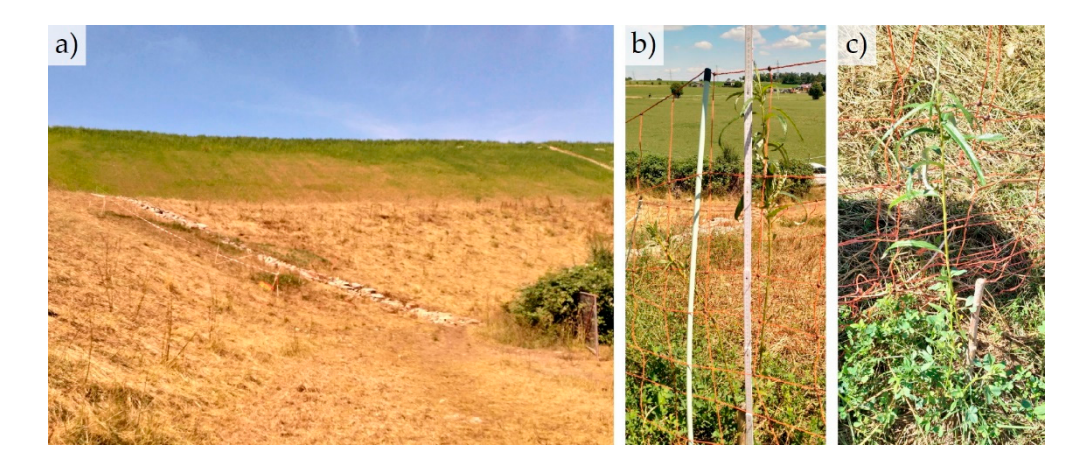
Figure 9. Location of plot V3 ( a ) and impressions of willow plantlets on V3 ( b , c ). The stone gutter marks the middle of the area. Willows were planted crescent-shaped, indicated by the green vegetation left over from the last mowing process. The photographs were taken on 18 July 2020.

Figure 8. View of the demonstration plot V2 with electric fence. Sheep were grazing outside of the plot a few days before this photograph was taken (18 July 2020).