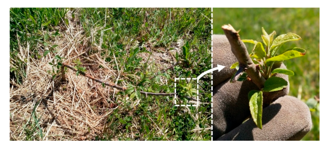
Figure 6. Well-established blackthorn plantlet within demonstration plot V1 on 19 May 2020.

Table 6. Detailed overview of preliminary status of the trees per plot (V1, V2) and row (good = in healthy condition, pending = condition currently unclear, dead = no signs of vitality to be seen, not planted yet = in November 2019, there were no or not enough tree seedlings available).