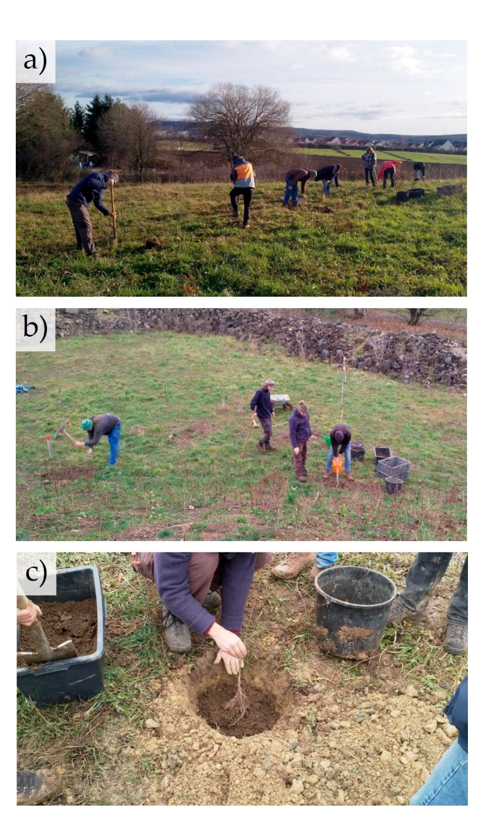
Figure 2. Impressions from the planting event in December 2019. The planting holes were dug ( a ) and irrigated ( b ) before the seedlings (which were delivered as usual without soil from the nursery) were positioned in the holes and covered with loosened soil ( c ).

The trees were checked at regular intervals and kept free of grasses approximately 50 cm around the stems. The water supply was ensured by the installation of a solar-powered water storage system