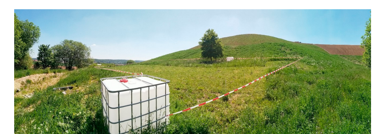
Figure 7. Preparations for the installation of the electric fence at site V2 on 19 May 2020.