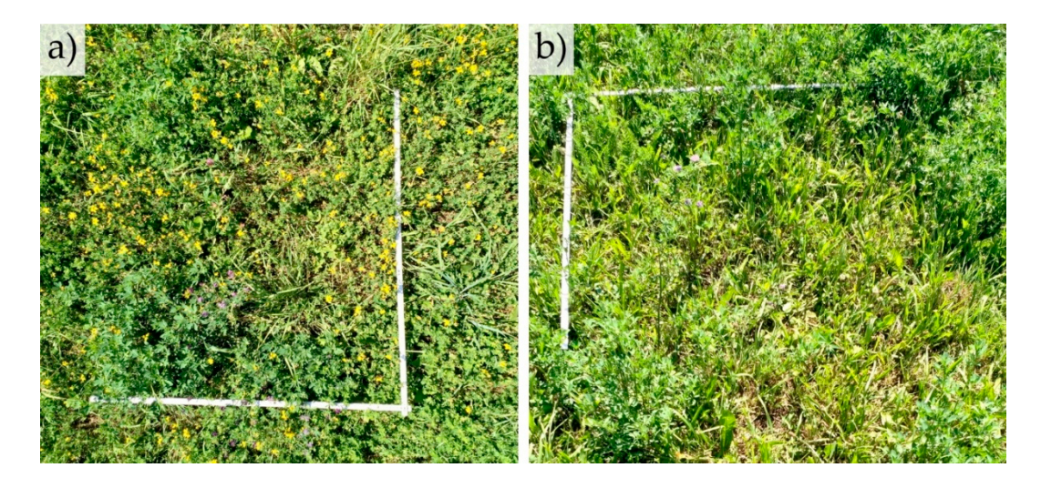
Figure 4. Impressions of the grassland communities on demonstration plots V1 (a) and V2 (b), 18 July 2020.

Table 4. Cover of plant species (%) within the sample areas (4 \text{ m}^2) of the grassland communities of plot V1 and V2 on 18 July 2020.