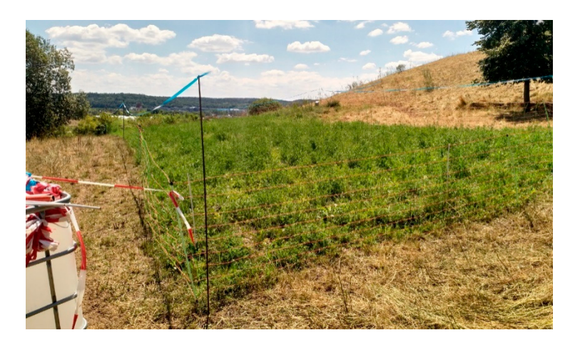
Figure 8. View of the demonstration plot V2 with electric fence. Sheep were grazing outside of the plot a few days before this photograph was taken (18 July 2020).