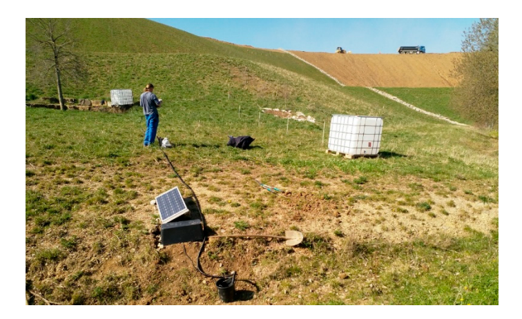
Figure 3. Installation of a solar-powered water pump at plot V2 at the quarry in Ehningen, Southwest Germany during lock-down in April 2020.

for irrigating the plants during establishment (Figure 3). Rainwater draining off near the surface is temporarily stored in two 1000-L intermediate bulk containers.