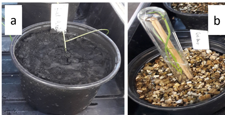
Figure 1. General overview of the experimental unity and the preparation for herbicide application. (a) A pot ( \varnothing = 10 cm) with vermiculite and an emerging L. multiflorum plant after charcoal had been added on the top of the vermiculite preventing the herbicide from leaching to the growth substrate and the roots, to account only for leaf absorption. (b) A pot ( \varnothing = 10 cm) with vermiculite and an emerging L. multiflorum plant covered with a glass tube supported by a wood stick ready to be sprayed, to account only for soil absorption of the herbicide.

At the day of spraying, a wooden stick was placed in the pots with substrate-only application to stabilize a glass test tube covering all green parts of the plant (Figure 1b). The substrate + foliar pots were not modified before application. Flufenacet and prosulfocarb were applied in a spraying cabin, which was calibrated before use. Two different dosages of each herbicide were applied, the recommended dose ( 1.0 \times \text{dose} ) and half the recommended dose ( 0.5 \times \text{dose} ). The applied active ingredient were for flufenacet 250 \text{ g ai ha}^{-1} ( 1.0 \times \text{dose} ) and 125 \text{ g ai ha}^{-1} ( 0.5 \times \text{dose} ), and for prosulfocarb 4200 \text{ g ai ha}^{-1} ( 1.0 \times \text{dose} ) and 2100 \text{ g ai ha}^{-1} ( 0.5 \times \text{dose} ). We used a two-nozzle sprayer delivering 135.1 \text{ L} of spraying solution \text{ha}^{-1} with a pressure of 400 \text{ kPa} bars and a speed of 7.5 \text{ km h}^{-1} . Two HARDI Low Drift Nozzles (Yellow)—ISO LD-02-110 (Hardi, Nørre Alslev, Denmark) were used delivering a medium spray-droplet pattern ensuring that leaves and soil was covered. The pots were moved to the greenhouse 30 min after spraying. The pots were irrigated daily by flooding the table with water containing fertilizer avoiding drought and nutrition stress. Pots were subirrigated to avoid herbicide being sprayed on the charcoal and leaching down in the soil, which might happen if they were irrigated from above.