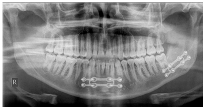
Figure 2. Double mandibular fracture treated with two Grid-Plates (Modus Trauma 2.0, Medartis).

In addition, 107 patients received intermaxillary fixation to treat condylar fractures, and seven patients were treated with a head-chin bandage. Postoperative antibiotic therapy was prescribed for 320 patients (95.2%). Figure 2 shows the post-operative panoramic radiograph of a double mandibular fracture treated with 3D miniplates. In 314 patients, the plate was removed after four months, whereas for six patients, the second surgical procedure occurred in two months. The mean operation time (standard deviation) was 80 (60.72) min.