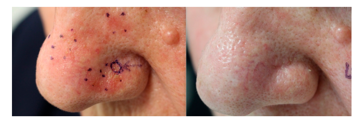
Figure 1. Complete clinical response to photodynamic therapy (PDT), as clearance of actinic keratoses in the nasal area of a patient six weeks after treatment.

As expected, PDT induced a significant reduction in the mean number of AKs per patient, from 7.80 (SD 2.79) to 2.8 (SD 1.61) (p = 0.005) (Figure 1). Overall clinical response was complete in 16 patients (64%) and partial in 9 (36%); there were no cases without response.