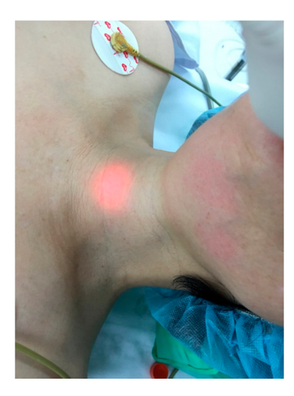
Figure 1. Transillumination of the suprasternal soft tissues by the lighted stylet.

tube was inserted through the vocal cords with a stylet and the stylet was removed when the tip of the endotracheal tube was thought to pass the larynx. A lighted stylet was used in Group L and was removed after confirming transillumination of the soft tissue above the suprasternal notch (Figure 1). Successful intubation was defined as the correct placement of the endotracheal tube in the trachea, as confirmed by end-tidal CO_2 capnometry, bilateral lung auscultation, and misting of the endotracheal tube. If the third attempt failed, that patient was considered a "fail" and an alternative technique was used for intubation by the duty anesthesiologist, such as video laryngoscopy or fiberoptic intubation.