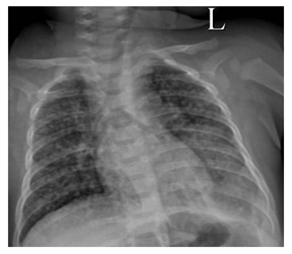
Figure 1. Chest radiograph on admission demonstrating bilateral nodular infiltrates (together with left lower lobe consolidation), suggestive of disseminated (miliary) tuberculosis.

highly suspicious of disseminated (miliary) tuberculosis (TB), with opacification of the left lower lobe (Figure 1). A cranial ultrasound showed dilated lateral and third ventricles, consistent with hydrocephalus. The cerebrospinal fluid (CSF) was clear, with pleocytosis (207 cells/mm<sup>3</sup>, 75.0% neutrophils, 25.0% lymphocytes), increased protein (8.3 g/L), reduced glucose (0.7 mmol/L), and a positive Pandy test. Blood and CSF cultures were negative, but a Gene Xpert<sup>®</sup> test performed on CSF was positive for Mycobacterium tuberculosis complex, without any rpoB mutations suggestive of rifampicin resistance. Gastric aspirate analysis for tuberculosis (TB) (including Gene Xpert<sup>®</sup> and smear for acid-fast bacilli) was negative; no mycobacterial culture facilities were available. A rapid human immunodeficiency virus (HIV) test (HIV Combi PT, Roche, Mannheim, Germany) was negative. A computed tomography (CT) scan of the brain confirmed hydrocephalus together with basal meningeal enhancement. No visible infarcts were noted.