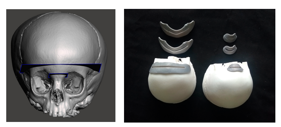
Figure 2. On the left, the planned osteotomies for the fronto-orbital bandeau of the Fronto Orbital Remodeling (FOR) on the right, the 3D printed cutting guides with calibrated grooves for both osteotomies.

To evaluate the AR guidance accuracy, CAD/CAM templates were designed using MeshMixer 3.5 software (Autodesk Inc., Mill Valley, CA, USA), and these were to be positioned on the surface of the phantom model, as cutting guides, in correspondence with the planned FOR osteotomies. For the AR-guided task, we selected the nasal and the frontal osteotomies that are part of the fronto orbital remodeling (Figure 2, left).