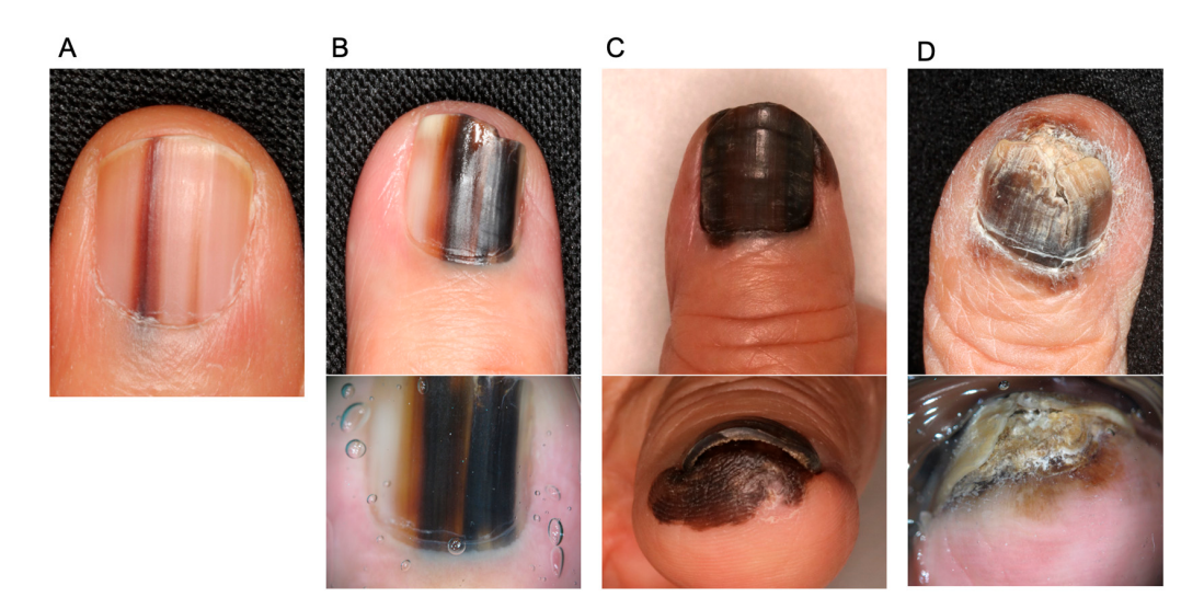
Figure 1. Representative images of nail apparatus melanoma and dermoscopy (lower images). ( A ): An early lesion of nail apparatus melanoma. Both of the streaks taper toward the distal end of the nail. ( B ): An invasive nail apparatus melanoma. The color is highly irregular. ( C ): An invasive nail apparatus melanoma. The color is highly irregular. ( C ): An invasive nail apparatus melanoma. The color is highly irregular. ( C ): An invasive nail ( D ): An invasive toenail apparatus melanoma. Hutchinson's sign and nail destruction are evident.

NAM at an early stage generally presents longitudinal melanonychia, which is irregular in width and color. In contrast, benign melanocytic nevus, which is a major differential diagnosis, is characterized by brown or black pigmented streaks extending from the proximal nail fold to the distal end of the nail plate. Typical melanocytic nevus is regular in color with a stable width throughout the nail. Extended pigmentation to the surrounding skin (Hutchinson's sign), widening of melanonychia toward the proximal nail, destruction of the nail plate, bleeding, localization to one nail, and rapid enlargement and darkening during adulthood are all signs suggestive of NAM. However, information beyond the clinical appearance, such as age, history, and involvement of other nails, is important and should be considered when deciding on the appropriate treatment [9,22–26]. Representative images of NAMs are shown in Figure 1.