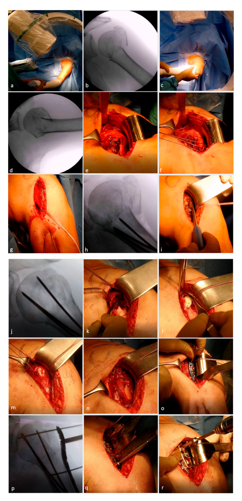
Figure 1. Cont.