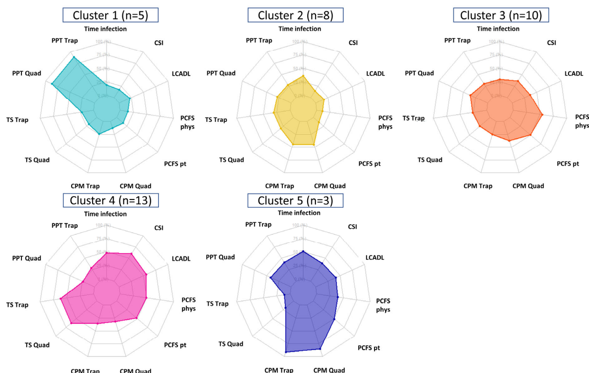
Figure 2. K-means clustering algorithm with five distinct clusters. CPM was coded negatively in case there was a malfunctioning of the descending nociceptive inhibitory pathways and positive in case of functioning of these pathways. For temporal summation, higher scores indicate more nociceptive facilitation. Abbreviations. CPM: conditioned pain modulation, CSI: central sensitization inventory, LCADL: London chest activity of daily living, PCFS: post-COVID-19 functional status scale, phys: physician, PPT: pressure pain threshold, pt: patient, Quad: quadriceps, Trap: trapezius, and TS: temporal summation.

Cluster 4 represented 33.3% of the patients and could be interpreted as a typical chronic pain patient showing a relatively high CSI score, nociceptive facilitation, malfunctioning of the nociceptive inhibitory pathways, and lower PPTs as compared to the remaining clusters. Cluster 1 (12.8%) is characterized by high PPTs on the trapezius and rectus femoris, while cluster 5 (7.7%) is characterized by high values of descending nociceptive inhibitory control. Cluster 3 (25.6%) predominantly reveals a high contribution of limitations in usual activities based on the PCFS. Finally, 20.5% of patients are attributed to cluster 2 in which rather low PPTs, lower contribution of PROMs, high values of descending inhibitory control and a limited contribution of nociceptive facilitation are present.