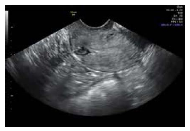
Figure 1. Transvaginal ultrasound can be used for in-office diagnosis.

We included patients with symptomatic niche with a diagnosis made by transvaginal ultrasound, saline sonogram, or pelvic MRI, and confirmed via hysteroscopy, as demonstrated in Figures 1 and 2. Those excluded were patients who had any congenital uterine anomalies.