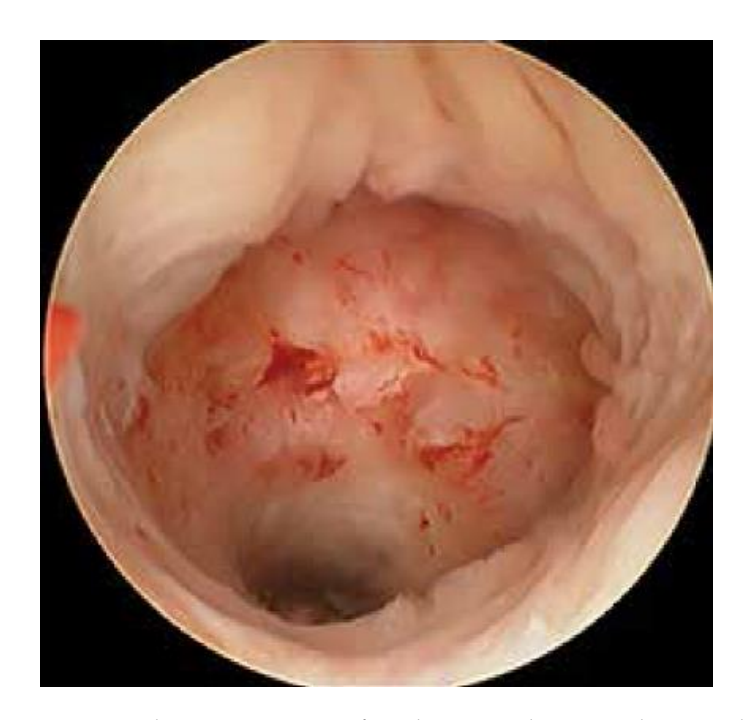
Figure 2. A hysteroscopic view of a niche. Notice the outpouching into the anterior lower uterine segment.

Our surgical protocol was as follows: With the patient under general anesthesia and in a dorsal lithotomy position, the bladder is emptied. Video hysteroscopy is then performed to confirm and visualize the defect. The abdomen is entered via a video laparoscope. The light from the video hysteroscope is easily visualized laparoscopically by the thinned myometrium in the area of the defect. At this point, a bladder flap is developed by reverse vesicouterine fold dissection technique to mobilize the bladder inferiorly, as described previously [17]. This technique is ideal for patients with dense adhesions between the bladder and the lower uterine segment. Using an inferior to superior sweeping motion with a blunt probe, the bladder is dissected off the uterus from an unscarred plane.